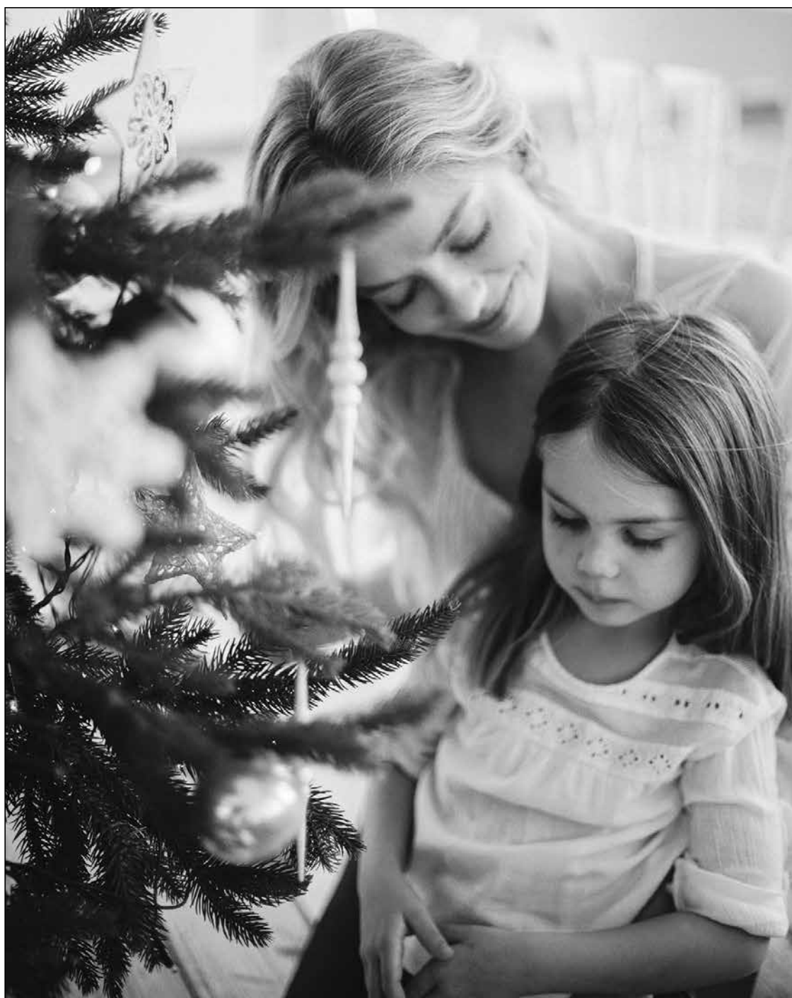
The holiday season is a complex time that can amplify both the highs and lows of life.

Plan for managing stress. Whether it's taking a walk, reading or cooking with loved ones, identifying activities that bring calm and joy can be a