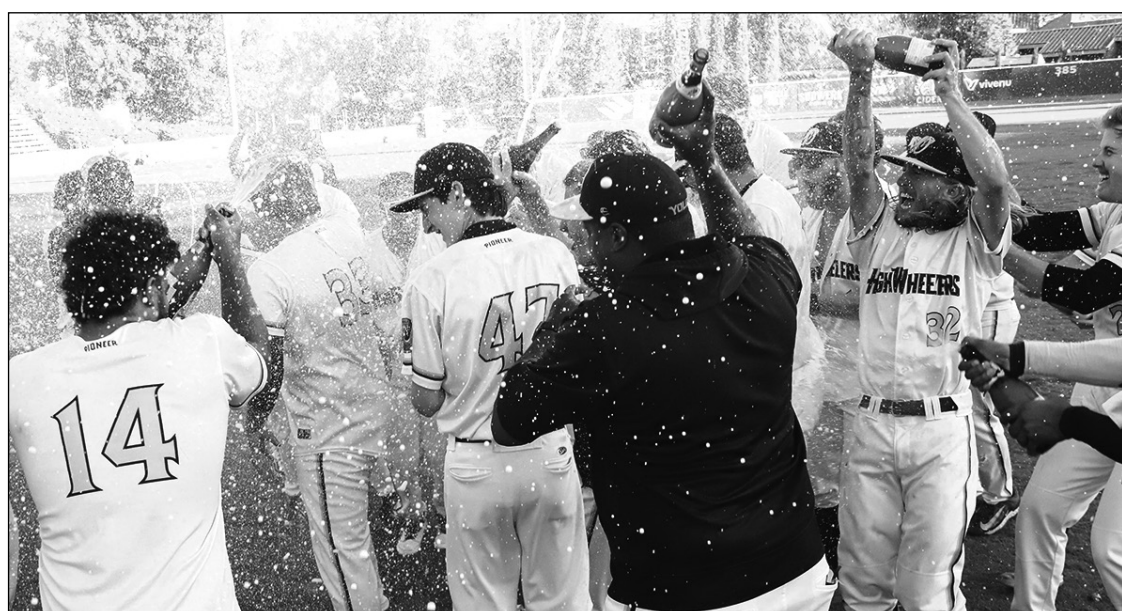
High Wheelers celebrate their Pioneer Baseball League Championship in September 2024.

The High Wheelers are the latest addition to the Pioneer Baseball League (PBL), a Major League Baseball (MLB) partner league established in 1939, and the second team in the league's west coast expansion, following the Oakland Ballers. The league has a strong history of player development, sending multiple players to the MLB teams each season. As a part of the team's relocation the High Wheelers will be renamed the Yuba-Sutter High Wheelers. In an effort to honor