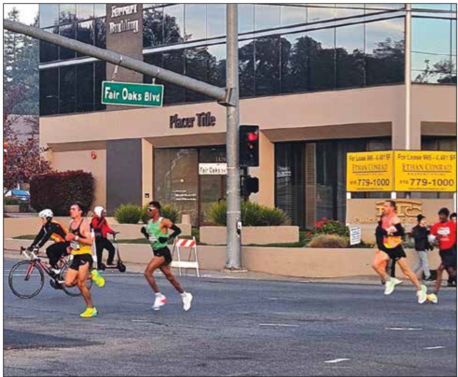
The CIM lead runners cross Madison Avenue at approximately 7:30 am. on Sunday Dec. 8.

The race started sharply at 7 a.m., but the day for many of the runners started much earlier as they stowed gear and boarded transport busses as early as 5 a.m. The trek took runners through the communities of Folsom,