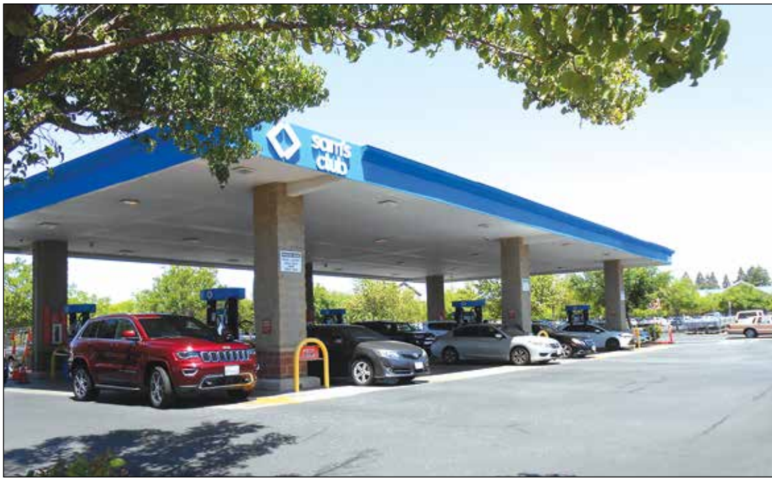
The City of Citrus Heights is hoping to add two fuel bays to the current Sam's Club gas station.

When their fueling is complete, they exit by turning right into the main Sam's Club parking lot and then turn back toward