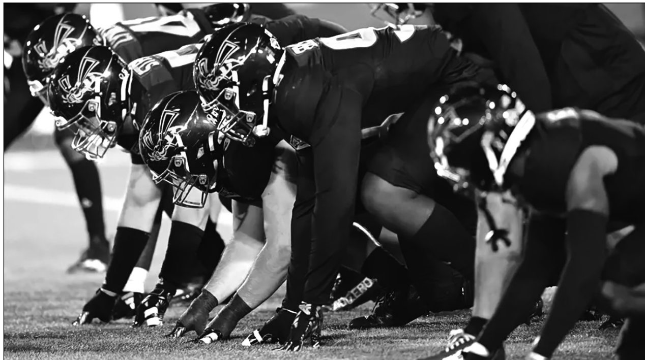
The Hornet defensive line poised to make a big play.