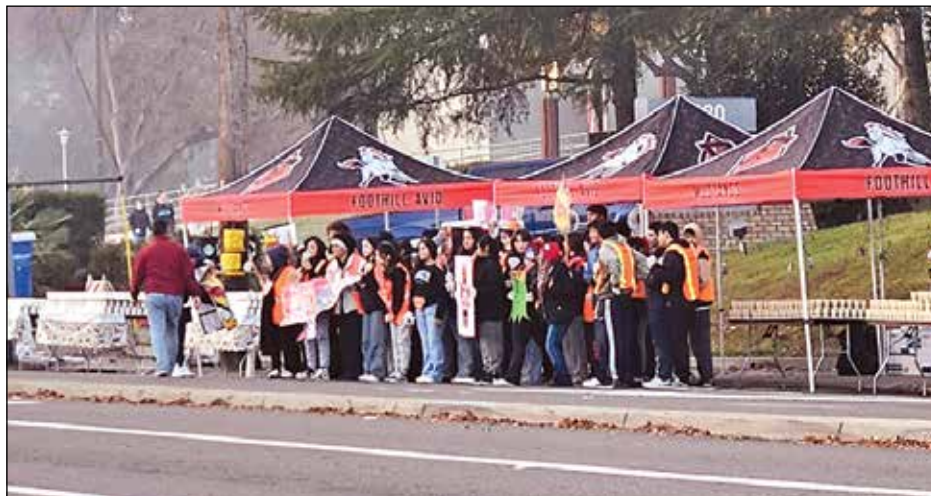
The hydration station at Madison Avenue at the 8.5-mile mark of the marathon is staffed by some of the army of volunteers needed to support the race.

In terms of the regional economy, Torkalson provides these statistics, "CIM alone provides greater than $13 million in