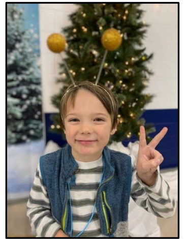
More pictures can be found on the school Facebook page.