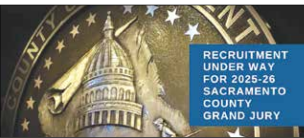
The Sacramento County Grand Jury is appointed to provide oversight of county, city, school and special district agencies and operations within Sacramento County.