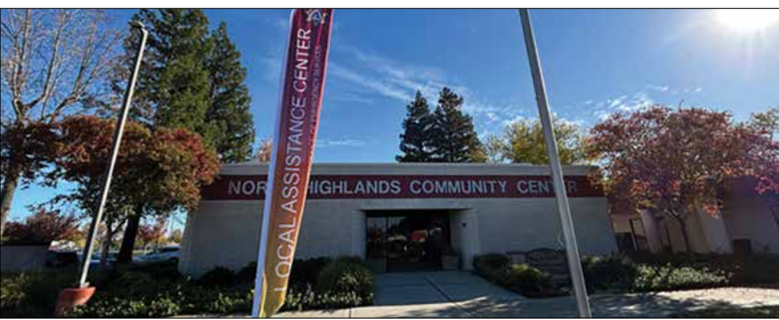
A Local Assistance Center was recently put in place in North Highlands following an apartment fire.