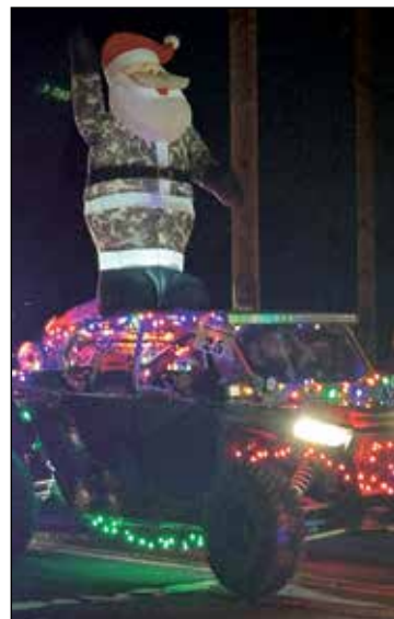
A Santa decked out in camouflage makes his way down the parade.