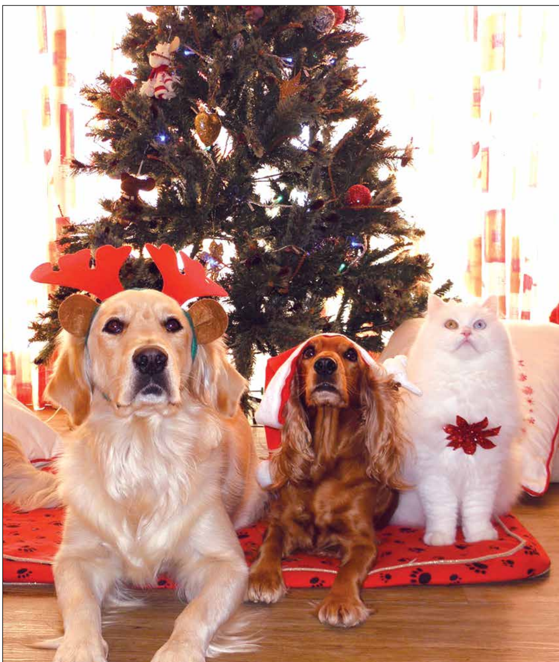
Take a cute holiday photo together, give them a special gift or spend extra time snuggling to show how much they mean to you.

going, homes can become chaotic during the holidays. Create a calm, safe space for your pet.