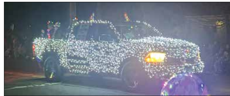
A pickup truck lights up the entire town with its intricate lights.

Next year’s Rio Linda Christmas Light Parade is already being planned. For more information, visit www.rlechristmasparade.com . ★