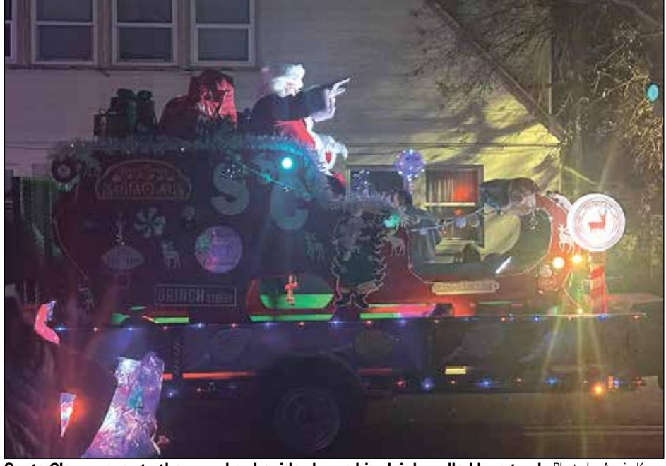
Santa Claus waves to the crowd as he rides by on his sleigh, pulled by a truck.

the atmosphere by selling light-up balloons and hot dogs. Despite heavy rain earlier in the day, the weather cleared just in time for the parade, leaving behind a full moon over the event.