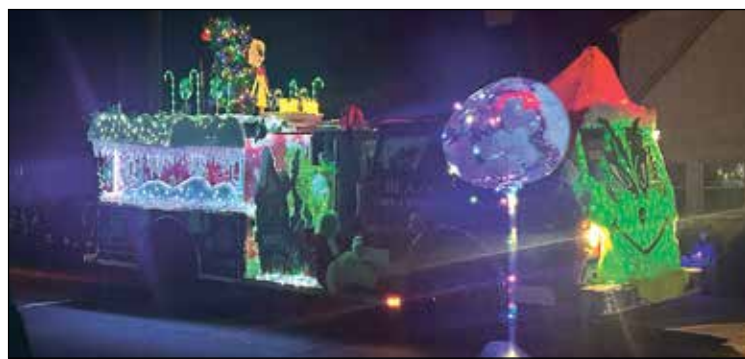
Second-place went to Blaze Fire and Rescue, who transformed a firetruck into the ultimate Grinch-mobile.

One of the standout features of this year’s parade was the sheer creativity on display. Many participants embraced the holiday spirit with lights galore, with several floats paying homage to beloved Christmas movie characters. Multiple Grinches floated by, spreading mischief and joy. Buddy the Elf took to the streets