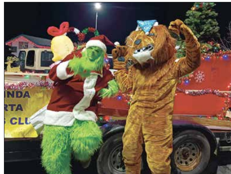
The Rio Linda Lions Club took home third-place for its Grinch-themed float, including all the characters from the story.