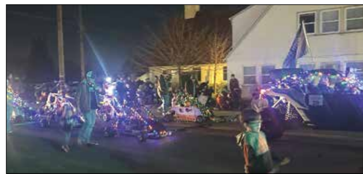
Youth Riders pulled multiple children on miniature ATVs, wowing the crowd.