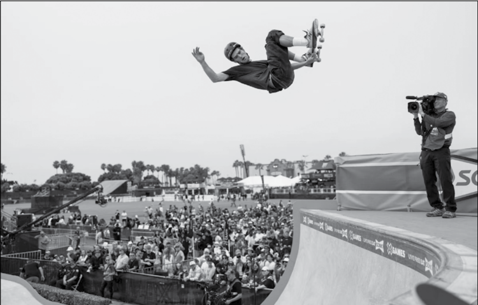
X Games 2025 will take place at Cal Expo in Sacramento.