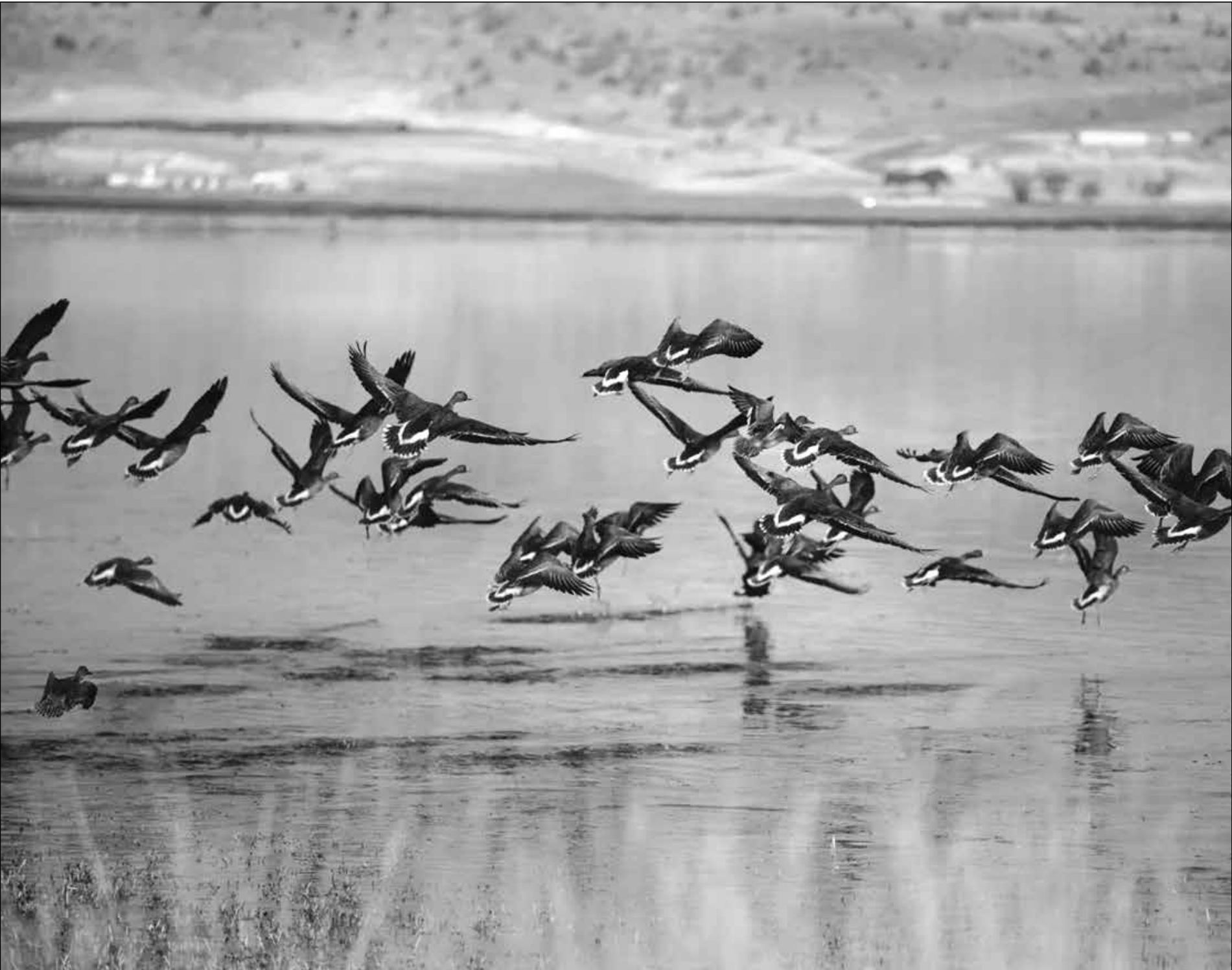
A flock of geese takes off on a flooded-out field at the Lower Klamath National Wildlife Refuge on Nov. 1, 2023. A strain of bird flu circulating in California has infected thousands of cattle and several dozen people.