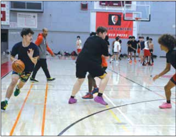
The Lancers have some promising young talent who figure to play key roles this season.