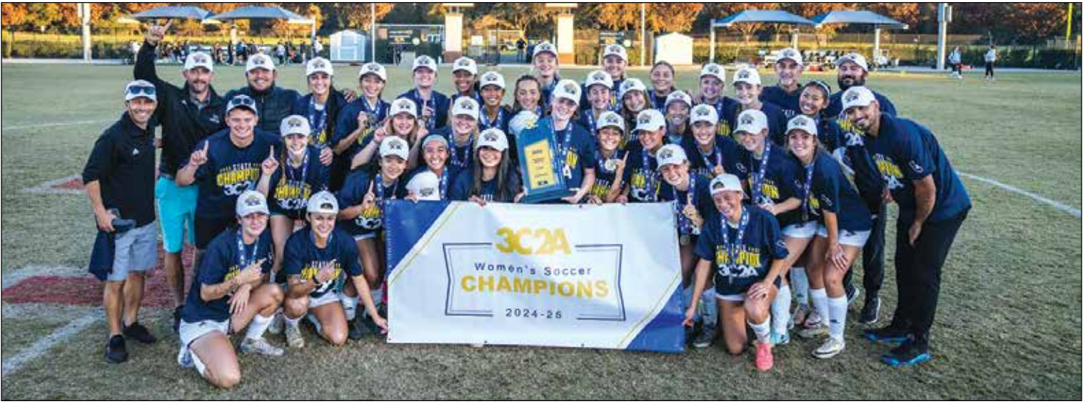
The Folsom Lake College Falcons have solidified their dominance in women's soccer, claiming their second consecutive 3C2A State Championship with a thrilling 2-1 victory over the Cypress College Chargers on Sunday, Dec. 8, at American River College.

Just before halftime, the Falcons struck again. In the 44th