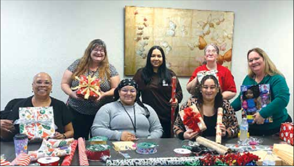
Organized by the Department of Child, Family and Adult Services, the Gifts from the Heart program relies on the generosity of volunteers and donors.