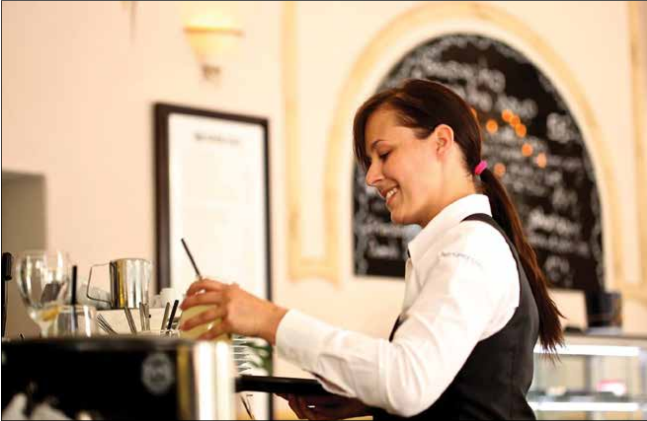
Starting Jan. 1, 2025, many significant new laws will go into effect across California, impacting everything in daily life from traffic regulations, employment, housing to healthcare.