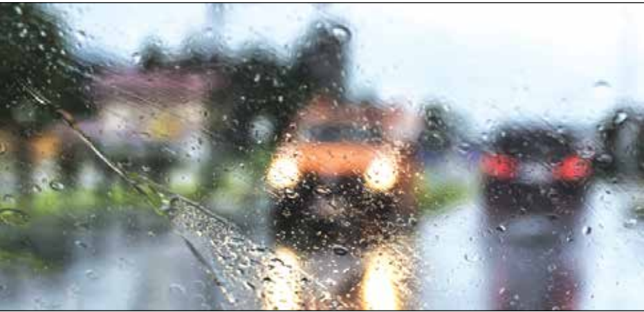
It is important to always reduce vehicle speed when it's raining.