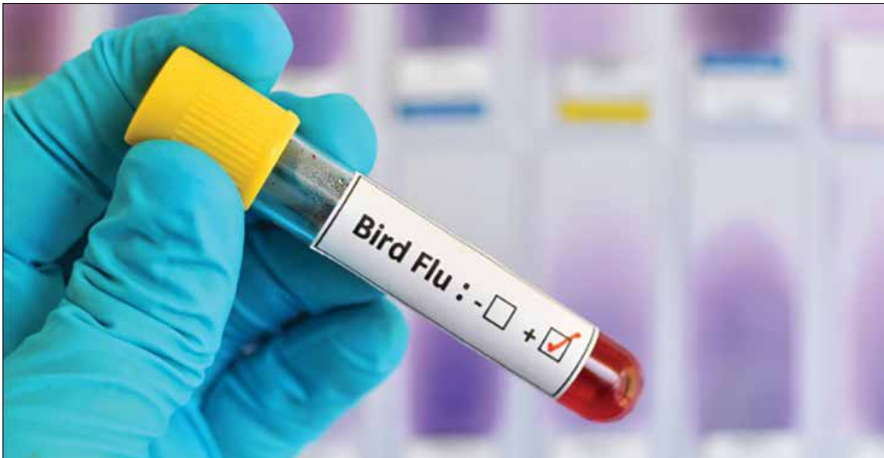
Sacramento County Public Health (SCPH) is actively monitoring the bird flu situation locally and coordinating with state and federal agencies.

California Department of Public Health News Release