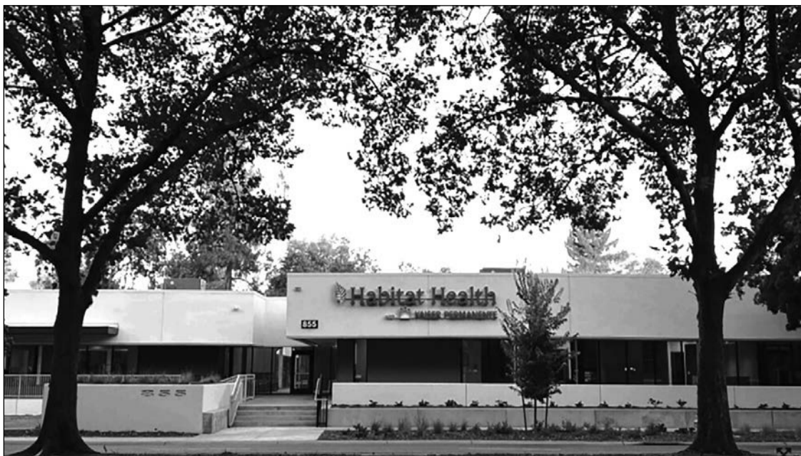
Habitat Health with Kaiser Permanente Sacramento PACE Center is located at 855 Howe Ave.

Habitat Health provides comprehensive medical and social care to eligible older adults to help them maintain their independence and stay in their homes and communities. Through the partnership, Habitat Health with Kaiser Permanente PACE participants have access to Kaiser Permanente's industry-leading clinical expertise and sophisticated network of health care services. These services are typically provided at no cost to program participants who are eligible for Medicare and Medi-Cal coverage.