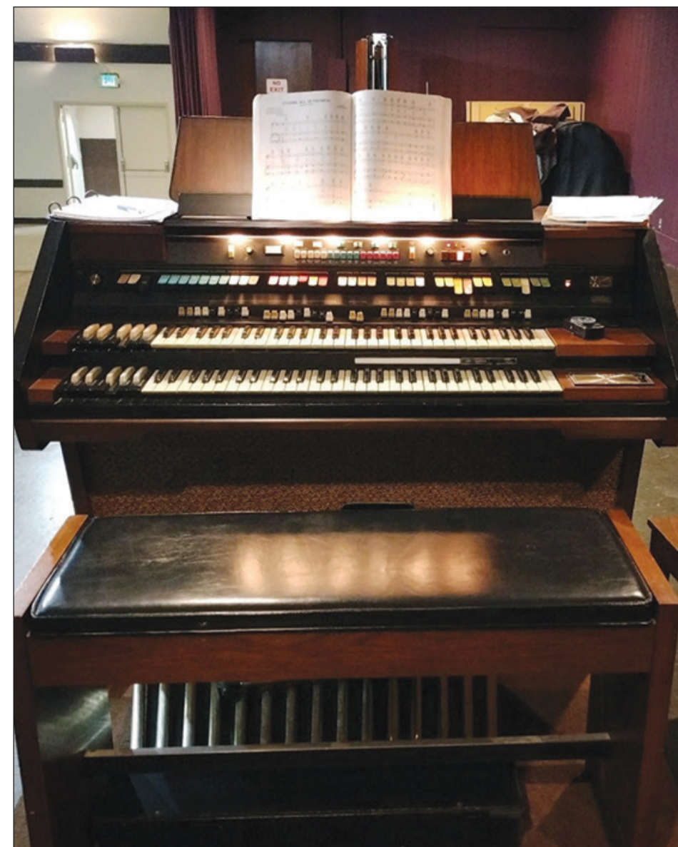
Hammond Concord organ circa late 1970s.