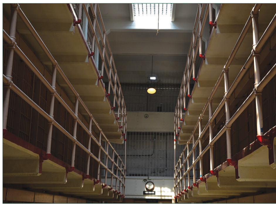
Prop 36, approved by California voters in November, includes heavier consequences for petty theft and shoplifting offenses.