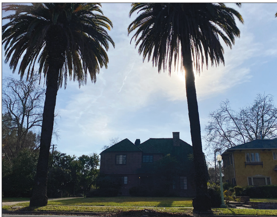
The old Rohwer home was sold in 2012.