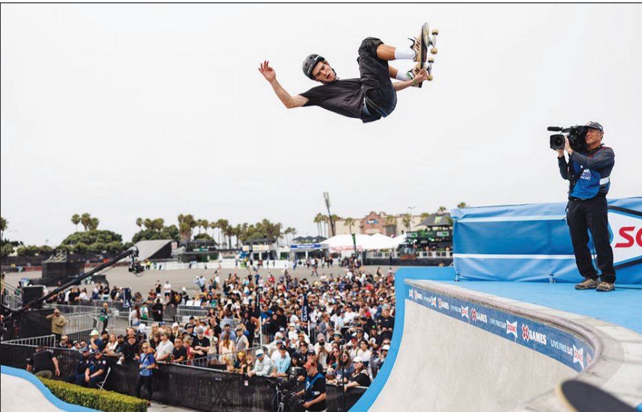
X Games 2025 will take place at Cal Expo in Sacramento.