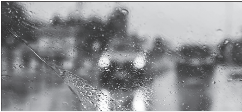
It is important to reduce vehicle speed when it's raining.

Make sure your pets have a warm, draft-free