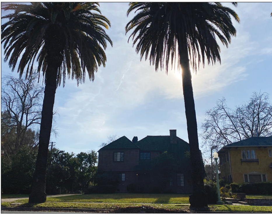
The old Rohwer home was sold in 2012.