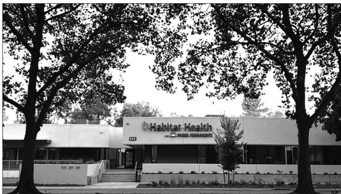
Habitat Health with Kaiser Permanente Sacramento PACE Center is located at 855 Howe Ave.

Habitat Health provides comprehensive medical and social care to eligible older adults to help them maintain their independence and stay in their homes and communities. Through the partnership, Habitat Health with Kaiser Permanente PACE participants have access to Kaiser Permanente's industry-leading clinical expertise and sophisticated network of health care services. These services are typically provided at no cost to program participants who are eligible for Medicare and Medi-Cal coverage.