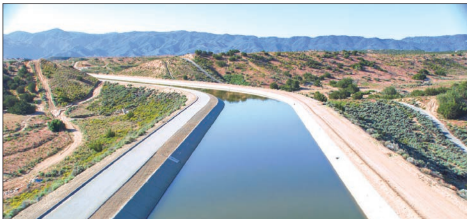
Above average precipitation and snowpack allow for an increase in planned water deliveries for 2025.