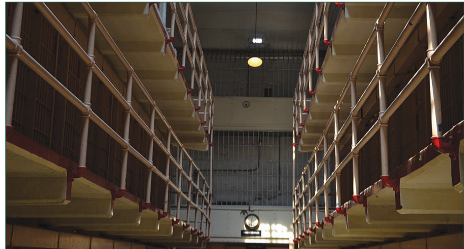
Prop 36, approved by California voters in November, includes heavier consequences for petty theft and shoplifting offenses.