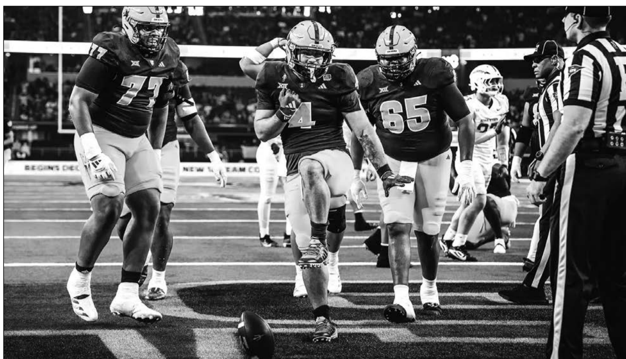
Rio Linda High School alumnus Cam Skattebo won Offensive Most Valuable Player Award for the 2024-25 Peach Bowl played in Atlanta on Jan. 1.

"There's nobody out there that can stop me," Skattebo said. "If they're studying hard, there's a reason. I have full respect for them, because they understand what they're playing against, and that's why I love playing in games like this, because they constantly look at me as a