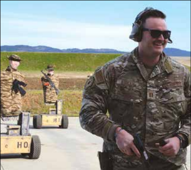
U.S. Air Force Capt. James Stocks, 9th Security Forces Squadron (SFS) commander, participates in mobile target training at Beale Air Force Base on Jan. 13. The 9th Security Forces Squadron trained with artificial intelligence-driven robots to enhance various weapon engagement skills, giving Airmen an advanced method of training.

BEALE AIR FORCE BASE, CA (MPG) - The smell of smoke and the deafening sound of bullets filled the air as Airmen directed the rounds of M249 light machine guns at human-like, robotic targets, one after another. When hit, these mannequin-like targets slump over, giving positive indication of a lethal shot. The 9th Security Forces Squadron (SFS) conducted a 3-day exercise using autonomous robots equipped with innovative technology to replicate the movement of real-life opposing forces.