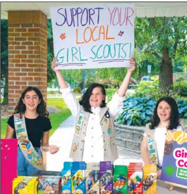
Local Girl Scouts show enthusiasm for cookie season.