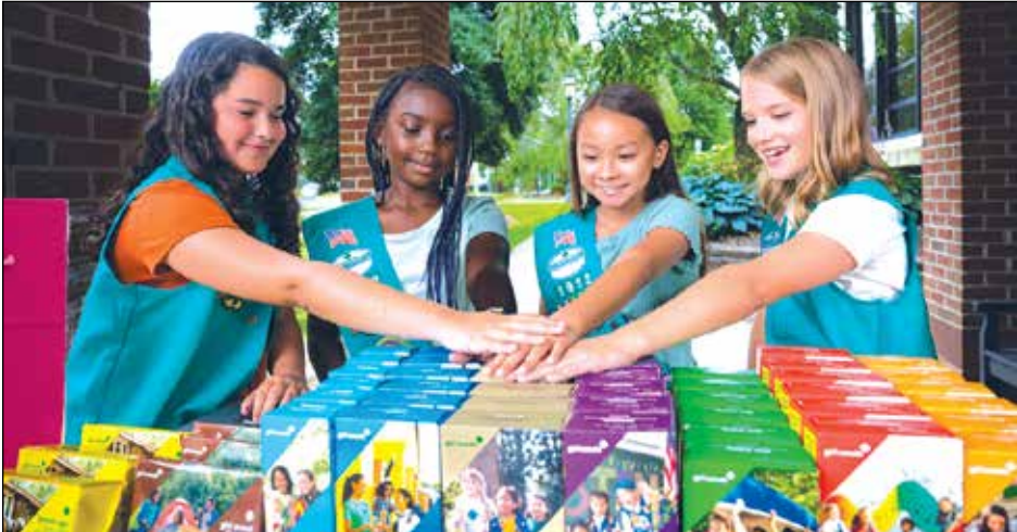
Girl Scouts of Northern California with their cookie display.