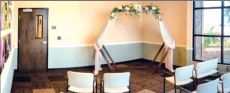
Butte County couples can get married on Valentine’s Day at the County Clerk-Recorder’s Department.