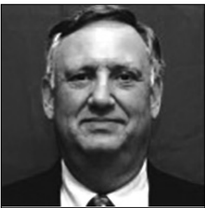
By Dan Walters, CALMatters.org

It would be impossible to overstate the complexity of water supply management in California.