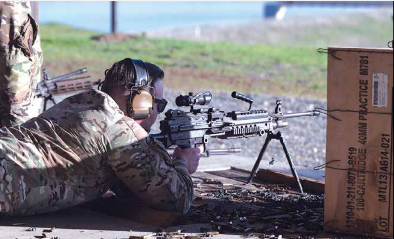
U.S. Air Force Capt. James Stocks, 9th Security Forces Squadron (SFS) commander participates in mobile target training at Beale Air Force Base on Jan. 14. The 9th Security Forces Squadron conducted a three-day exercise using autonomous robots equipped with innovative technology to replicate the movement of real-life opposing forces.