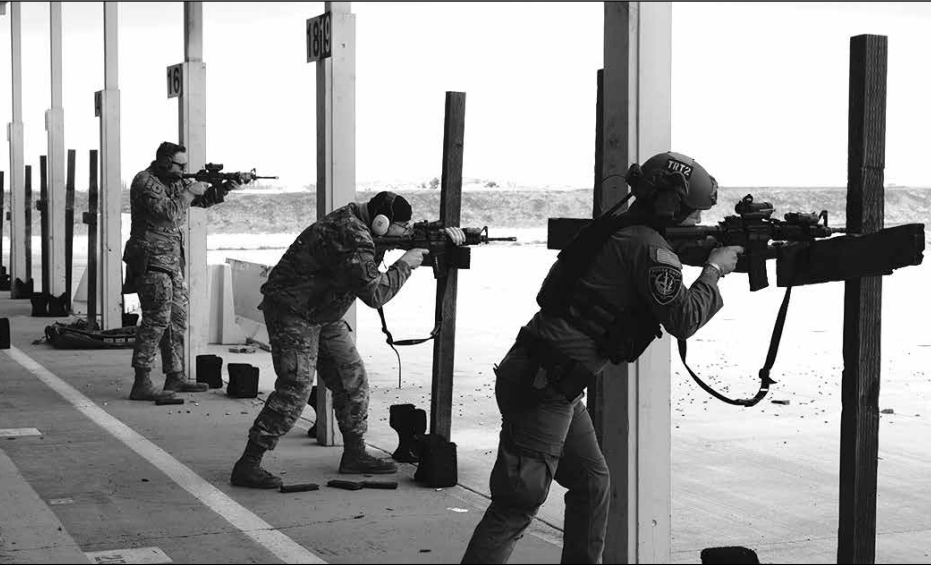
U.S. Air Force Airmen from the 9th Reconnaissance Wing use M4 carbines to fire at mobile robot targets at Beale Air Force Base on Jan. 13. The 9th Security Forces Squadron conducted an exercise using smart live fire targets to increase the lethality and capability of Airmen.