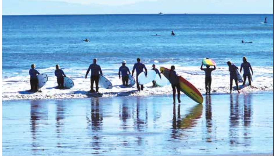
Teen Adventure Group (TAG) members run into the ocean on their Santa Cruz surfing trip on Jan. 11.