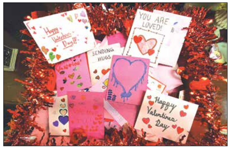
The girls are confident they will reach their goal of 1,200 cards this year.

students from area high schools and providing them with the tools and public speaking points to launch the program on their own campuses.