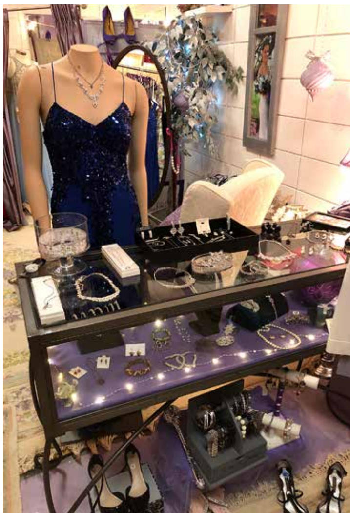
In addition to more than 1,000 dresses to loan, Jackie's Boutique inside Milford High School also loans accessories.