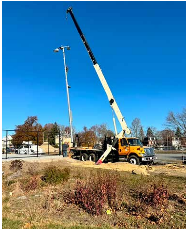
Pickleball courts and light pole being installed.

Fenced-off areas around the construction area are off limits to the public, the town website warns.