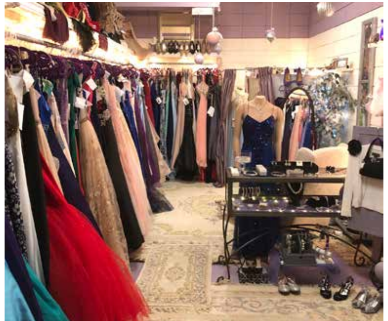
Jackie's Boutique offers an individual salon-style experience to girls looking for prom dresses.

Jackie's Boutique lends dresses not just for proms but for other community events as well, including the Milford Youth Center Fashion Show and the Best Buddies Pageant – Jackie was a member of the MHS Best Buddies chapter while in high