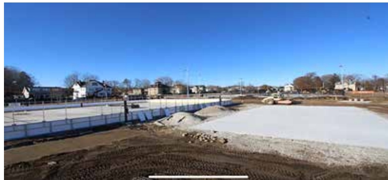
Street hockey and basketball courts (left) and concrete pad (right) where fitness court will be installed.