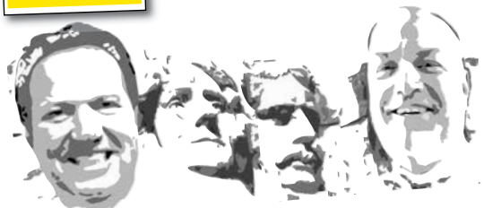
"Keep Those Presidents In Your Wallet!"