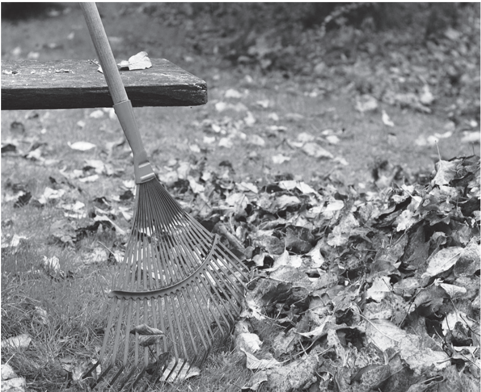
The final day to put out leaf piles for collection was Feb. 3.