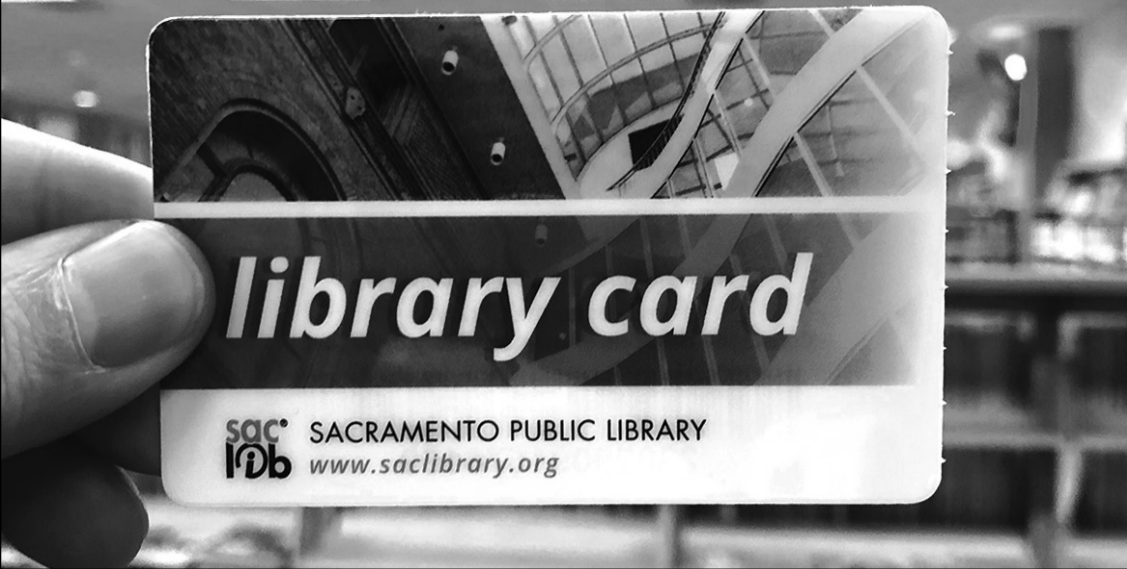
Having a library card provides access to more than just books and magazine on shelves in the library; the card also gives you access to digital access to resources impacting our daily routines as well as our long-term goals.

Pronunciator and Transparent Languages are perfect for anyone wanting to learning a new language or brush up on language skills.