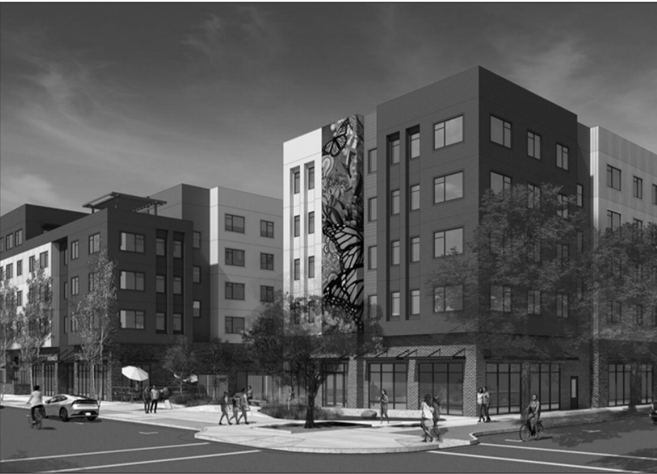
Here is an architectural rendering of the mixed-use affordable housing project planned at 805 R St.