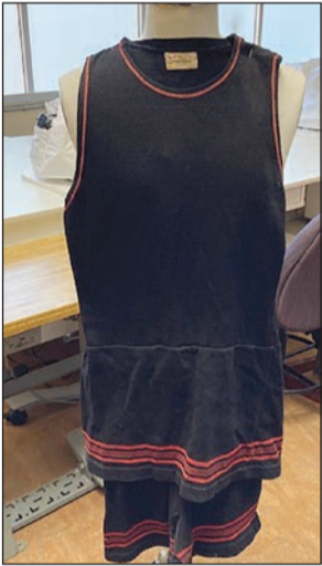
Historic swimwear is included in the Sac City College retrospective that spans 200 years of fashion.

Continued from Page 1 hydraulic lifts enabling various heights for cutting fabric, making patterns, and sewing; and software that designs two- and three-dimensional patterns, although students also learn the craft by hand first. This is a far cry from your great-grandmother’s treadle sewing machine. Giovannetti says, “The curriculum was drafted to match two worlds, fashion and costume, and the goal is for our students to get a job in their chosen field after they leave us.” The exhibit will feature men’s, women’s and children’s garments from between 1770 and 1970. From the earliest, a child’s doublet, to swimsuits from a California manufacturer, including a men’s wool onesie from the early twentieth century; to a velvet opera coat, late 1880’s wedding gown, the finery of beaded capelets and dresses, corsets, crinolines, dusters and much more. Research has been conducted on all the garments being shown for accuracy