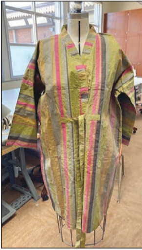
A 1960s coat made from paper is part of the 200 years of fashion exhibit at Sac City College.

in dating. Technological innovations advanced the progression of fashion over the last 200 years from the needle for hand sewing to the spinning wheel and sewing machine. Fashion eras can be seen throughout the displays from floor-length hoop skirts and bustles to slimmer silhouettes and ultimately rising hemlines. Hustle your bustle to the Sac City Joan Didion