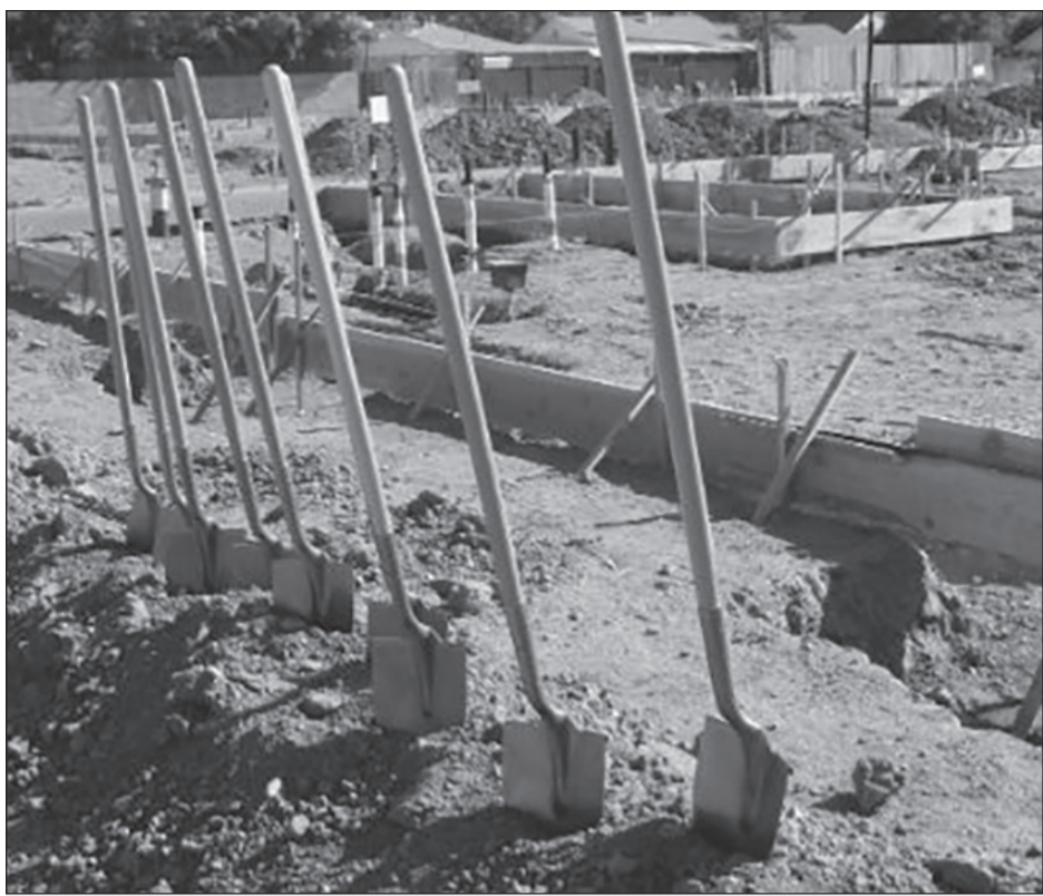
The City of Sacramento is presenting a full-day workshop on the Small Developer Incubator Program on March 8.

The workshop is scheduled from 9 a.m. to 5 p.m., at Oak Park Community Center, 3425 Martin Luther King Jr. Blvd., Sacramento. Registration for the event can be accomplished through the program website at www.incrementaldevelopment.org/events/sacramento-workshop .