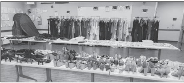
The Sacramento Public Library is hosting 17 free prom giveaway events across the region.

March 29 will feature prom giveaway events at