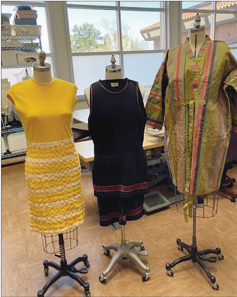
An exhibit at Sac City College, opening on March 3, will display a collection of amazing garments in a retrospective that spans 200 years of fashion.

Learning Resource Center for a fun and eye-catching 200 years of fashion exhibit where I am sure a leg-of-mutton sleeve will be making an appearance. The exhibit, located on the third floor of the Joan Didion Learning Resource Center, is open Monday through Friday 8 a.m. to 4 p.m., and Saturday 9 a.m. to 3 p.m. Closed Sunday and Holidays. On Campus parking is $2 daily. ★