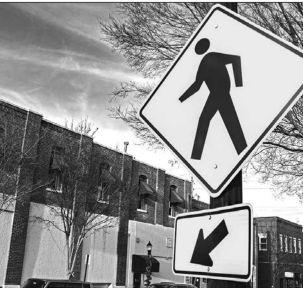
The Sacramento County Office of Education received grant funding to provide middle schoolers with program activities to increase bicycle and pedestrian safety.

The Sacramento County Office of Education has been a recipient of this grant since 2015 and looks forward to continuing the important countywide project. The goal is to help middle school youth develop attitudes and habits that promote lifelong traffic safety values, building a foundation that helps students make safe decisions when they become teen drivers. Working with Safety Center Incorporated and other community partners, the county Office of Education will use the grant to increase bicycle helmet compliance for youth (ages 5 to 18).