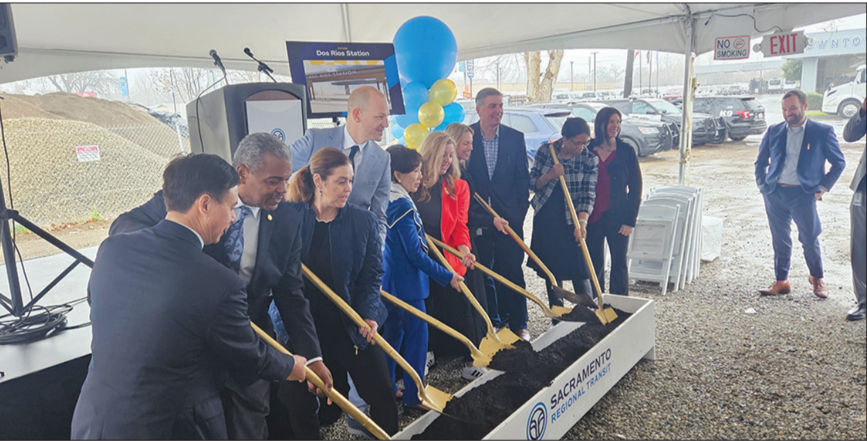
On Feb. 19, Sacramento-area elected officials and local dignitaries participated in a groundbreaking ceremony for the new Dos Rios Light Rail Station.

By Daniel Canfield SACRAMENTO, CA (MPG) - Light rail train cars, running along Sacramento Regional Transit District's (SacRT) Blue Line, whiz through the Sacramento River District every few minutes. The light rail train cars have never stopped to pick up riders in the River