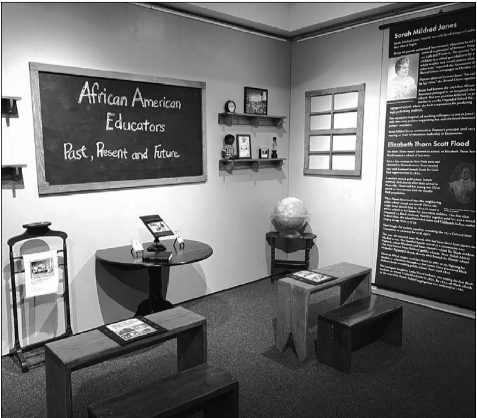
Here is part of the Sacramento History Museum Black History exhibit.

Sacramento History Museum will present "The West End Blues," a night of entertainment from the Harley White Jr. Orchestra, offering a blend of history and