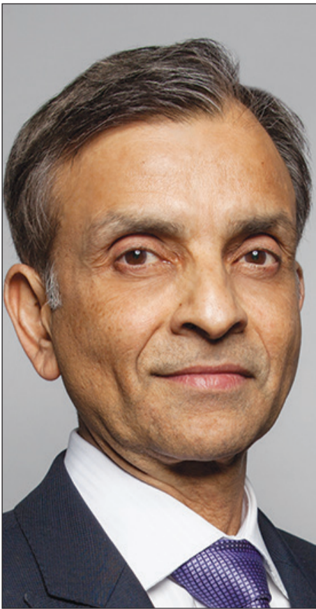
Vivek Ranadivé is owner and chairman of the Sacramento Kings.

through service. Attendees will also hear from key downtown stakeholders including Kaiser Permanente, Sacramento Kings and SMUD. The 2025 State of Downtown program is presented by Kaiser Permanente and sponsored by Sacramento Kings, SMUD, Tsakopoulos Investments, the Athletics, Stantec, Dignity Health, CBRE, Golden 1 Credit Union, Sutter Health, MarketOne, SAFE Credit Union, Delfino Madden O’Malley Coyle & Koewler, Hensel Phelps, LDK Ventures, F&M Bank, Sacramento Asian Pacific Chamber of Commerce, Colliers, California State University Sacramento, KFBK News Radio, Sactown Magazine and Comstock’s Magazine. For more information about the State of Downtown, go to downtownsac.org/downtown-sac-experiences/state-of-downtown . ★