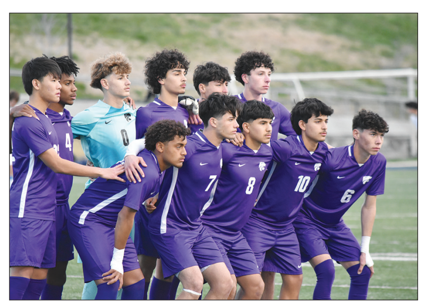
The team was looking to avenge a first-round loss against Central Valley High School last year, by earning a section championship in 2025.

saves to keep the Wildcats up by a score at the 17-minute mark.