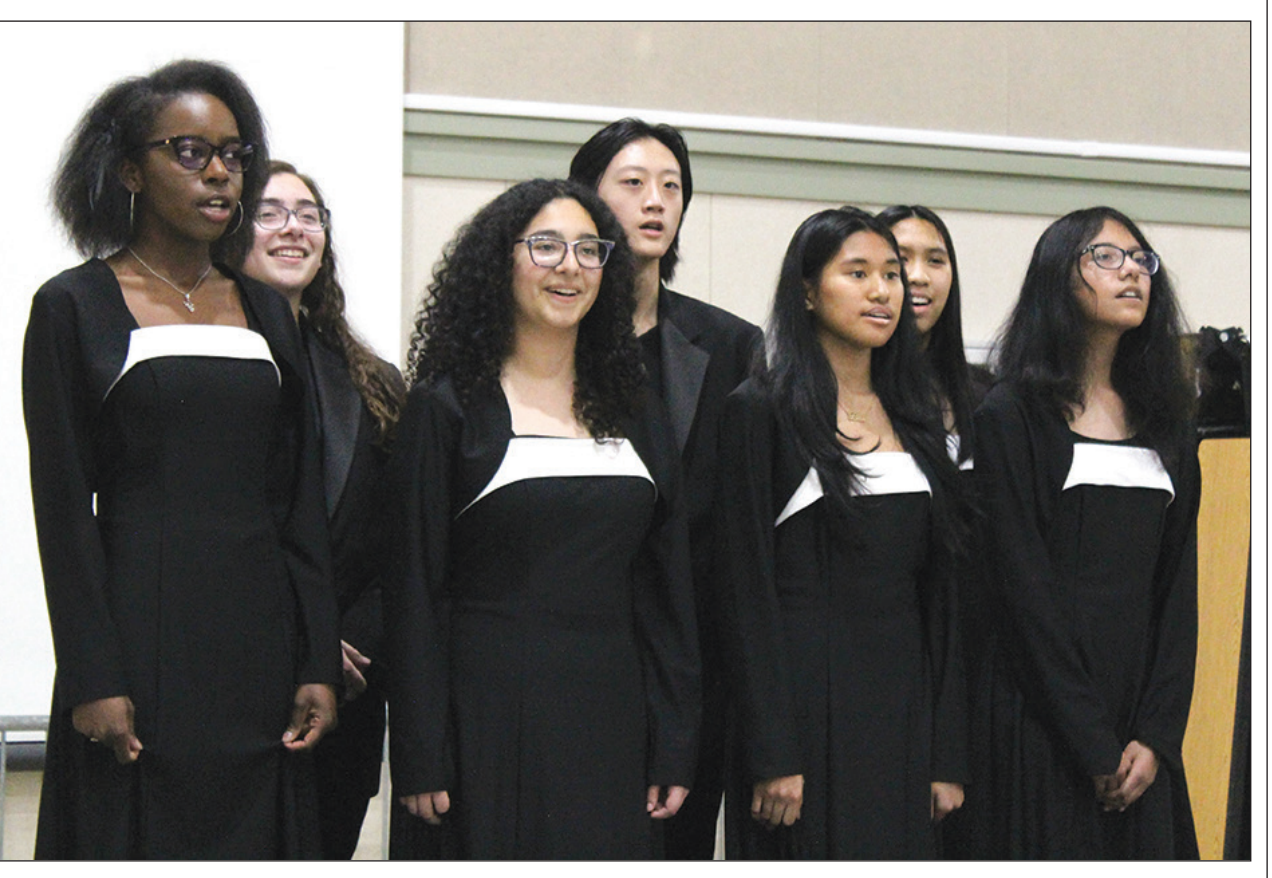
Monterey Trail's Vocal Ensemble Group kicked off the event by singing the Black National Anthem.