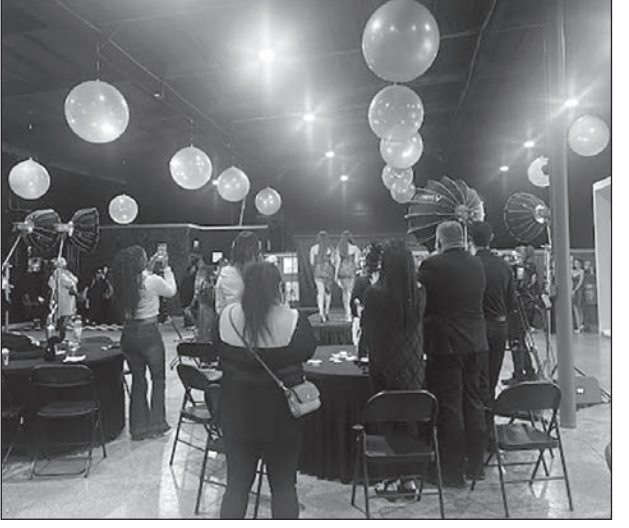
This photo shows the New Year's "Come Correct" party/ fashion show by Capitol Creatives.

"I came in here very young, and it was basically