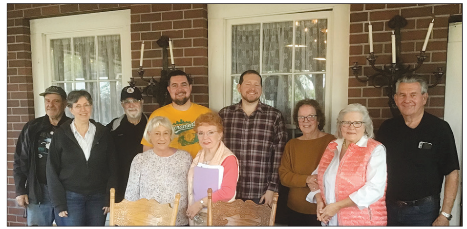
Elk Grove Historical Society directors pose for a photo on their board meeting day.

for the Historical Society's five fundraisers was called upon to report on their progress and share what else would be done before the date arrived.