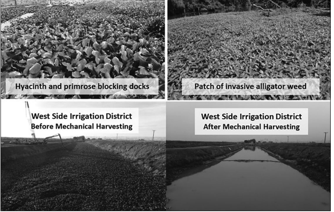
Starting March 20, the Division of Boating and Waterways will begin herbicide treatments.

form dense mats of vegetation, creating safety hazards for boaters and obstructing navigation channels, marinas and irrigation systems. Due to their ability to spread rapidly to new areas, the plants will likely never be eradicated from Delta waters. Therefore, Division of Boating and Waterways operates control programs as opposed to eradication programs. The division works with local, state and federal entities to better understand the plants and implement new integrated control strategies to increase efficacy.