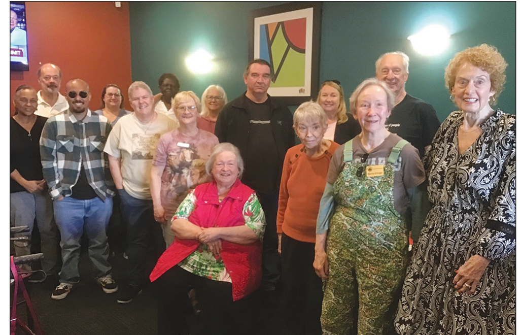
Local writers can have their works reviewed, gather tips and gain insight as members of the Elk Grove Writers Guild. The group meets monthly in Elk Grove and features a number of local published authors and writers.

An announcement was made about who would be speaking and what subjects they would cover at the upcoming Writers Guild Conference at the Holiday Inn on Oct. 25. An agent and editor will be attending to look over authors' work. Conference registration is only $60.