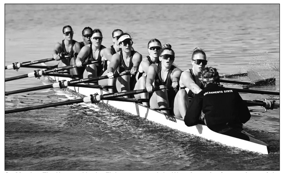
On March 8, The Hornets' Varsity Eight was named the West Coast Conference Crew of the Week.