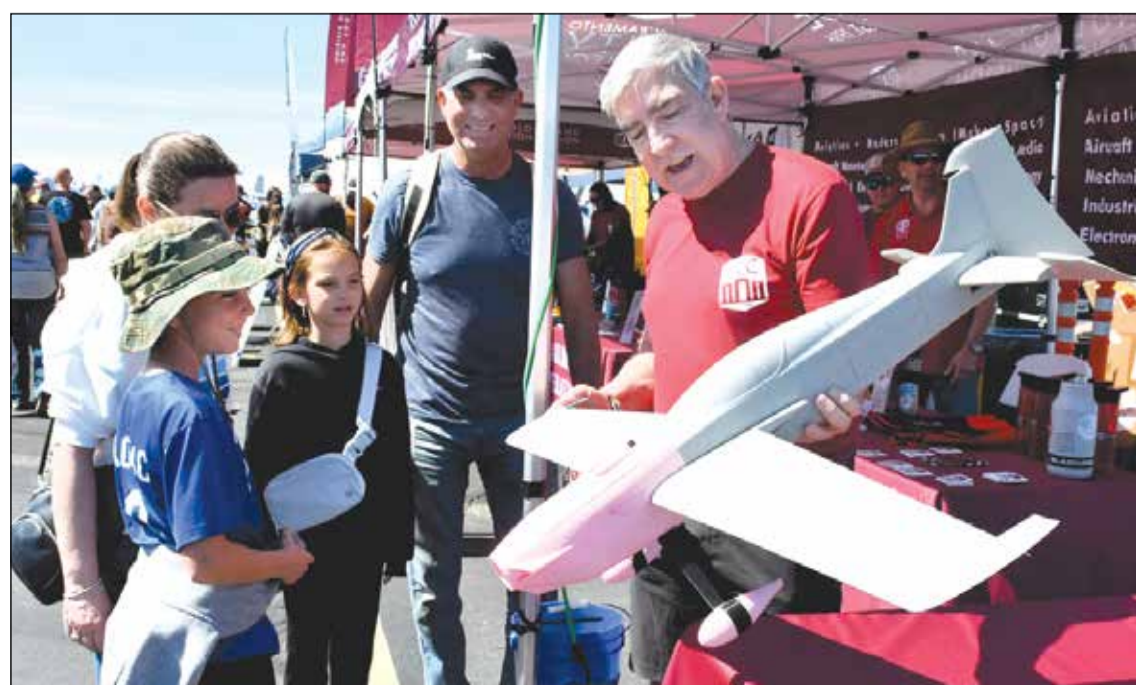
Although the airshow is primarily to entertain the community, the main event goal is to be a giant career fair to engage the youth.