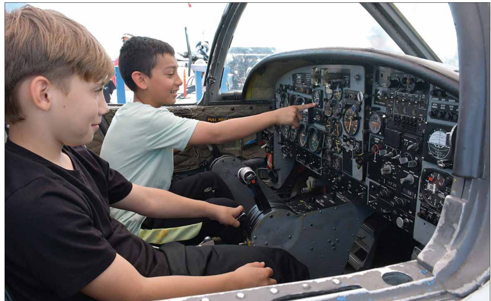
Since 2010, the Capital Airshow Group has offered a variety of programs year-round to teach the next generation about STEM, aviation and aerospace.