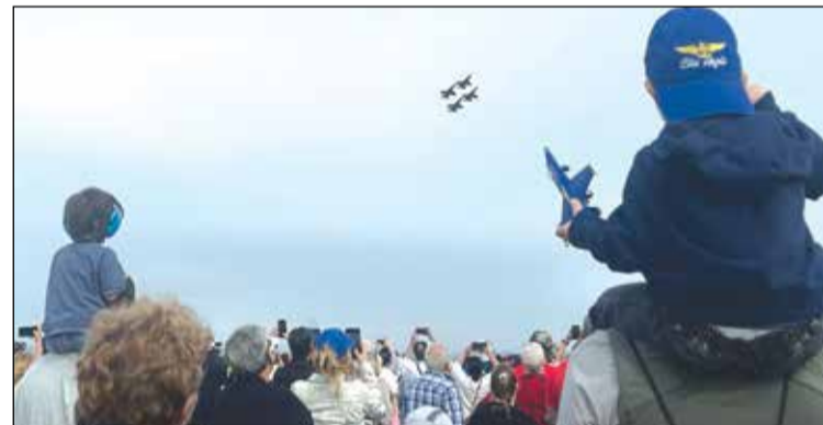
Children and their families look above to see the U.S. Navy Blue Angels' performance.