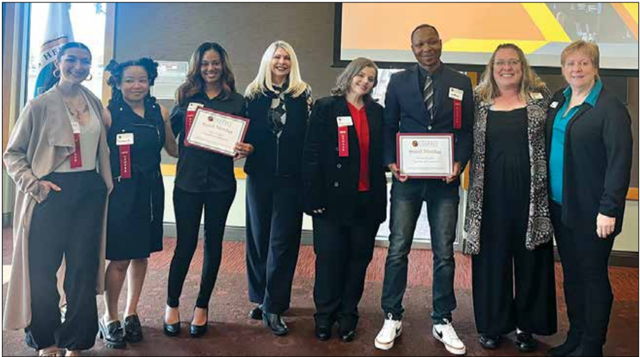
New Citrus Heights Chamber of Commerce members include Primerica and Aishas Hair Salon.