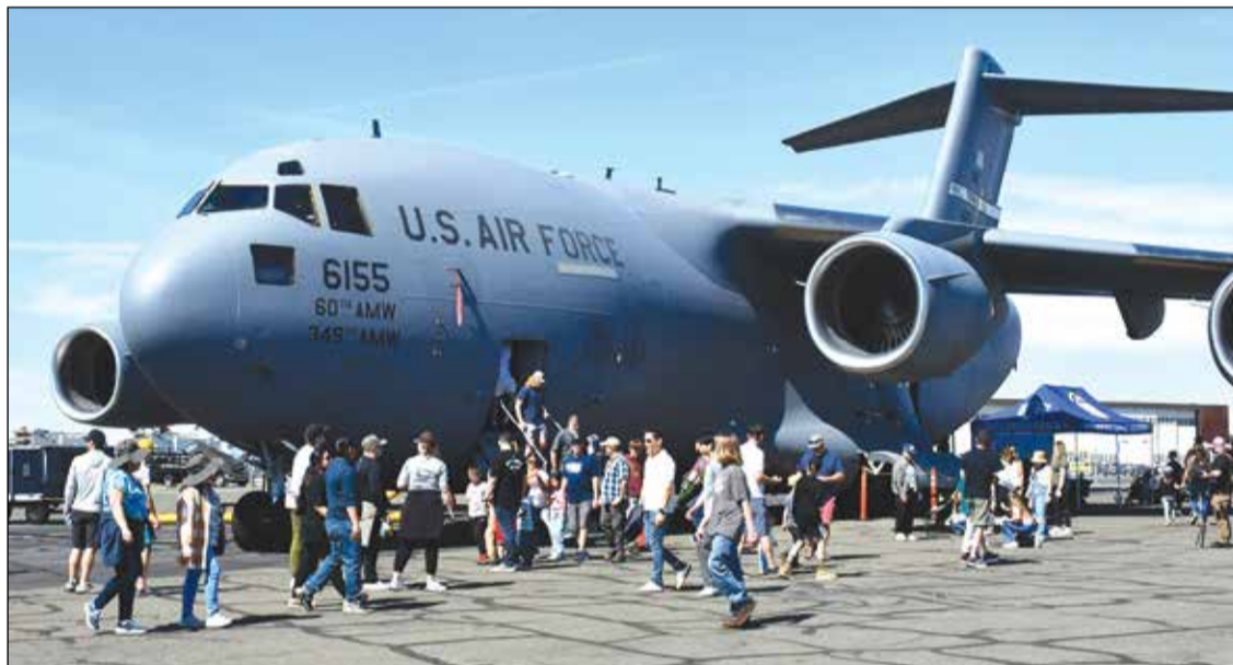
As part of the effort to engage youth with STEM, several aircraft were open to the public to go inside and explore the aircraft that the military uses.

"It's about learning about all the jobs that are out there and meeting someone who is cool and that'll talk about how they got there and what a day of their life looks like when