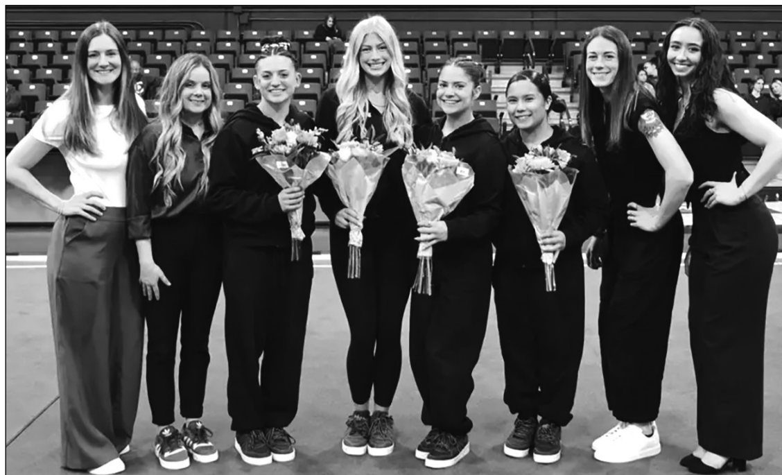
Sacramento State celebrated its senior gymnasts following the March 14 dual meet with UC Davis at The Nest.

The March 14 meet against UC Davis marked the third time in the last five meets that the Hornets topped the 195-point plateau, besting its previous season-high of 195.225 against the