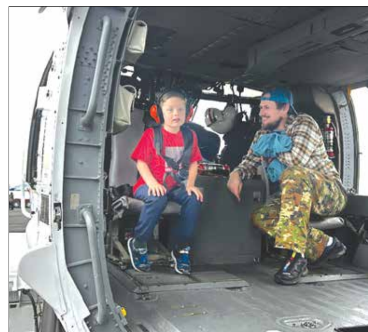
A Sacramento father and son sit on board a CAL FIRE helicopter.

Since 2010, the Capital Airshow Group has offered a variety of programs year-round to teach the next generation about STEM, aviation and aerospace. Free experiential learning opportunities are available to students. To learn more about the year-round youth programs, visit online californiacapitalairshow.com/year-round-youth-programs . ★