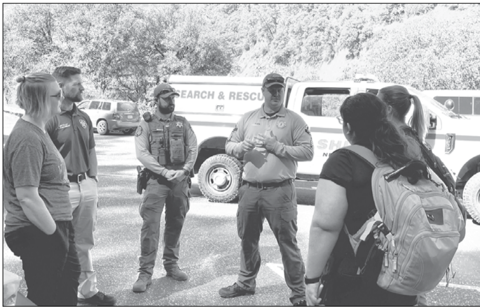
The remains of an unidentified individual were located by three hikers on the afternoon of March 25, near the South Yuba Fork Bridge in Nevada City.