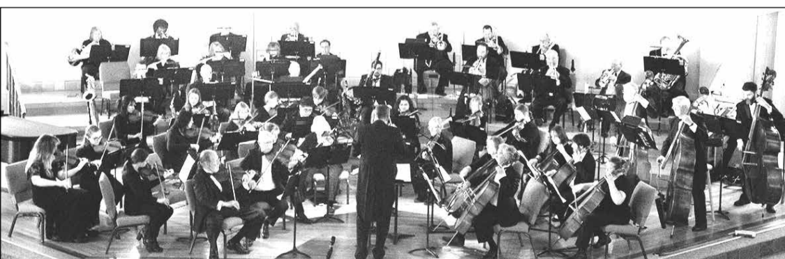
The Pops Concerts will feature music from Hollywood, Broadway and other musicals and will include many favorite melodies that all ages will recognize and enjoy.