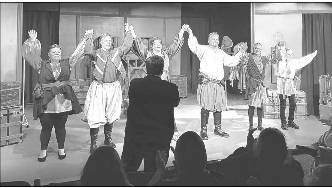
The cast of "Happy Birthday, Mr. Shakespeare" takes their first bow during opening night at The Acting Company in Yuba City on March 28. This original production will run weekends until April 20.