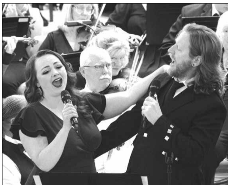
The Yuba Sutter Symphony is an arm of the Yuba Sutter Oratorio Society which has been providing music in our community for over 85 years.