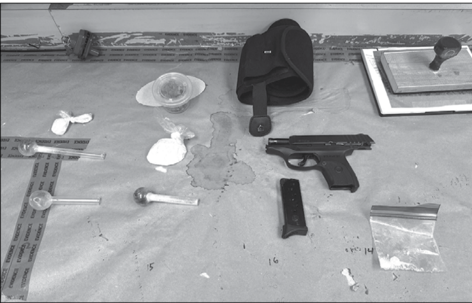
In total, Sutter County deputies seized approximately 2720 net grams of methamphetamine.