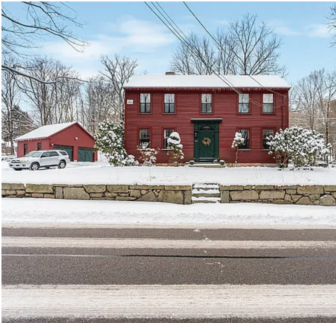
The 4-bed, 2-bath, 2,669-square-foot house at 192 Adams Street in Holliston recently sold for $855,000.