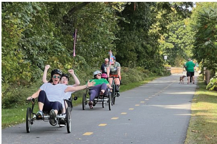
The Pink Granite Pedalers adaptive bike program on the Holliston Rail Trail. Image source: will be in Holliston in May.