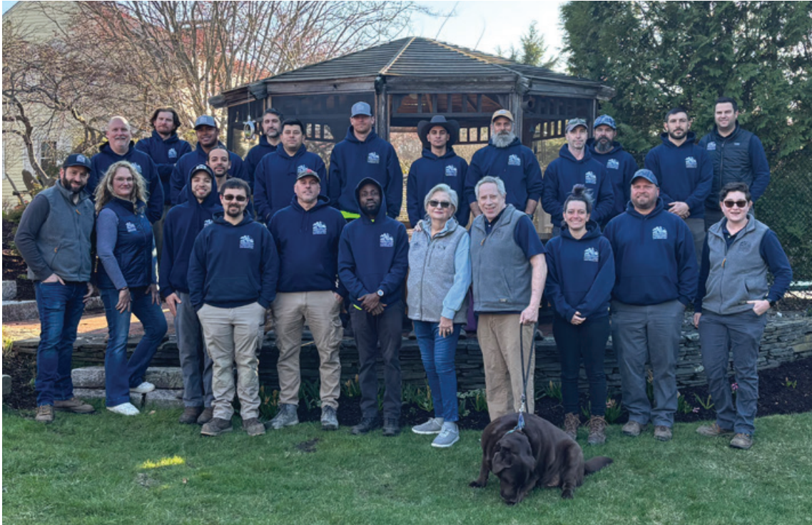
The Ahronian team at the beginning of the 2025 season.

Now, around twenty-five employees strong, Ahronian Landscaping takes on many more projects and thrives off the variety and quality of services they offer. They consider themselves a "group of doers" and work hard to ensure their clients are happy with the results. While Ahronian Landscaping has a major presence in Metrowest yards, they are also highly involved in the community at large. Sponsoring community events and projects in town is part of the company's mission to help create vibrant, inclusive communities by developing and enhancing spaces that bring people together. As leaders in the industry, they have a vast base of knowledge and experience, with all of their designers holding the Massachusetts Certified Horticulturist designation awarded by the Massachusetts Nursery and Landscape Association (MNLA). The company has been a member of the MNLA for decades,