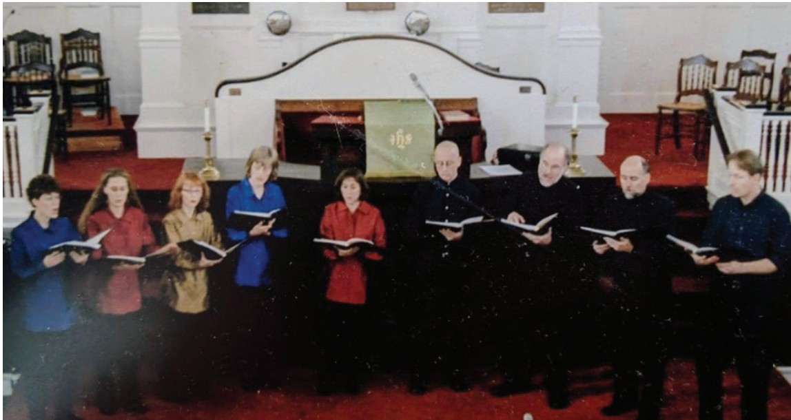
The MMS in earlier days: