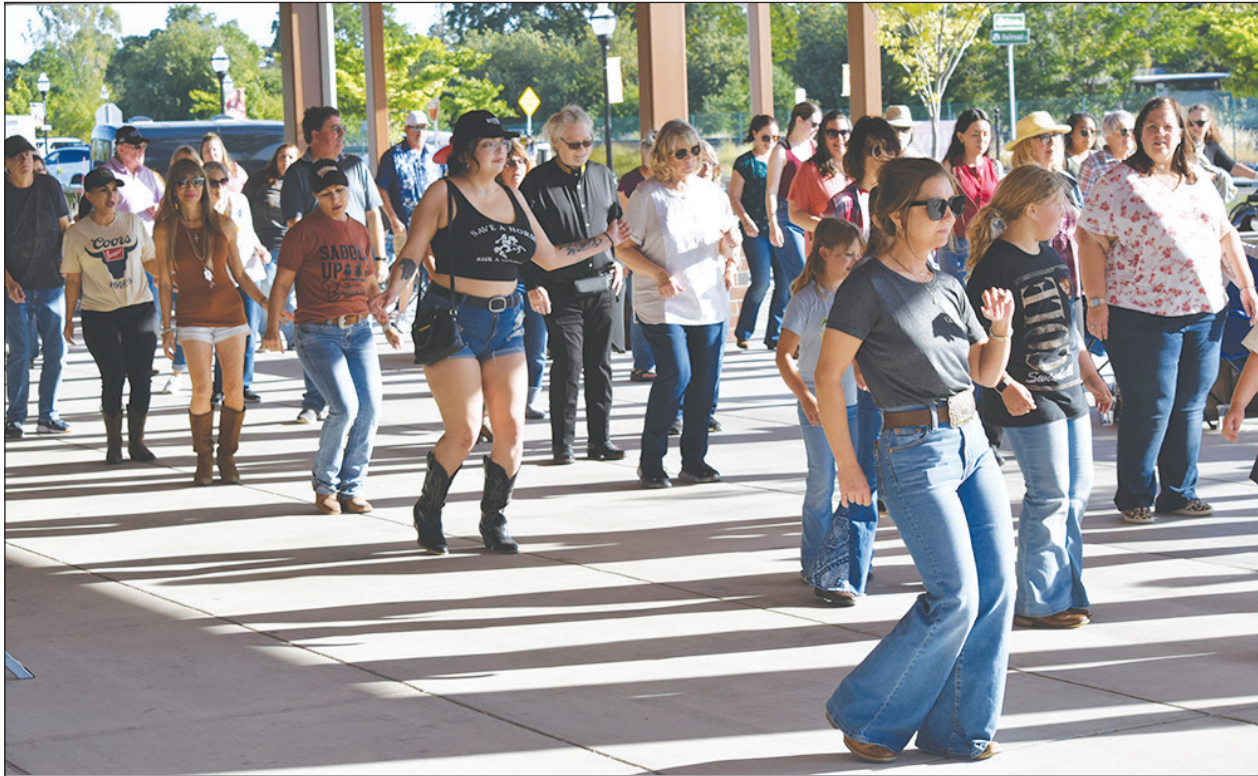
Line-dancers shuffle in the shade during "Country in the Plaza" on May 2 in Old Elk Grove.