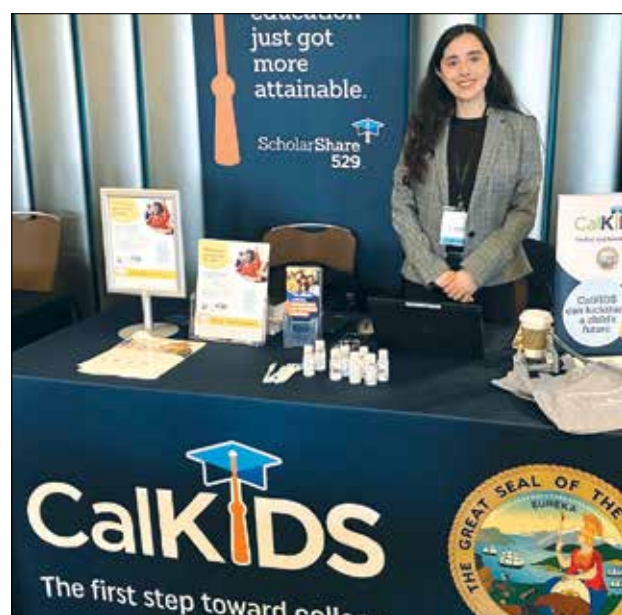
ScholarShare Investment Board staff promote CaLKIDS at community college conference.

Sacramento County has made efforts to ensure students and families are aware of and claim their CaLKIDS accounts. The ScholarShare Investment Board has worked diligently to establish strong partnerships with local high schools, school districts, community-based organizations and financial aid directors at community colleges and universities. Partners like Sacramento California Student Opportunity and Access