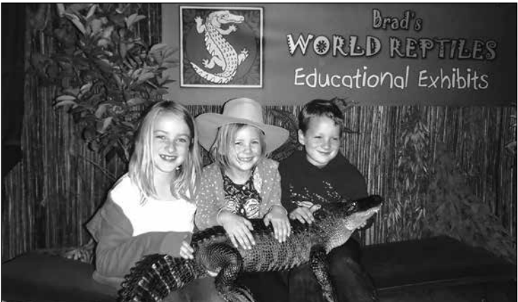
Get ready to be amazed by Brad’s World Reptiles, where kids can get hands-on with snakes, lizards and other incredible reptiles.

The Farm Garden in A Wheelbarrow program is a fantastic way for children in kindergarten through sixth-grade to discover the magic of agriculture. This interactive learning experience teaches kids how food grows, from farm to table, in a fun, hands-on setting. Open to schools, after-school programs, homeschool groups and