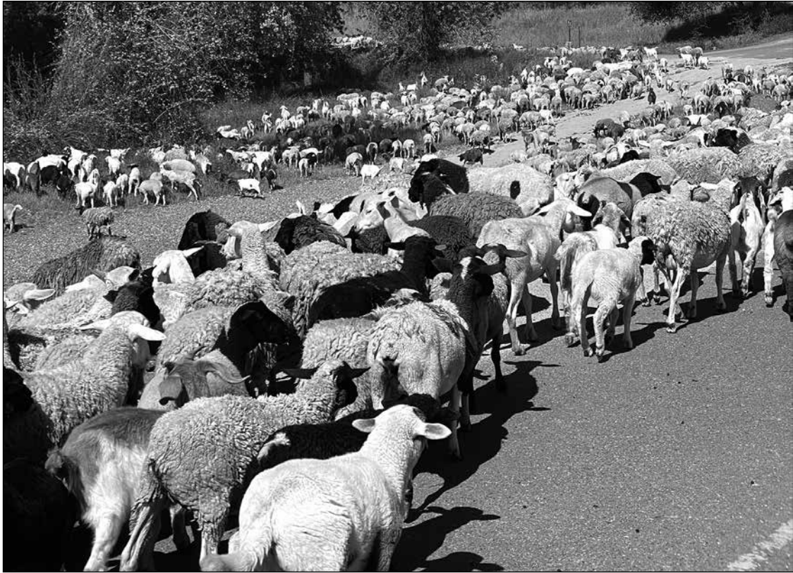
Goats and sheep are ideal for vegetation management to help reduce herbaceous fuels over larger areas and in areas with difficult terrain that are difficult to maintain with manned crews.