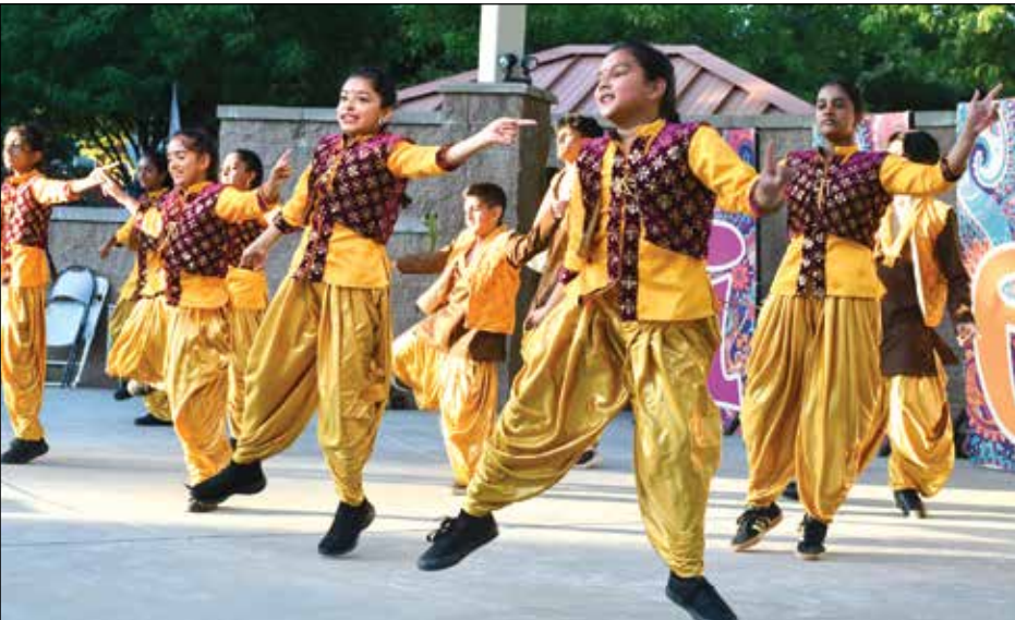
Riar Academy's Bollywood dancers fused traditional Indian dances with elements of Jazz and Hip Hop for an energetic performance.