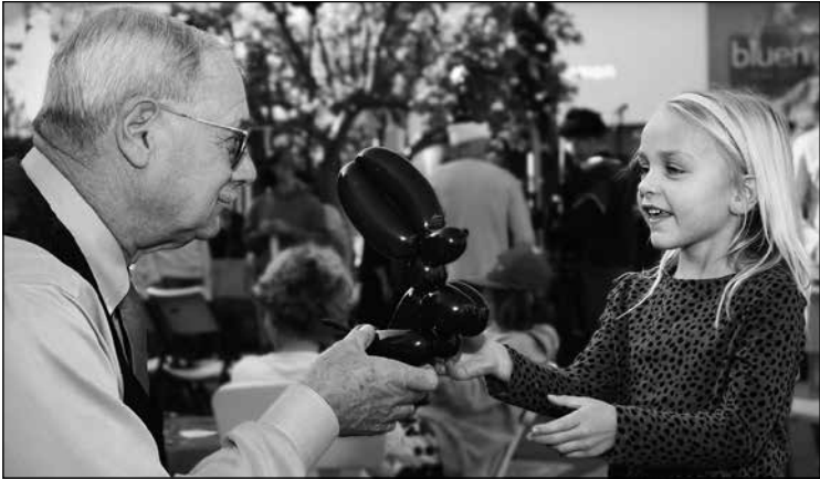
A young girl beams with excitement as a balloon artist hands her a balloon animal during the Sacramento County Fair.

The Stars and Stripes Rodeo will take place Saturday, May 24. Join us at the arena for a night