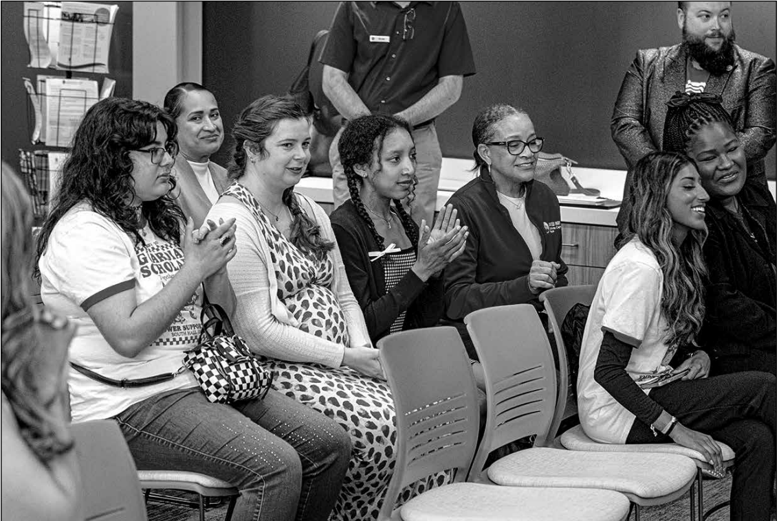
With the success of the pilot at Sacramento State, United Way is expanding its Collegiate Guaranteed Income program to UC Davis.

transition, graduation and post-graduation planning. The program strives to maximize educational opportunities and