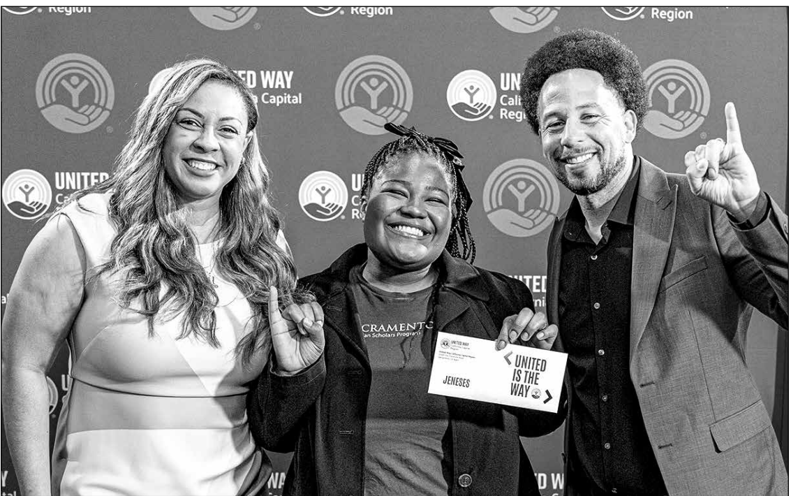
With the success of the pilot at Sacramento State, United Way is expanding its Collegiate Guaranteed Income program to UC Davis.

The UC Davis Guardian Scholars Program is committed to improving educational outcomes for students with lived experiences in foster care, child welfare or out-of-home placement by providing services and support to meet their needs through