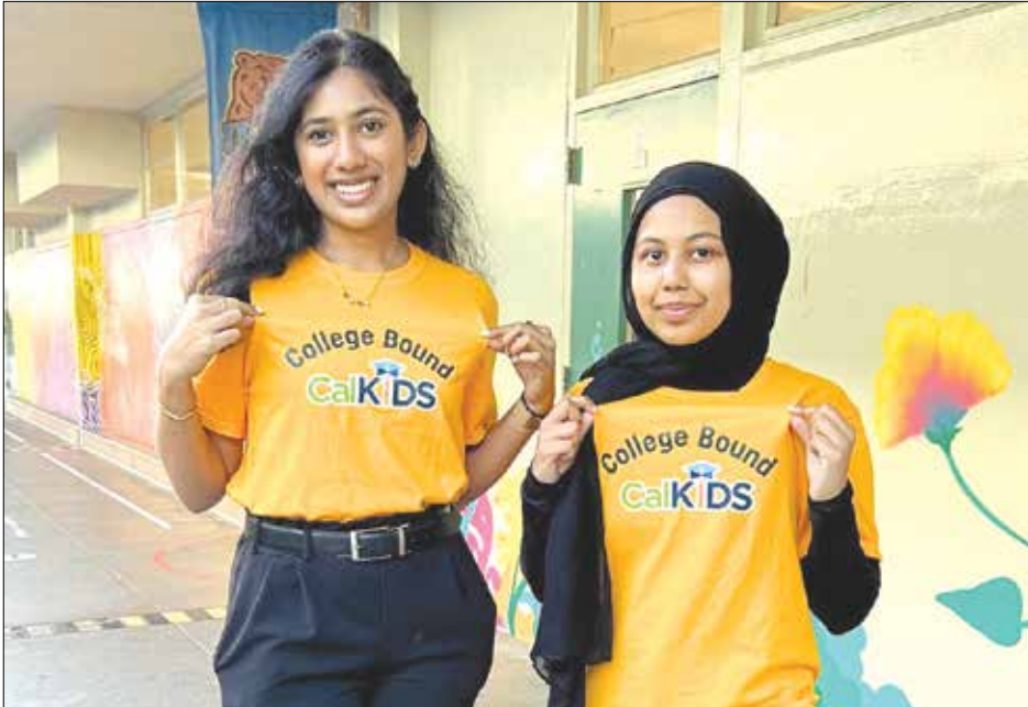
Two students proudly wearing their CalKIDS shirts at the CalKIDS One Year Anniversary event.

CalKIDS is the nation's largest child development account program, providing scholarships for higher education. This statewide initiative, administered by the ScholarShare Investment Board, provides eligible California public school students with CalKIDS Scholarships worth up to $1,500, helping them take the next step toward college or career training by easing financial barriers to higher