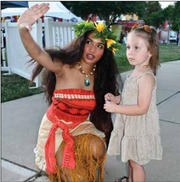
Disney princess "Moana" demonstrated the Polynesian hand gestures to a young iFest visitor.

Hosted by the Cordova Community Council, this free, family-friendly event welcomed hundreds to experience the heart and soul of Rancho Cordova's cultural diversity all in one evening. From 5 to 9