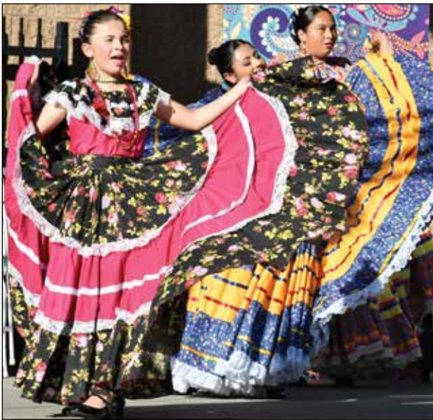
Dancers with the Mexican Tonantzin Group provided a colorful performance of native dances.