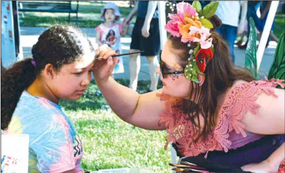
What's a festival without face painting? Pixie Tribe was on hand to do the honors.