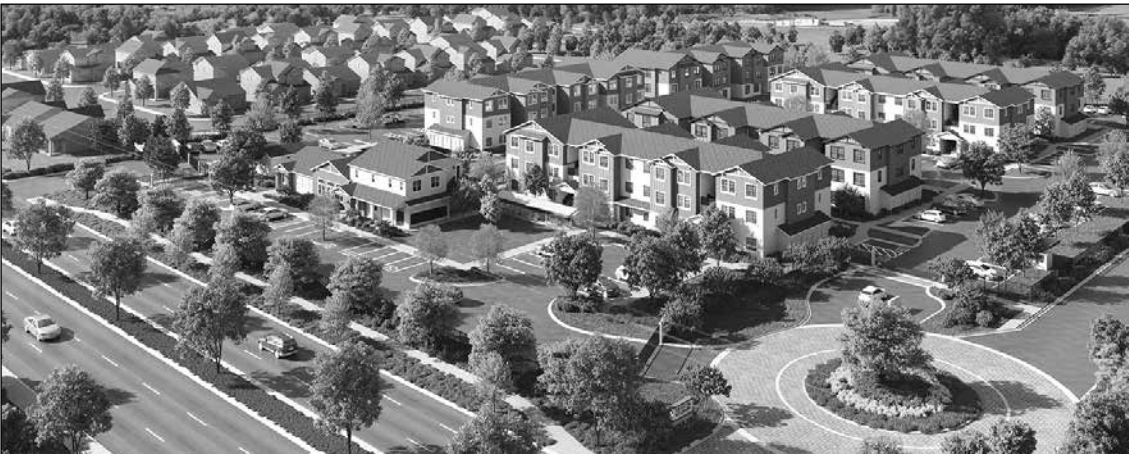
Terracina at Wildhawk, located at 9750 Gerber Road, just east of Bradshaw Road, will become the latest and one of the few affordable apartment communities in the Vineyard neighborhood.

“The Vineyard area is booming because of the incredible demand and the fast-rising cost for housing in the Sacramento region,” said Geoff Brown, President of