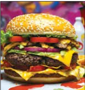
Top local chefs will battle it out at Discovery Park from noon to 4 p.m. May 17 to be crowned the burger champion.

SACRAMENTO REGION, CA (MPG) - The American River Parkway Foundation invites Sacramento-area community members to Discovery Park for the American River Burger Battle.