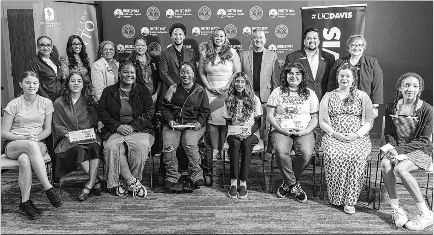
Twenty former foster youth studying at Sacramento State and University of California, Davis, received their first payments from United Way California Capital Region's Collegiate Guaranteed Income program.

The Collegiate Guaranteed Income program brings together United Way's experience working with foster youth with its expertise in guaranteed income. United Way has been supporting foster youth for more than two decades and launched the first Guaranteed Income program of its kind in the California Capital Region in July 2021, following