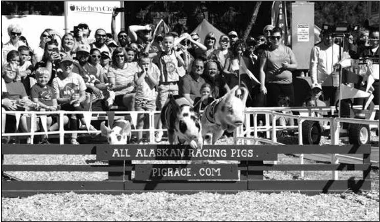
Don’t miss the high-energy All Alaskan Racing Pigs, where these pint-sized athletes dash, leap and compete in a sprint around the track.

Don’t miss the high-energy All Alaskan Racing Pigs, where these pint-sized athletes dash, leap and compete in a sprint around the