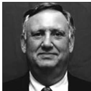
By Dan Walters, CALMatters.org

A reliable political axiom — at least in California — is that when one party achieves dominance in some arena, it fragments into factions defined by ideology, gender, economics, ethnicity, geography or even personality. The axiom has been demonstrated at the local level for decades, such as the perpetual infighting among San Francisco's dominant Democrats, or the ceaseless squabbling among Republicans when they controlled Orange County. Democrats achieved absolute dominance in state politics over the last quarter-century, holding all statewide offices and capturing supermajorities in the Legislature and within the state's congressional delegation. One might think that such hegemony would manifest itself in sweeping responses to California's most pressing issues, such as homelessness, poverty, water supply, wildfires and housing shortages — particularly after Gavin Newsom became governor on promises to seek "big, hairy audacious goals." It was not to be. The issues that were plaguing California when Newsom took office in 2019 are as formidable as ever, reflecting not only their complexity but the tendency of the dominant party to become a collection of often