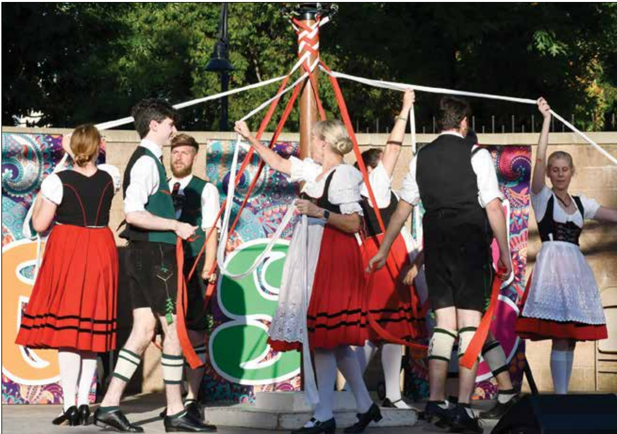
The traditional Maypole dance transported iFest to Bavaria and Austria, courtesy of Sacramento Turn Verein Alpentanzer Schuhplattler.

Rancho Cordova iFest Unites Cultures in Colorful Celebration