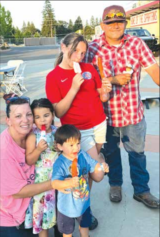
The Sunrise Recreation and Park District will celebrate its 75th anniversary with a special public event from 5 to 9 p.m. Saturday, Oct. 4 at Rusch Park.