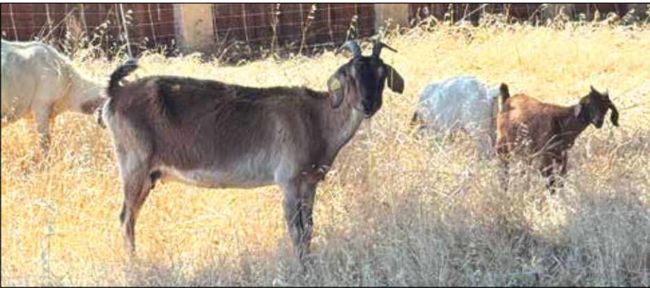
A herd of more than 500 goats will graze in approximately seven open space areas during June, according to Marisa Brown from the Citrus Heights communications office.