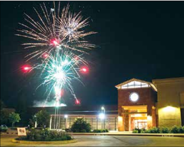
The fireworks show lights up the sky above City Hall at a previous year’s Stars & Stripes Celebration.

who sign up through the city’s volunteer hub will receive additional event details prior to the event and upon check-in, a free event T-shirt and a food voucher at the city booth.