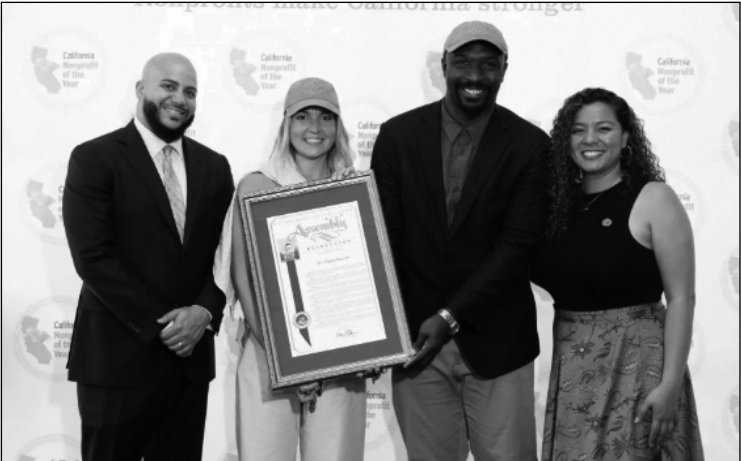
This year marks the 10th anniversary of the California Nonprofit of the Year program, which has now honored a total of 1,009 nonprofit organizations across California.