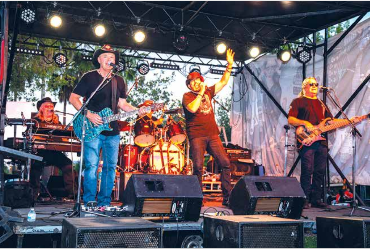
Band CC Seger entertains the crowd at a previous year's Stars & Stripes Celebration.