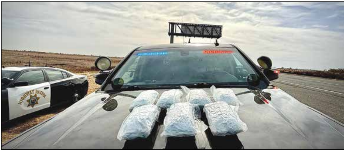
Attorney General Rob Bonta said that more than 15-million fentanyl pills have been seized, more than 6,700 pounds of fentanyl powder confiscated and more than 500 suspects have been arrested.

alert system powered by artificial intelligence; and the dismantling of online distributors.