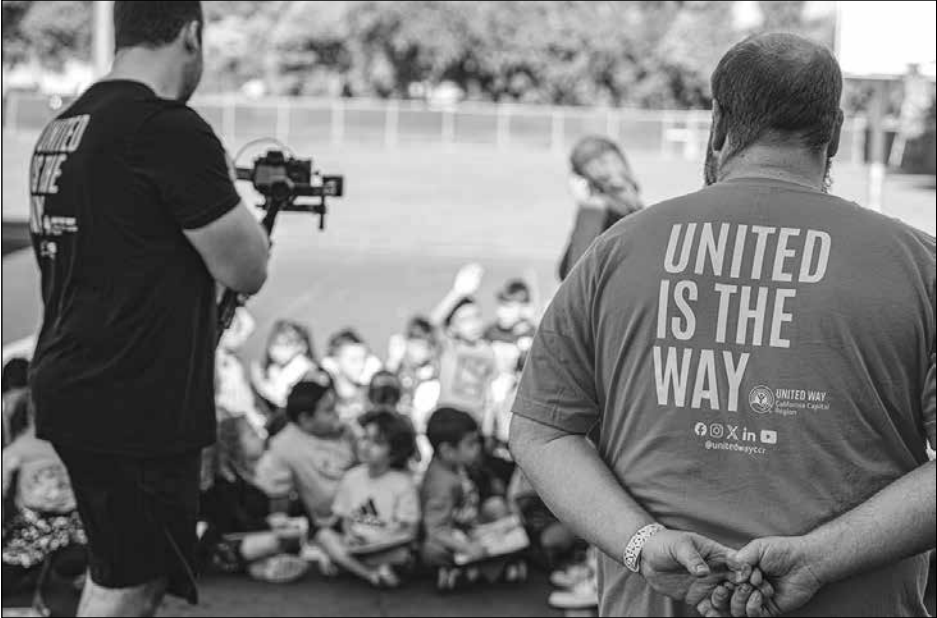
Shown is the crew working on one of the shoots for the winning “Future Forward” commercial.