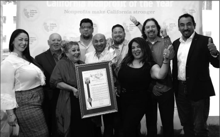
The California Nonprofits of the Year program helps increase awareness about the critical role nonprofits play in our communities.