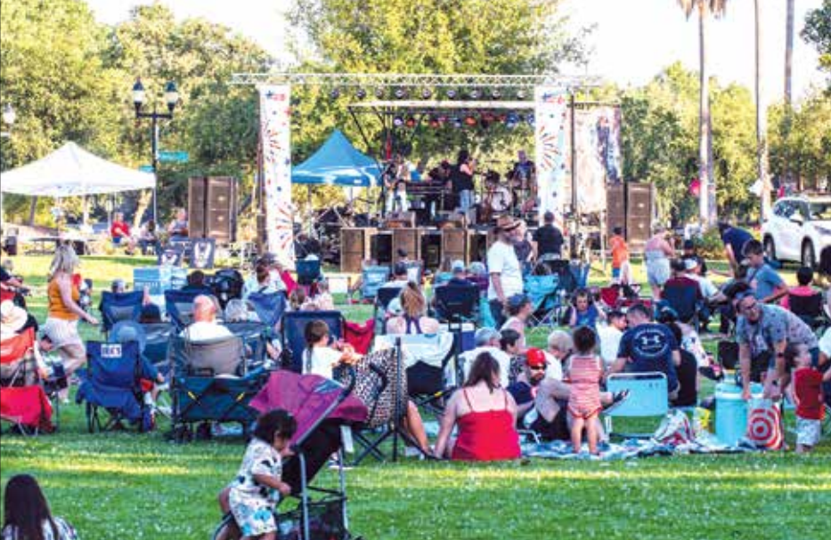
Attendees relax on the lawn at a previous year’s Stars & Stripes Celebration.

Brown said that helpful guidance for residents and families visiting the designated grazing areas is also published there as well. ★