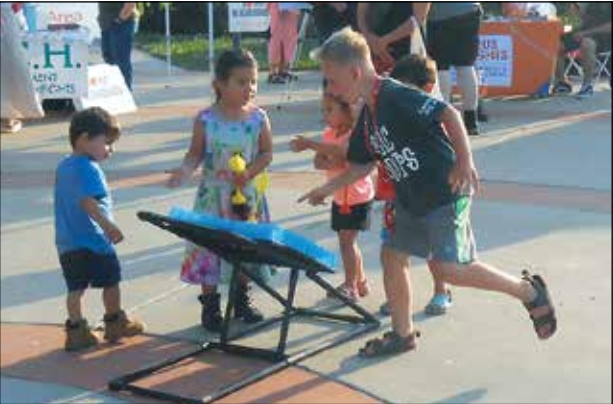
A late afternoon breeze helped reduce the day's high heat as children busily played a super-sized version of the Connect Four tic-tac-toe game and soft lawn darts which were just their size.

Continued from page 1 and organizations servicing their neighborhoods which meet monthly. Staff from the Sunrise Recreation and Parks District also answered questions about sports programs, special events,