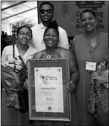
Nonprofit organizations throughout California were each selected by a state senator or assemblymember to be honored for the difference they are making in their communities.