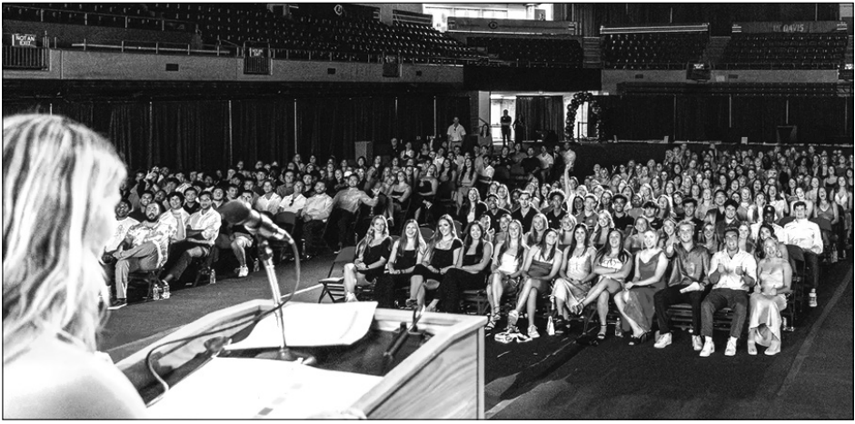
UC Davis Athletics celebrated its student athletes with the annual Aggie Awards.

The Marya Welch Award is an award bestowed to the women's team with the highest GPA, celebrating the outstanding work