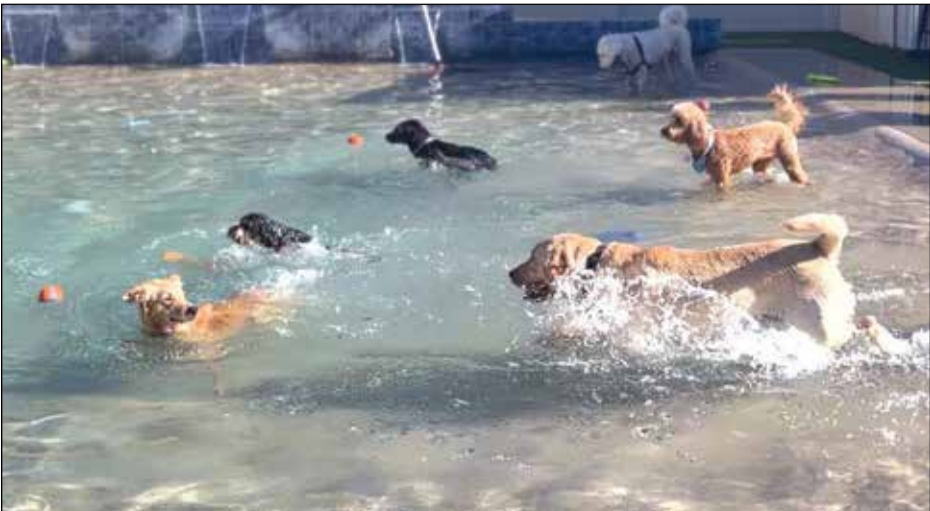
Multiple dogs trot into the shallow water of the Animal Den Pet Resort and Spa’s in-ground pool during a previous Splashy Hour event in partnership with the Sacramento SPCA.

Animal Den Pet Resort and Spa, this event is best suited for dogs who are well socialized and comfortable playing in large groups. Animal Den employees reserve the right to observe all dog interactions and make necessary decisions to keep all dogs and humans safe.