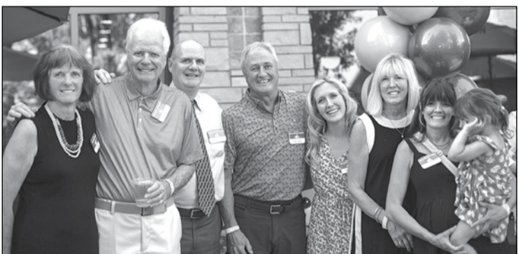
Held in the Mercy Healing Garden, the celebration brought together hospital leaders, multi-generational families and longtime staff.