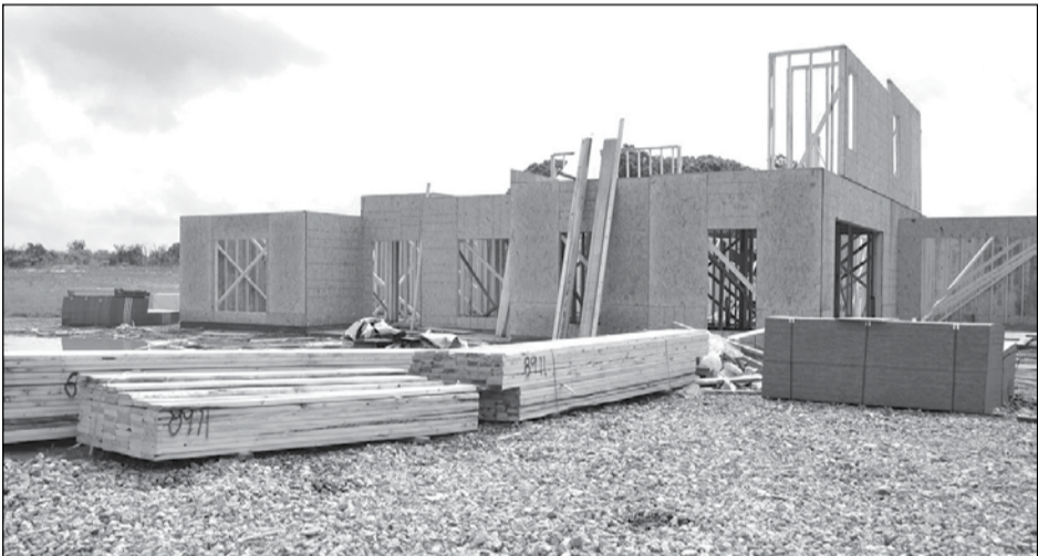
A total of 254 new homes were sold in Sacramento County new home communities during the month.

By North State Building Industry Association News Release