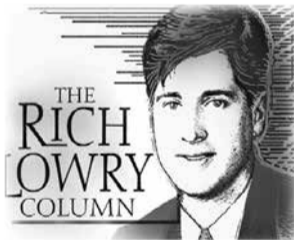
The Future of Warfare is Here