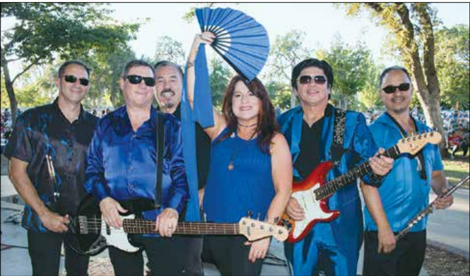
Groove Thang is the Carmichael Concert series’ second-to-last act at 6 p.m. this Saturday.