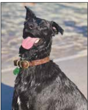
A black dog is soaking wet and sticking its tongue out during a previous Splashy Hour event at the Animal Den Pet Resort and Spa, giving the event an ear up.

Howling Apparel sells printed dog-tie bandanas and stickers, according to its Etsy shop page. The company’s Instagram profile said its production is considered “small batch” and it’s based