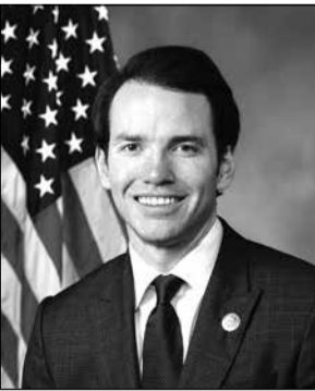
Kevin Kiley Congressman Kevin Kiley News Release

WASHINGTON, D.C. (MPG) - As the anti-Immigration and Customs Enforcement (ICE) riots continue to be violent and dangerous in Los Angeles, Rep. Kevin Kiley (R-CA) is developing legislation that would make Non-Governmental