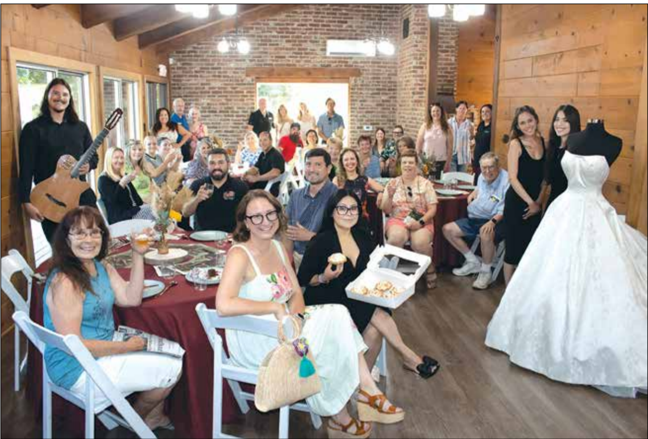
Carmichael Chamber of Commerce members join Carmichael Recreation and Park District staffers at a Garfield House event.