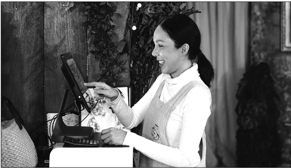
Small business owners expecting better business conditions and sales.