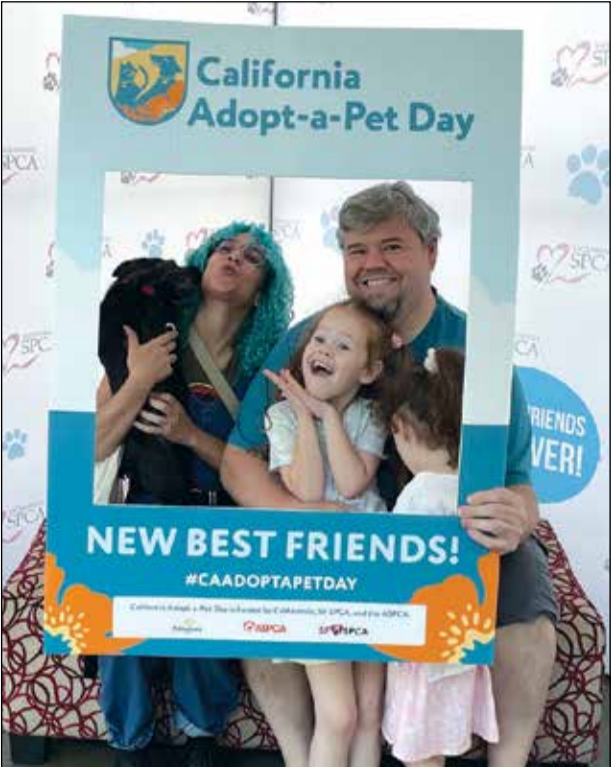
Quincy, 8 months old, is one of 87 animals adopted from the Sacramento Society for the Prevention of Cruelty to Animals during California Adopt-a-Pet Day on June 7.