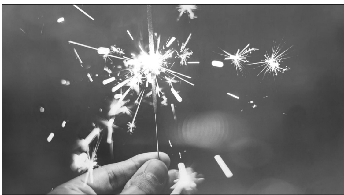
It's always a good idea to know the risks of fireworks, only use legal fireworks and stay safe when using them.

If the illegal fireworks are being set off from your property, you are responsible for the fines. Penalties for violations are $1,000 for the first violation, $2,500 for the second violation within one year of the first violation, $5,000 for each additional violation within