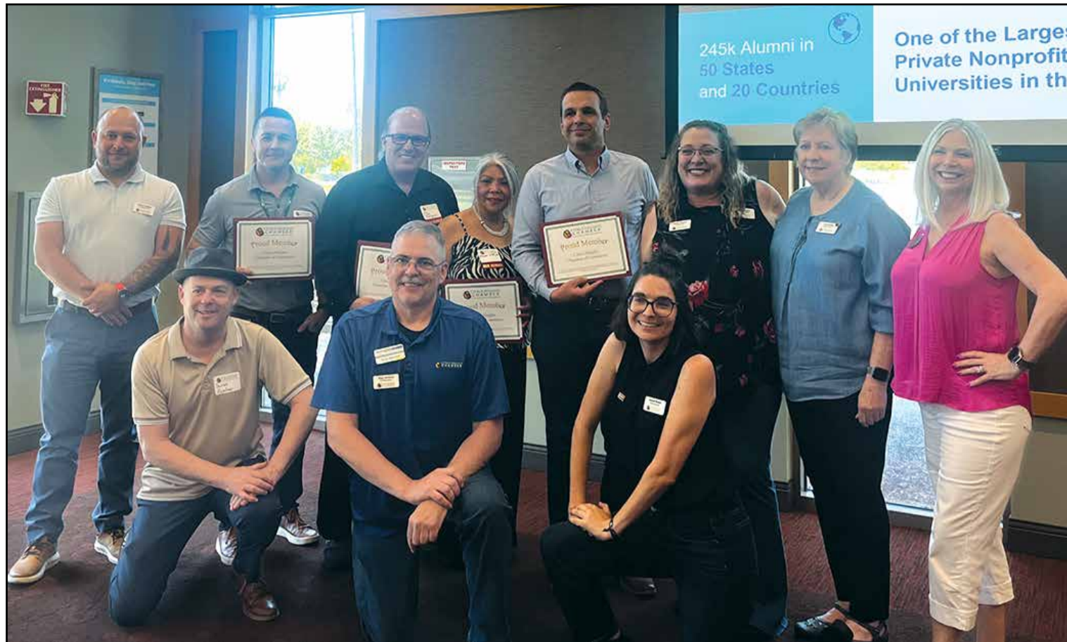
Chamber ambassadors present new chamber members with certificates at the ACCESS Citrus Heights Luncheon on June 17.

Another success story is the Budget Cents program, brought to students as part of a