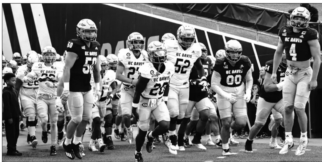
The Aggies finished 2024 No. 5 in the nation after going 11-3 and making a deep run into the NCAA FCS Playoffs, reaching the quarterfinals for only the second time in program history while going 7-1 in Big Sky play.

The Aggies are among five Big Sky teams represented in the poll, and the No. 11 ranking places UC Davis as the third highest team in the conference to earn a ranking. No. 2 Montana State, No. 7 Montana, No. 10 Idaho and No.