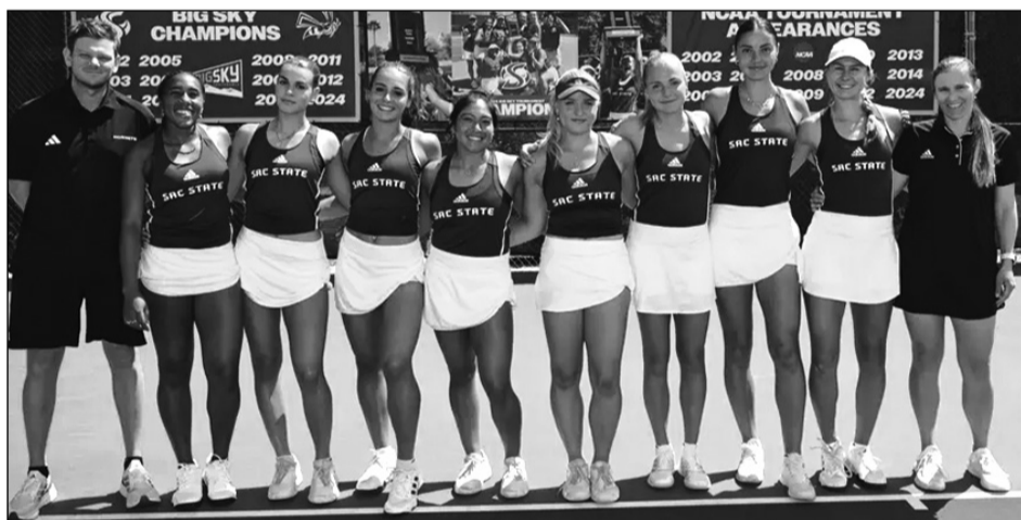
Last season, the Sacramento State University women's tennis team claimed its second straight Big Sky Conference Tournament title and NCAA Tournament berth. The Hornets were included among the region's best teams, ending the spring ranked No. 5 in the Northwest Region, according to the Intercollegiate Tennis Associations final poll.

California State University, Sacramento Athletics News Release