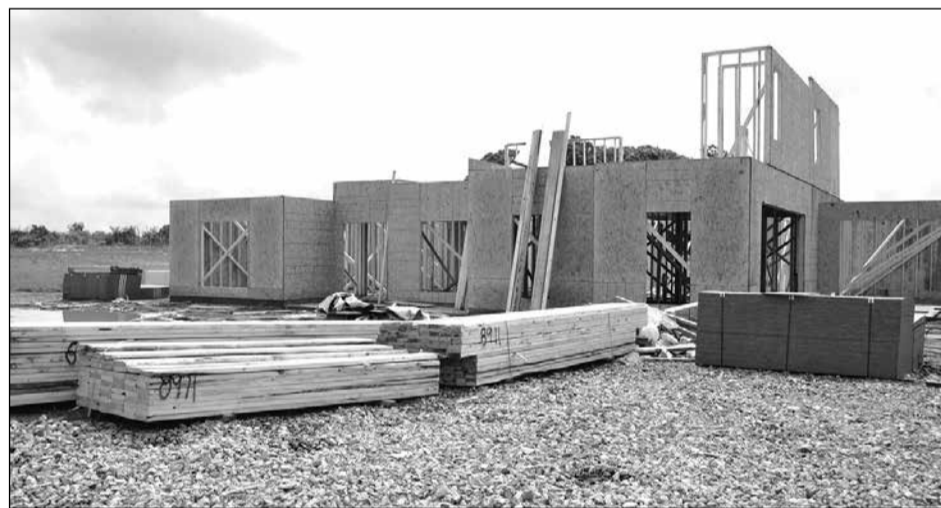
A total of 254 new homes were sold in Sacramento County new home communities during the month.