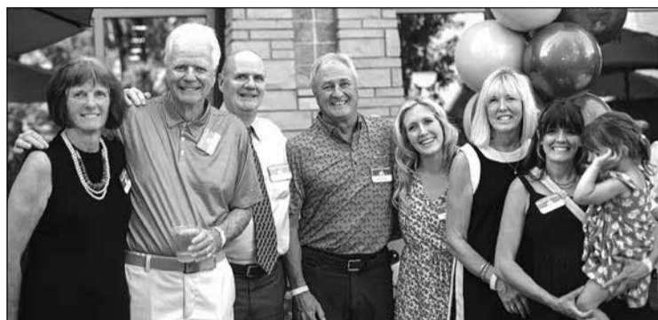
Held in the Mercy Healing Garden, the celebration brought together hospital leaders, multi-generational families and longtime staff.