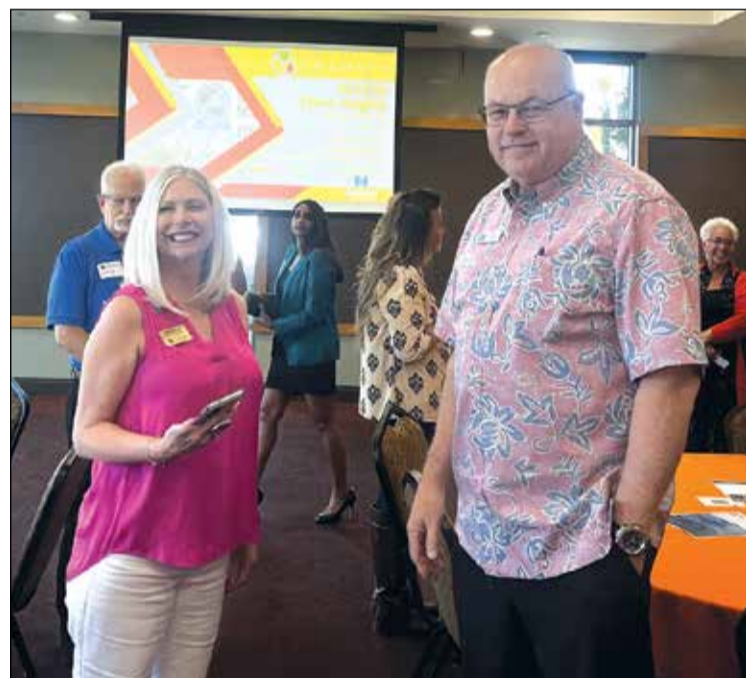
Attendees at the ACCESS Citrus Heights Luncheon can connect with fellow business owners, entrepreneurs and community leaders.

Voting for nominees will start on July 1 and end on July 31, with the results being announced at the Aug. 21 event. ★