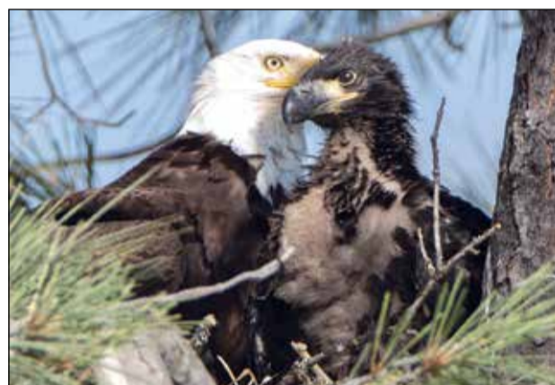
Words of wisdom. Mama and younger baby Dragon go beak-to-beak.

and toward independence. Love deals harsh lessons. The strong survive.