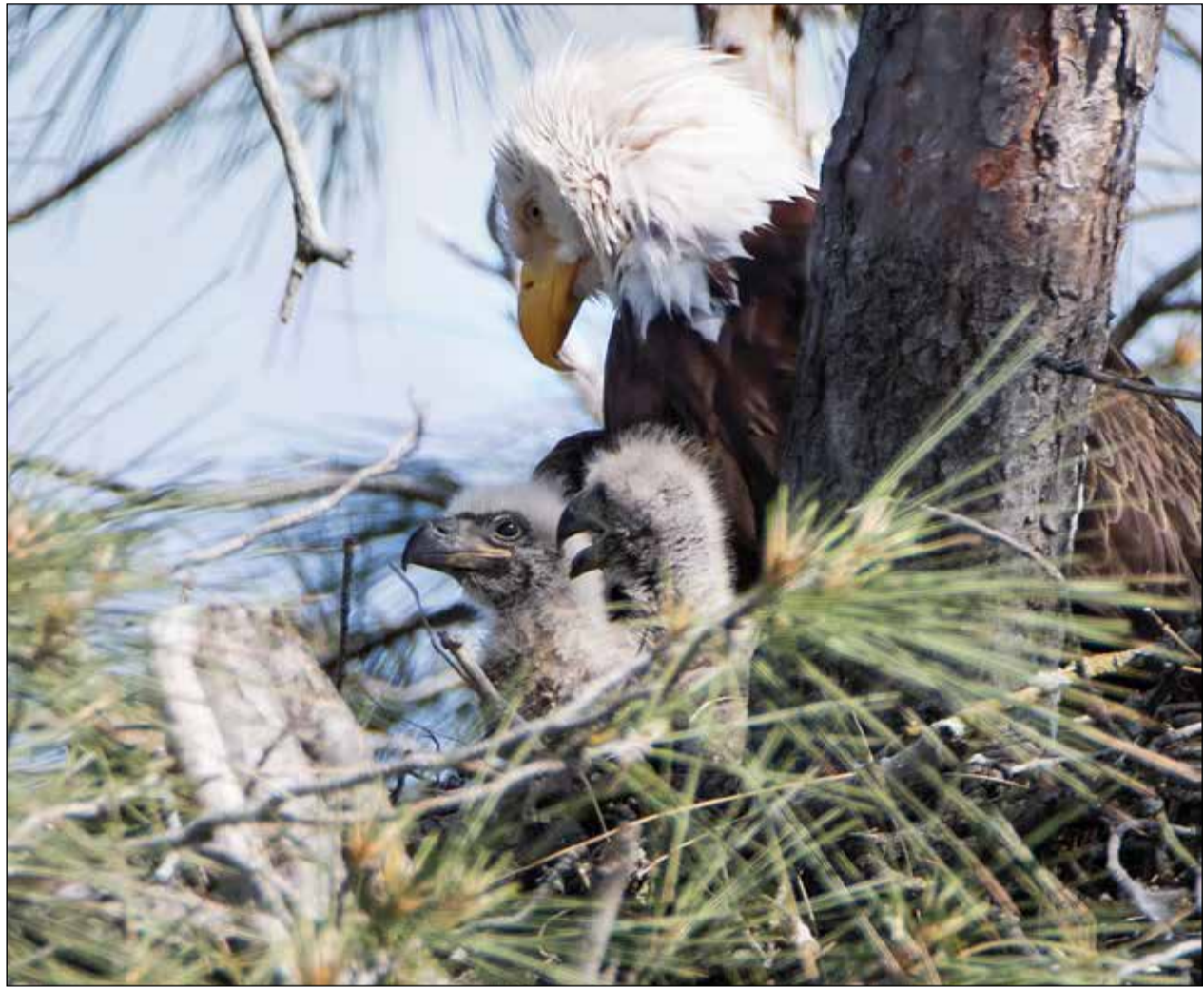
Papa shields Freedom and Dragon from afternoon sun. The eagle parents share all duties of parenthood.

PRSRTD STD. U.S. POSTAGE PAID CARMICHAEL, CA PERMIT NO. 350 OR CURRENT POSTAL CUSTOMER