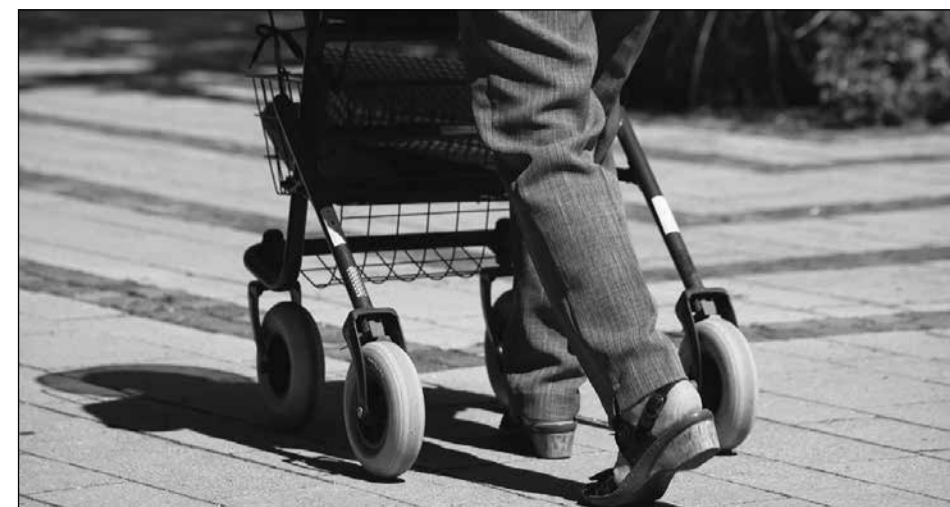
The FBI investigates financial scams targeting seniors, including investment scams, technical/customer support schemes, money mules and romance scams.