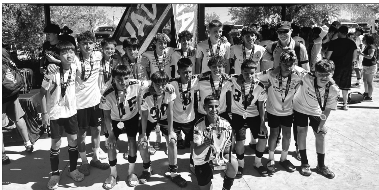
In Las Vegas on June 16, the Sacramento Republic FC Academy's U13 team wins the international Copa Rayados tournament without conceding a goal.