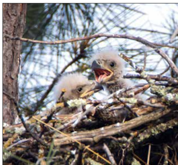
Clad in baby down at three weeks old, the hatchlings grow to adult-size by their 10th week and fly at 12 weeks.

In a provisioned utopia, Freedom and Dragon can't yet know their parents will soon urge them from the family pantry