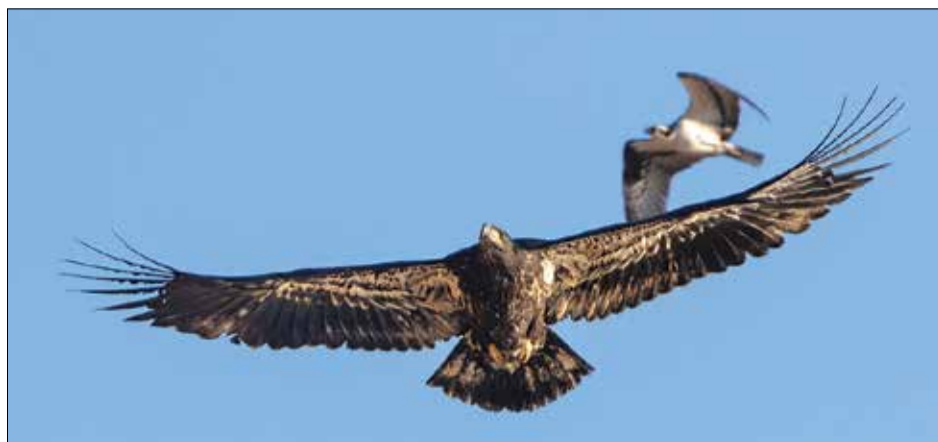
Raptor rumble. A territorial osprey flies to the attack during one of Freedom's first river crossings.