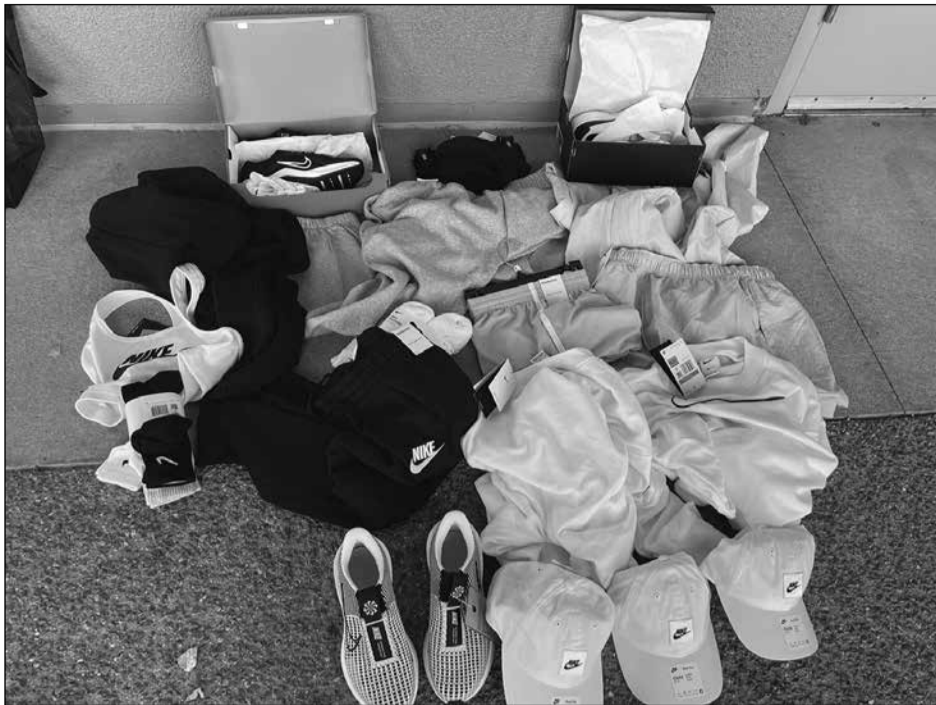
Governor Newsom announced that the state recovered 113,245 stolen items worth nearly $6.5 million this year.