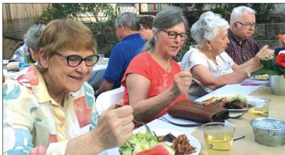
Local volunteers will be serving up a mouthwatering spread of slow-cooked favorites, all made from secret family recipes passed down through the years.