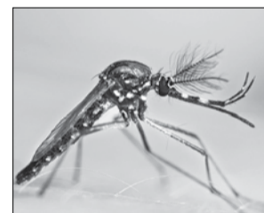
An Aedes aegypti adult male mosquito rests on human skin.

Beginning July 8, Sacramento-Yolo Mosquito and Vector Control District staff will conduct weekly releases of non-biting male mosquitoes that carry Wolbachia, a naturally occurring bacteria. When these sterile males mate with wild female mosquitoes, the resulting eggs do not hatch. Over time, this reduces the local mosquito population.