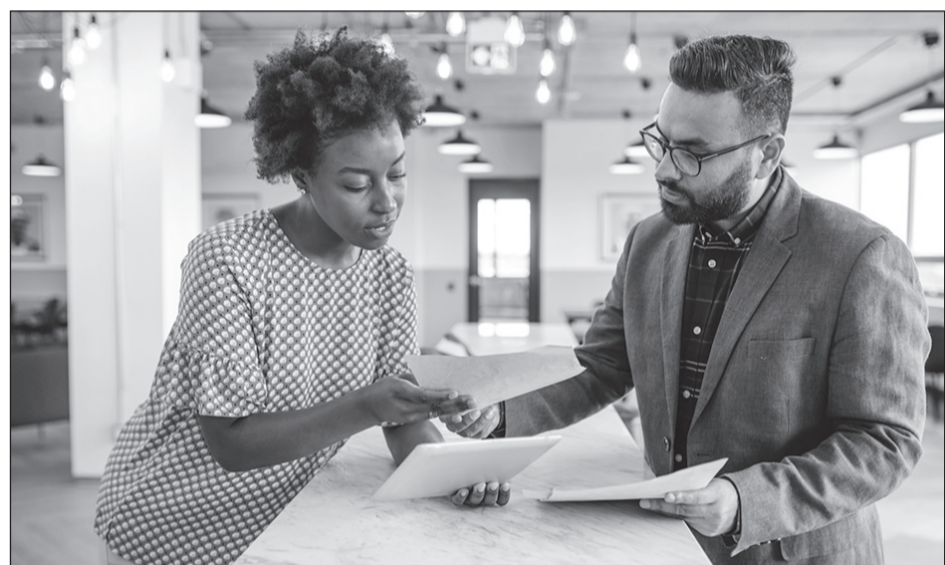
The Business Solutions Center consolidates multiple small business services into a single, streamlined program.