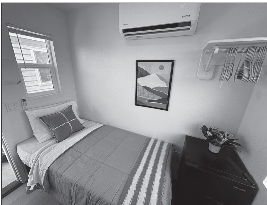
Sacramento County and its partners collaborated in 324 days to complete the county's fastest housing project with Grow Florin Interim Housing, seeing a total capital investment of $5.4 million.

Making up the 72 beds are 32 singles, 20 doubles and eight ADA-compliant cabins. The project was funded by the Behavioral Health Bridge Housing grant, awarded to Sacramento County in partnership with HOPE Cooperative to serve individuals with severe mental