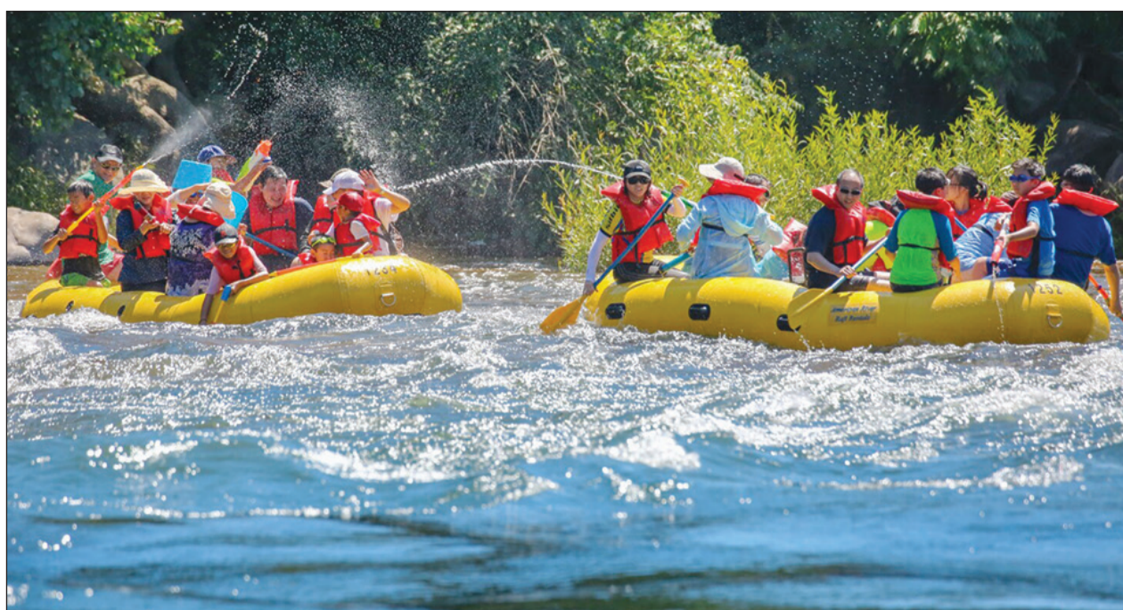
Rafting on the American River is a classic summer tradition. American River Raft Rentals at 11257 S. Bridge St. has offered self-guided floats since the 1970s.