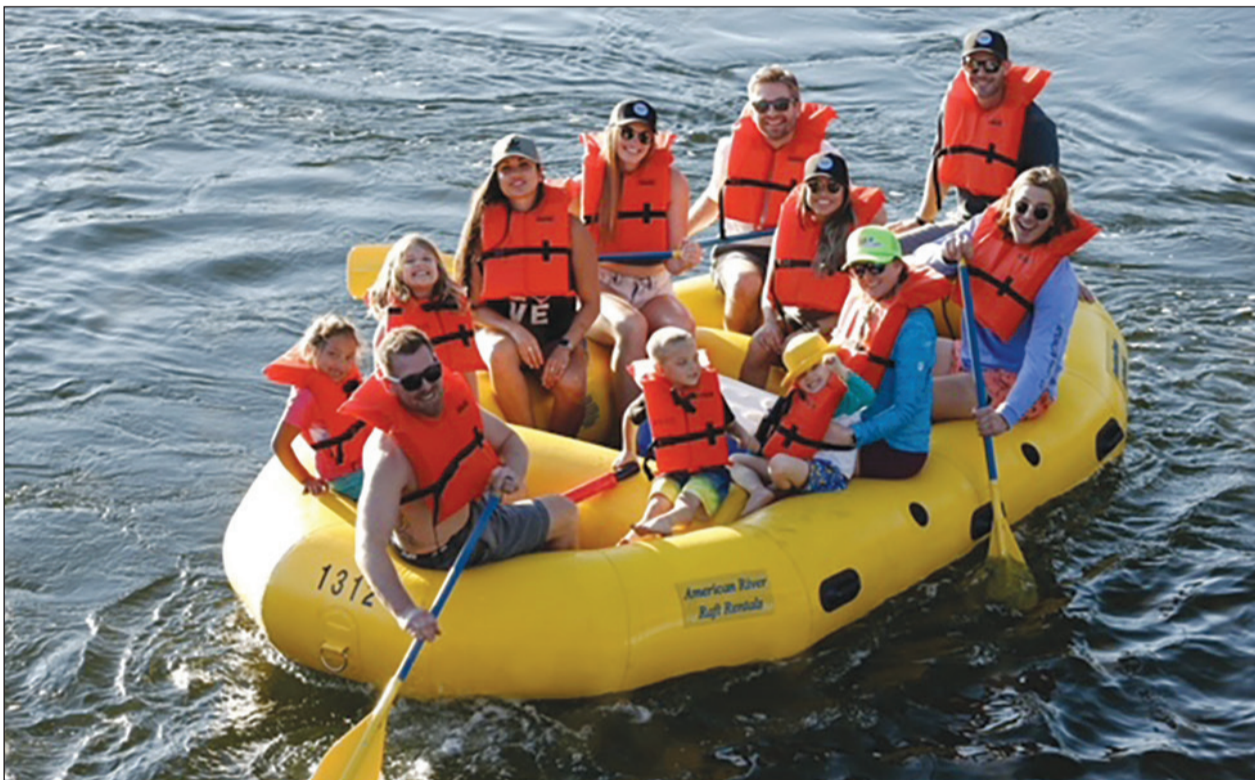
American River Raft Rentals has two launch sites: The Sunrise location 11257 S Bridge St. is open daily through Oct. 31. Sailor Bar, a newer two-mile float option 4253 Illinois Ave., is open weekends through Labor Day. Rafts range from four-person ($99) to 12-person ($280).