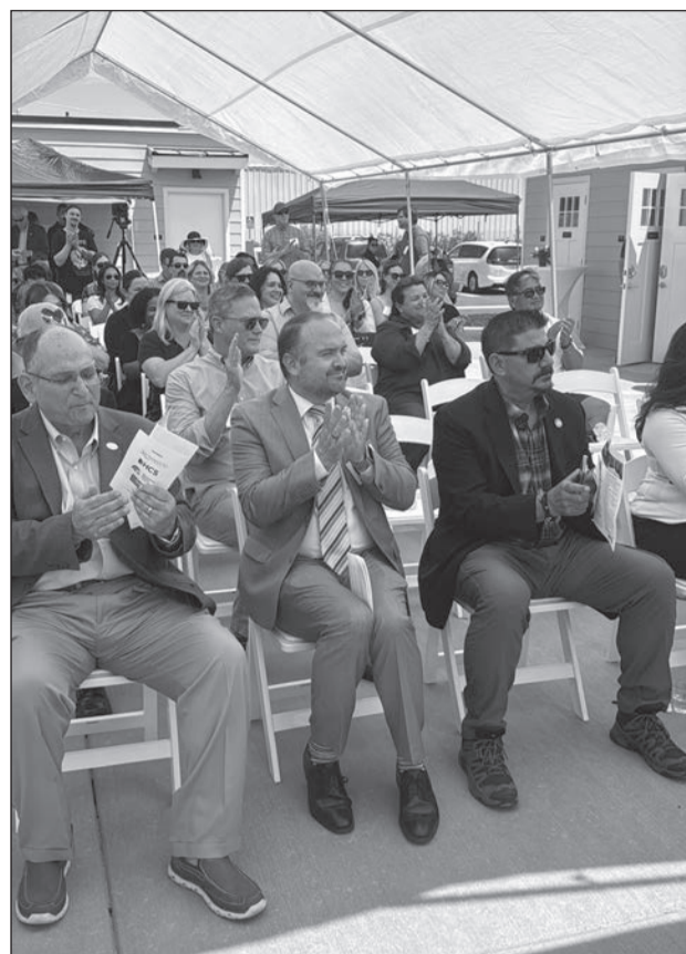
Nearly 100 attendees huddled under a shaded tent to celebrate Sacramento County's Department of Health Services newest resource for seniors with behavioral health and housing needs.

a mini fridge, a communal kitchen and a dog park are some amenities included for residents. Tenants