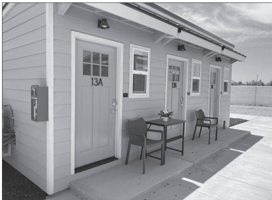
The project's 72 beds include 32 singles, 20 doubles and eight ADA-compliant cabins.