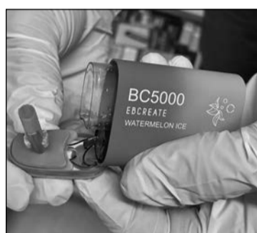
Shown is the inside of a vape pod, a type of e-cigarette, at University of California, Davis.

The scientists analyzed the metal and metalloids inside seven types of disposable devices from three of the most popular brands. Using an instrument to activate disposable