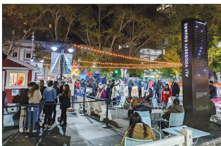
The Ali Youssefi Square Entertainment Zone includes the square and adjacent area including K Street between 7th and 8th streets.

"The goal is to enhance the experience for those attending special events in Sacramento and increase revenue for businesses," said Tina Lee-Vogt, the