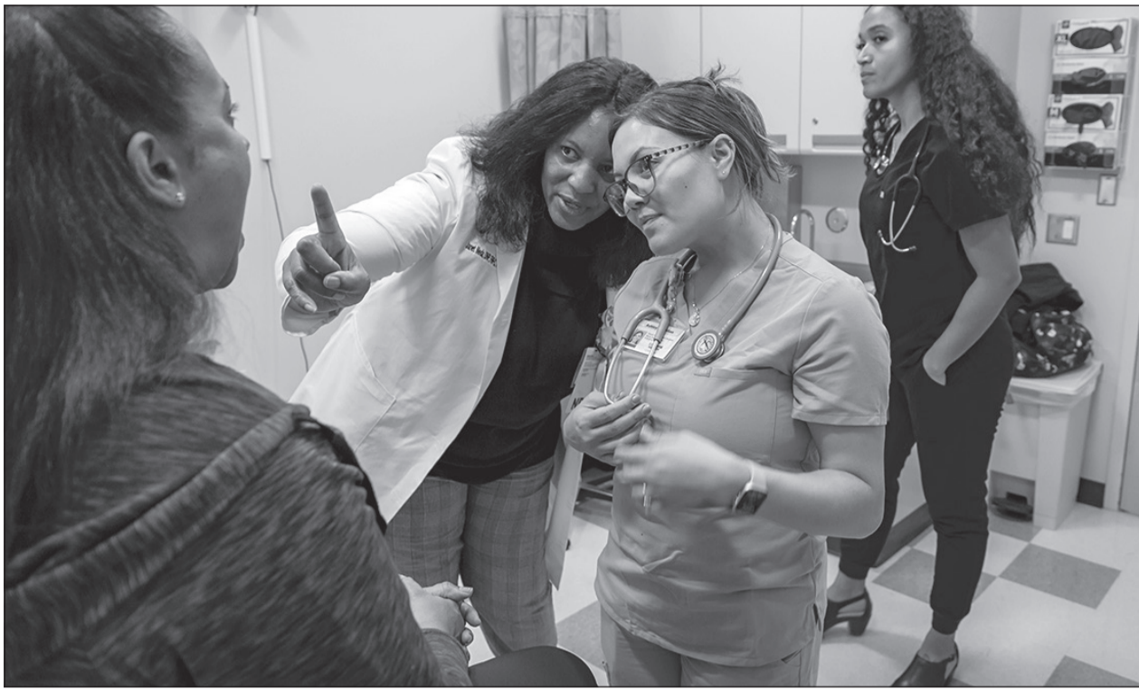
Primary care is delivered by family nurse practitioners for all areas of California.

"This accreditation reflects what we value most, an environment where faculty and staff are deeply