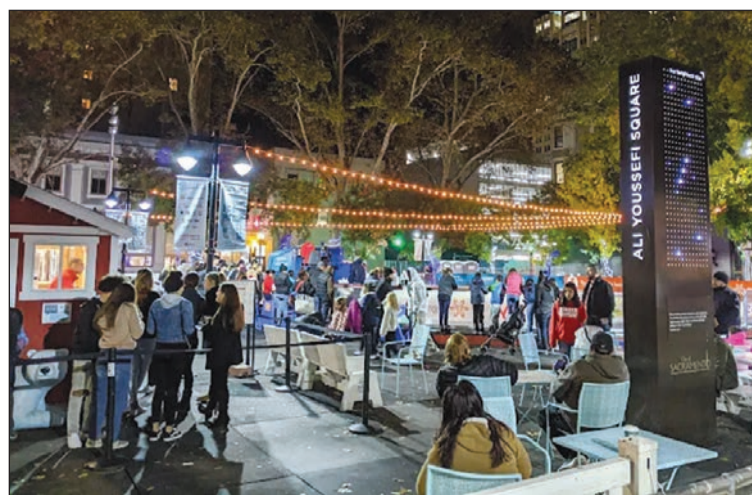
The Ali Youssefi Square Entertainment Zone includes the square and adjacent area including K Street between 7th and 8th streets.

"The goal is to enhance the experience for those attending special events in Sacramento and increase revenue for businesses," said Tina Lee-Vogt, the