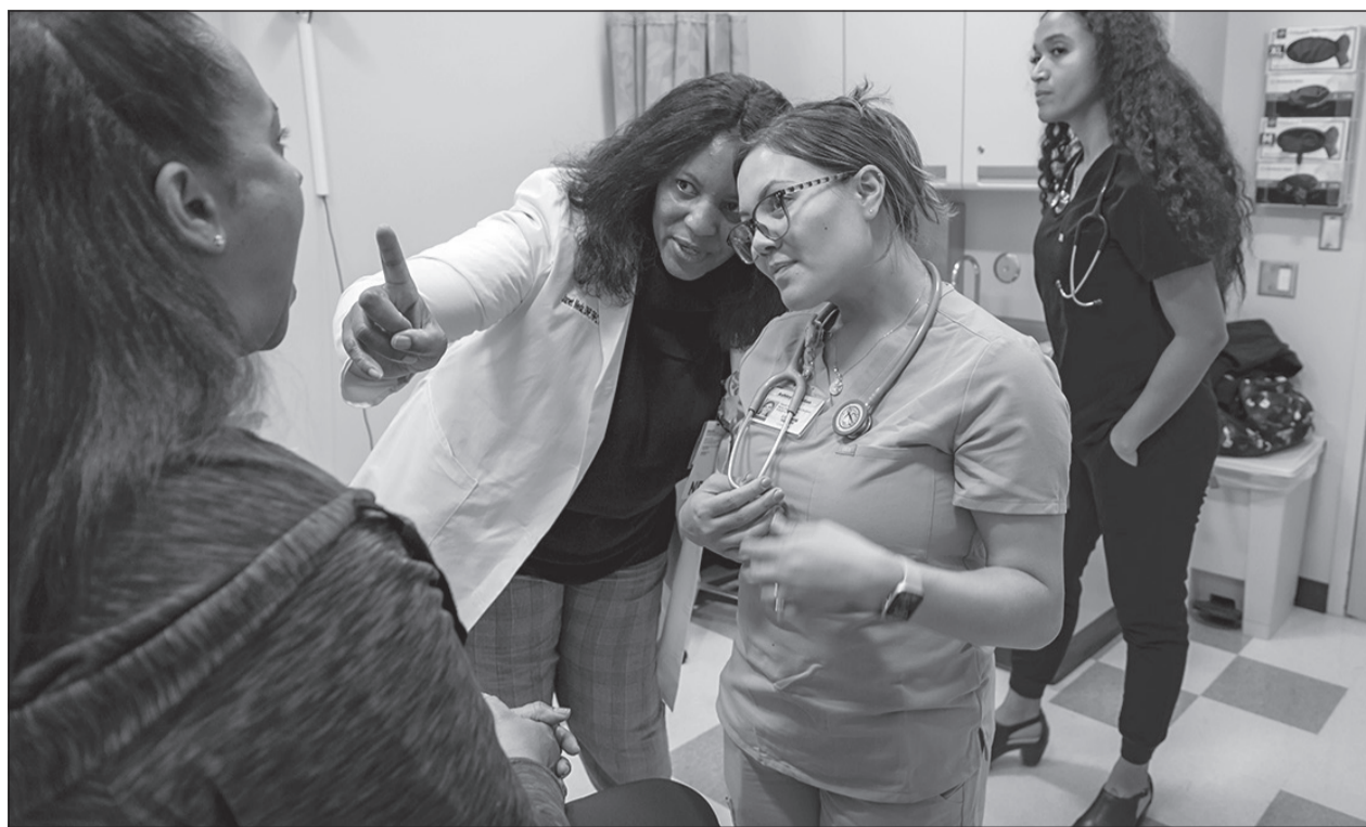
Primary care is delivered by family nurse practitioners for all areas of California.

"This accreditation reflects what we value most, an environment where faculty and staff are deeply