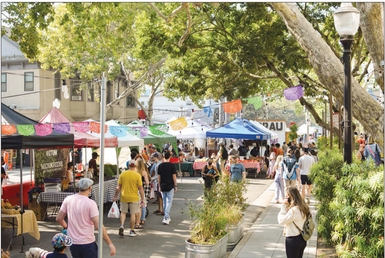
Along with nearly 300 vendors offering a wide range of products each Saturday, the Midtown Farmers Market offers entertaining activations and entertaining music.