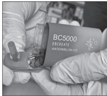
Shown is the inside of a vape pod, a type of e-cigarette, at University of California, Davis.

The scientists analyzed the metal and metalloids inside seven types of disposable devices from three of the most popular brands. Using an instrument to activate disposable