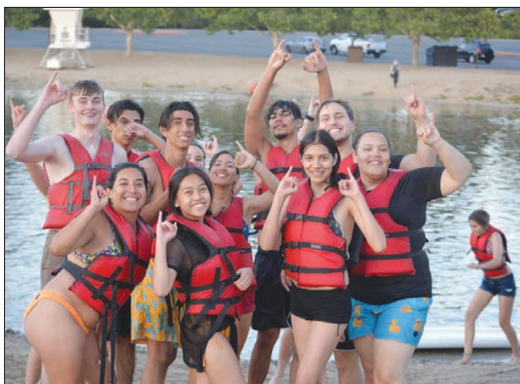
California State University, Sacramento alumni and affiliates receive discounts at the Sacramento State Aquatic Center. For currently-enrolled students, cost for rentals is almost half price upon showing photo identification.

Tide information and navigation tips are available at cosumnes.org/paddle-the-river . Guided paddle tours are available and led by experienced instructors. Paddlers must