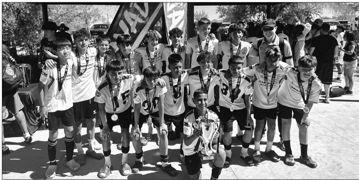
In Las Vegas on June 16, the Sacramento Republic FC Academy's U13 team wins the international Copa Rayados tournament without conceding a goal.