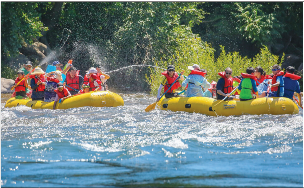
Rafting on the American River is a classic summer tradition. American River Raft Rentals at 11257 S. Bridge St. has offered self-guided floats since the 1970s.

Use Kayaks, Rafts to Get on the Water this Summer