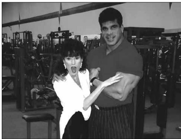
Lou Ferrigno, actor and former bodybuilder, was in the movie and TV show, "The Hulk."