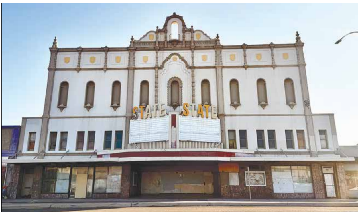
The legal battle surrounding Marysville's long-shuttered State Theater continues to unfold.

Ownership Dispute and Unpaid Fines Head to Court