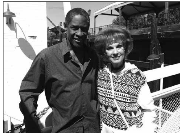
Tim Russ was Tuvok on the TV series, "Voyager in the Star Trek" follow up.