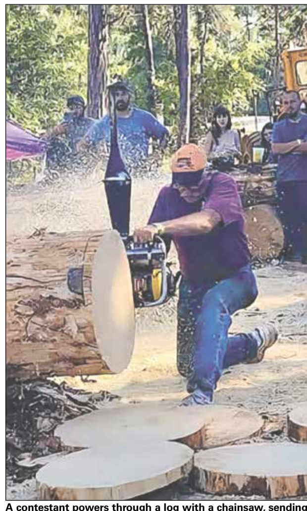
A contestant powers through a log with a chainsaw, sending sawdust flying during the 2024 Mountain Fair's traditional logging games in Brownsville.