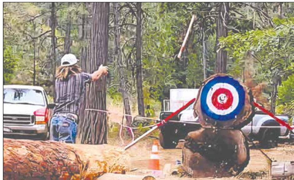
A competitor hurls an axe toward a painted bullseye during one of the logging arena challenges at the 2024 Mountain Fair in Brownsville.

For locals and visitors alike, Mountain Fair 2025 offers a vibrant celebration of mountain culture, community spirit and summer fun. ★