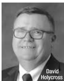
David Holycross Affordable & Dignified On Site Crematory Se Habla Español estab. 1998

486 Bridge Street • Yuba City • 530-751-7000 holycrossmemorial.com • FD1653