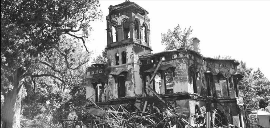
Shown is the Bidwell Mansion today. The beloved mansion was severely damaged in an arson fire on Dec. 11, 2024.