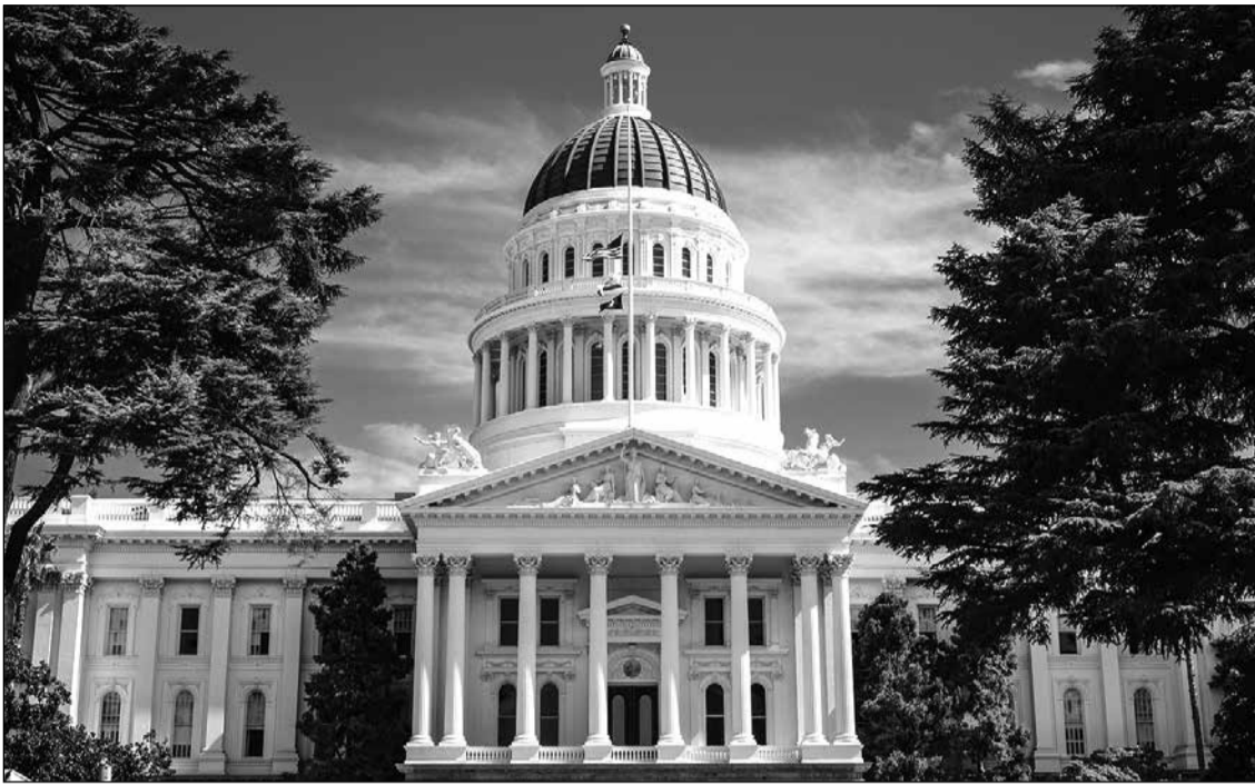
The vast majority of Californians believe that that kind of spending has far too much influence in the state.

The question of special interest money having too much influence in the state capitol also showed significant racial fluctuations, although like the party