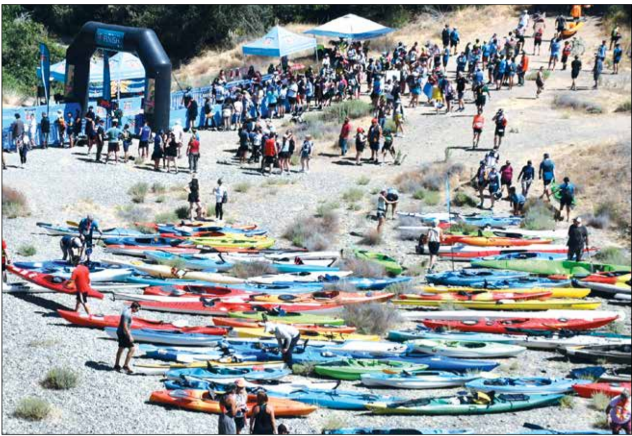
The Great American Triathlon took place on July 19 along the American River Parkway.

Fifth Annual Great American Triathlon Takes Place