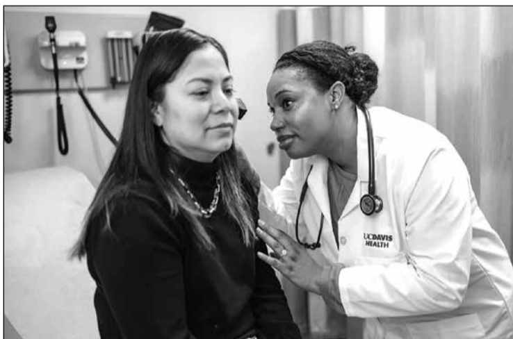
UC Davis Medical Center ranked among the top 50 hospitals nationwide in six specialties* Ear, Nose & Throat (#27), Geriatrics (#27), Neurology & Neurosurgery (#27), Pulmonology & Lung Surgery (#27), Cardiology, Heart & Vascular Surgery (#46) and Diabetes & Endocrinology (#48).

UC Davis Medical Center was rated as "high performing," the highest rating possible, for its quality of care in 16 common adult procedures and conditions: acute kidney failure; aortic valve surgery; back surgery (spinal fusion); chronic obstructive pulmonary disease (COPD); colon cancer surgery; diabetes;