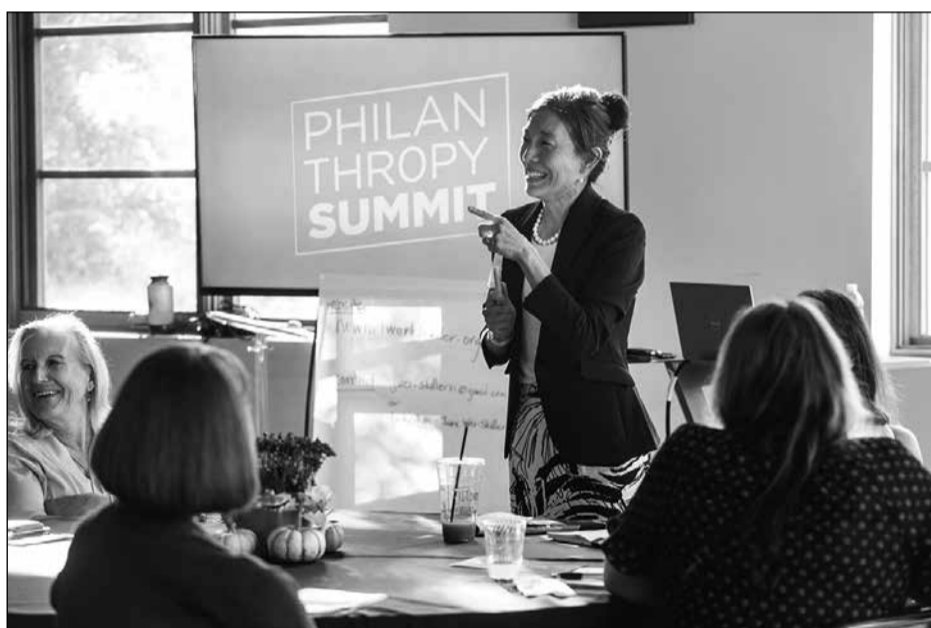
The second annual Philanthropy Summit set for Sept. 15 is expected to sell out. This year's theme is "Mission: Possible, showing how local philanthropy continues to drive positive change even in uncertain times."

The Philanthropy Summit will conclude with the Sacramento Region Community