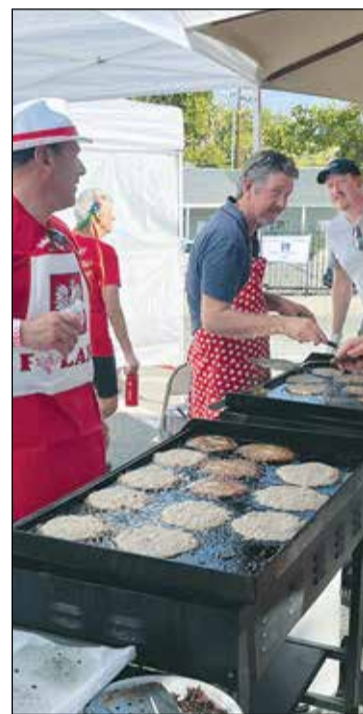
Potato pancakes are another popular offering at the annual festival honoring the Polish culture. ★

Don't forget to visit the Polish marketplace.