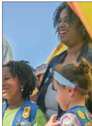
Backed by trusted adult volunteers, mentors and millions of alums, Girl Scouts Heart of Central California leads the way as they find their voices and make changes that affect the issues most important to them.