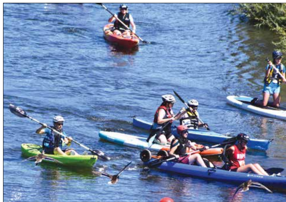
Competitors tested their strength and stamina through a 5.8-mile run, 12.5-mile bike ride and a 6.1-mile paddle.