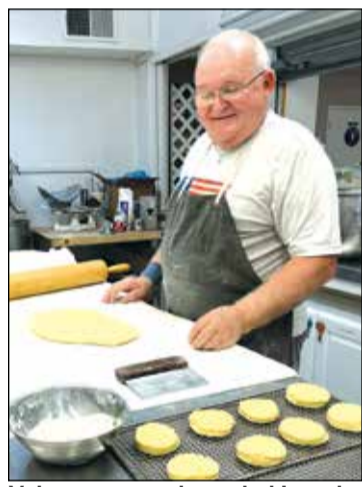
Volunteers work on baking the paczki (Polish donuts).