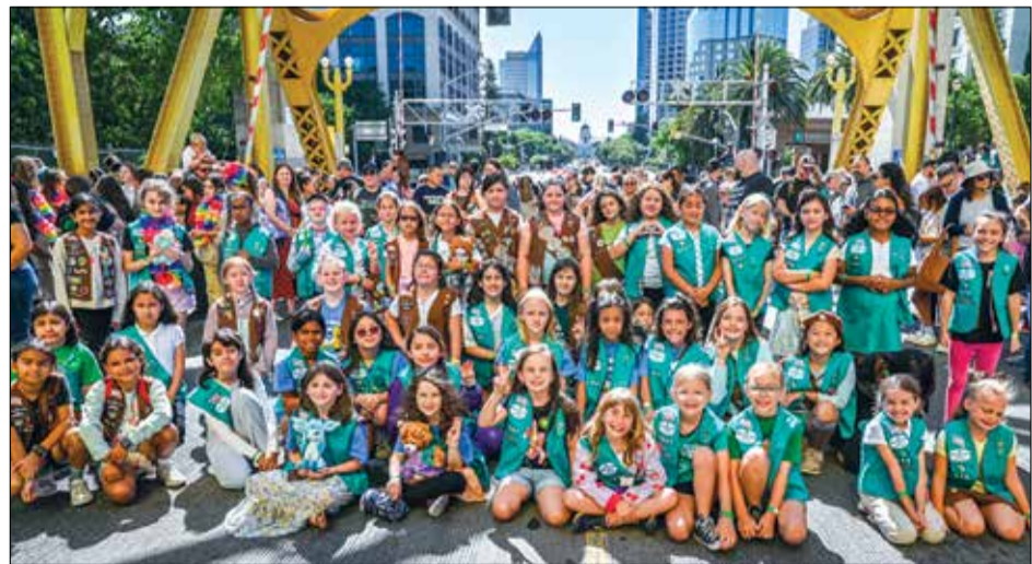
Through various programs and initiatives, Girl Scouts Heart of Central California empowers girls to take the lead in their lives and communities.