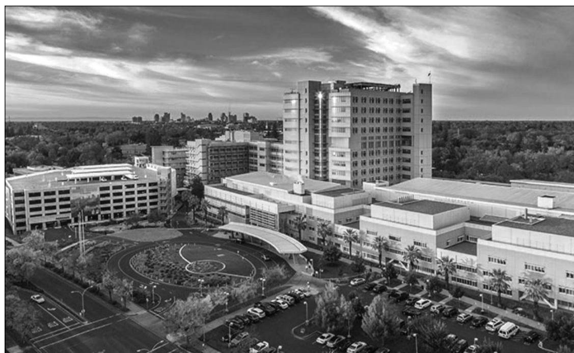
This year, UC Davis Medical Center was one of only 76 hospitals nationwide to receive recognition as one of best regional hospitals for community access.

UC Davis Medical Center ranked among the Top 50 hospitals nationwide in six specialties: Ear, Nose and Throat (number 27), Geriatrics (number 27), Neurology and Neurosurgery (number 27), Pulmonology and Lung Surgery (number 27), Cardiology, Heart and Vascular Surgery (number 46)