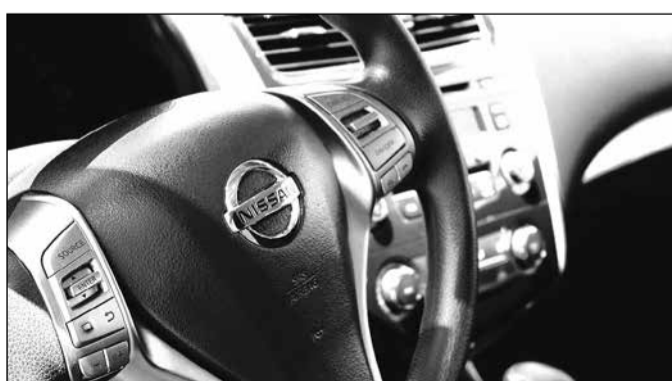
the number of vehicles stolen statewide has dropped by 13% from 2023 to 2024 – the first year-over-year decrease since 2019.

As a result of these public safety collaborations, each of these counties saw a significant drop in vehicle thefts in 2024. Alameda: