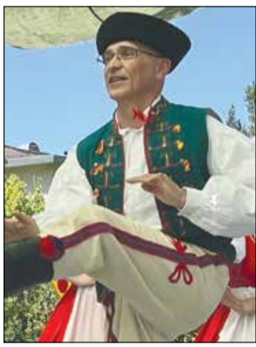
Dance the polka or, while you eat, enjoy the music.