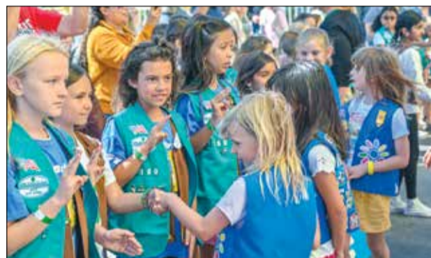
Backed by trusted adult volunteers, mentors and millions of alums, Girl Scouts Heart of Central California leads the way as they find their voices and make changes that affect the issues most important to them.

Backed by trusted adult volunteers, mentors and millions of alums, Girl Scouts lead the way as they find their voices and make changes that affect the issues most important to them. To join us, volunteer, reconnect or donate, visit www.girlscoutshcc.org . ★