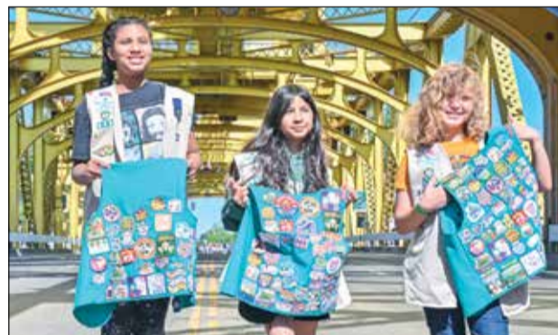
The Capitol Bridging Ceremony on June 21 is one of the most symbolic events of the year for Girl Scouts Heart of Central California and reflects the organization's continued commitment to building girls of courage, confidence and character who make the world a better place.