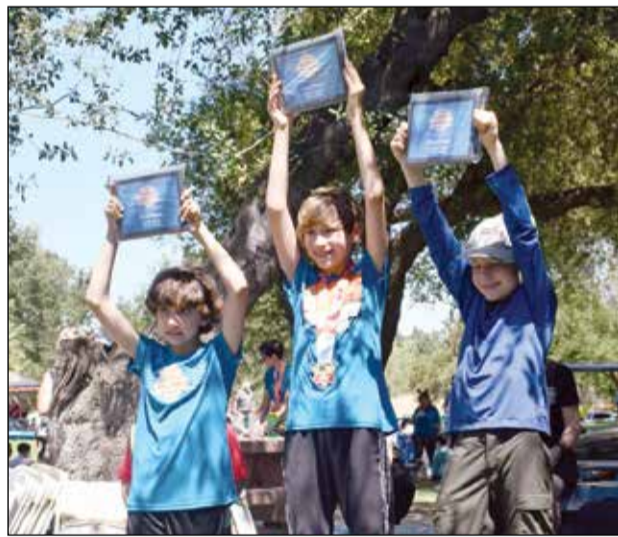
First-place Junior Relay 18U stand at the podium holding their winning plaques at the Great American Triathlon on Saturday July 19.

Billed as the region's premier summertime outdoor sporting event, the triathlon follows the historic route of Eppie's Great Race, which began in 1974 and earned a reputation as the "World's Oldest Triathlon." Revived and