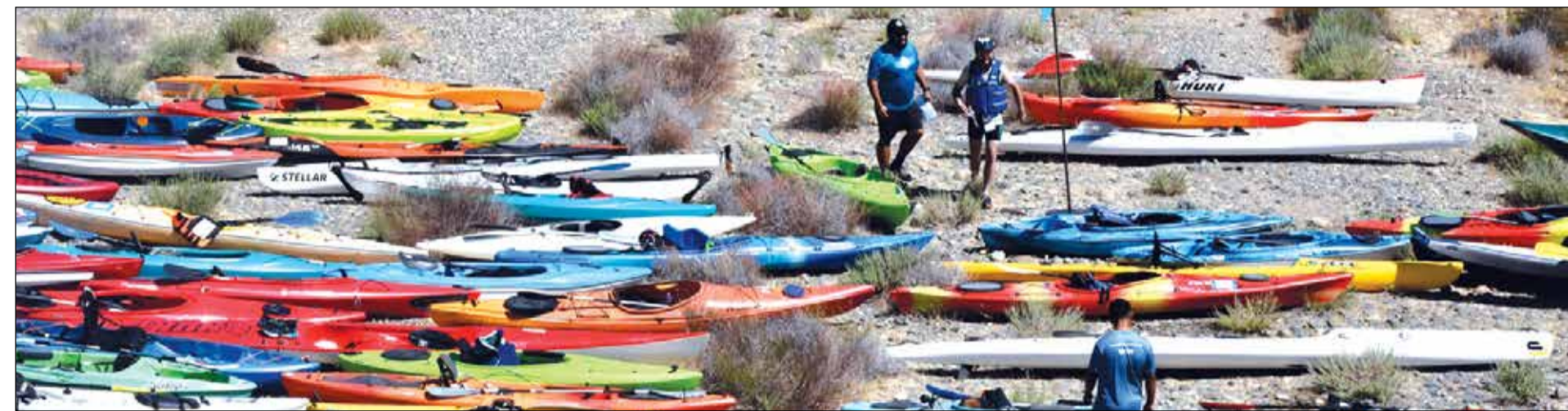
A sea of colorful kayaks lines the ground at the fifth annual Great American Triathlon.