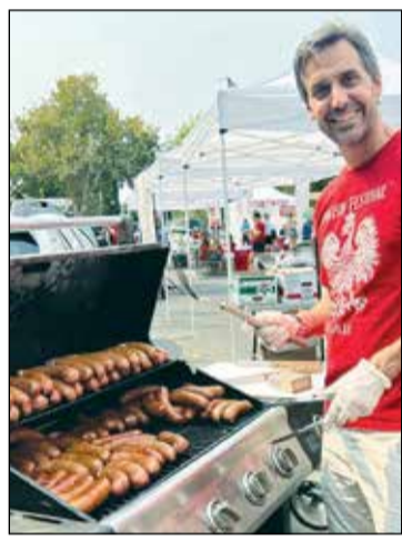
Polish sausage sandwiches are another big draw for festivalgoers.