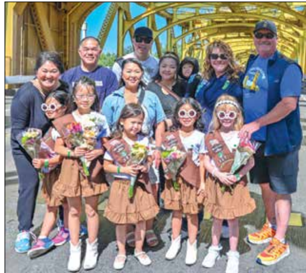
Girl Scouts Heart of Central California (GSHCC) hosted its annual Capitol Bridging Ceremony on June 21, bringing together Girl Scouts of all ages for a memorable morning of reflection, celebration and advancement.