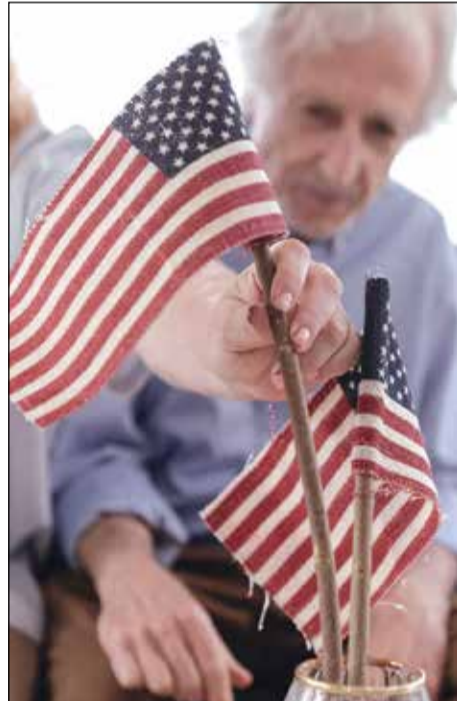
Sacramento County's Veterans Services Office plays a vital role in helping veterans and their dependents access life-changing benefits.