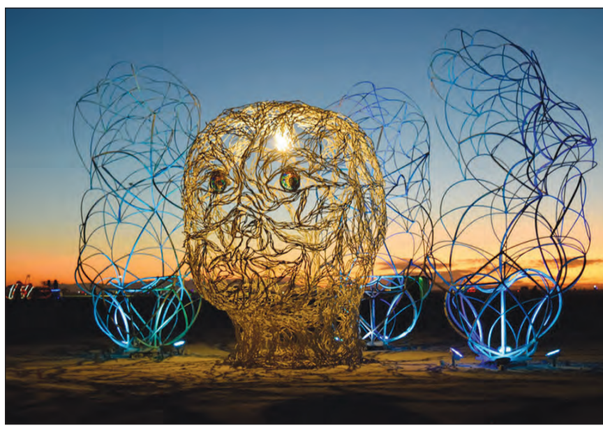
"Internal Exposure" by Jessica Levine will be located at 1817 Capitol Ave.