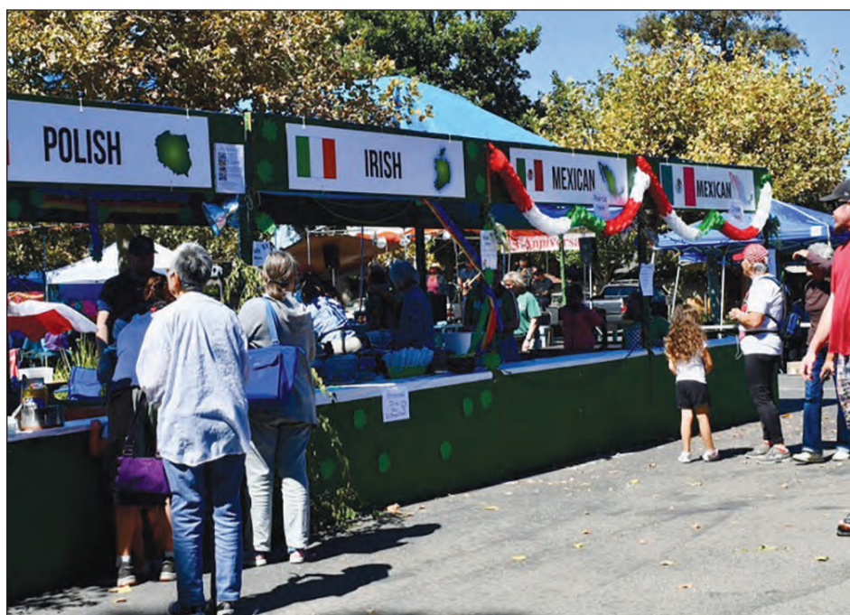
Left and above: The St. Anthony Community & Cultural Food Festival will showcase a variety of food booths, games and entertainment on Sept. 6 at 660 Florin Road.