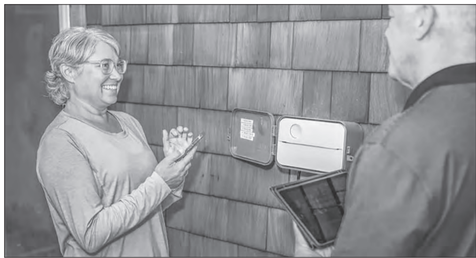
Sacramento residents who need help cutting back on how much water they use this summer can schedule a free house call with the city's water conservation team.