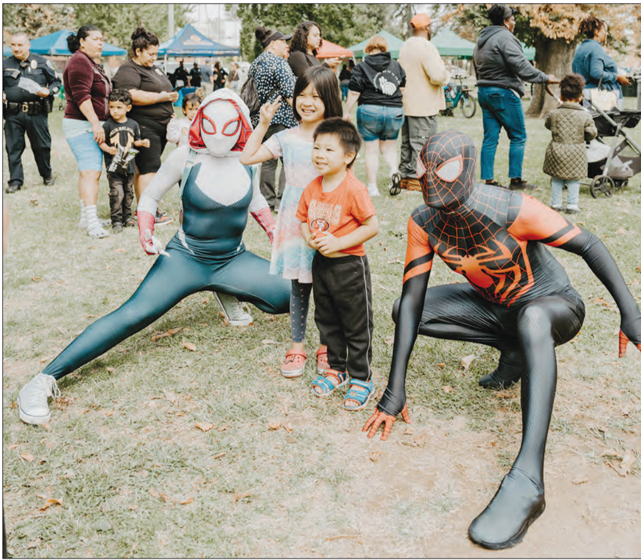
There are several back-to-school celebrations and resource fairs scheduled in the area, offering free school supplies, food, services and entertainment.