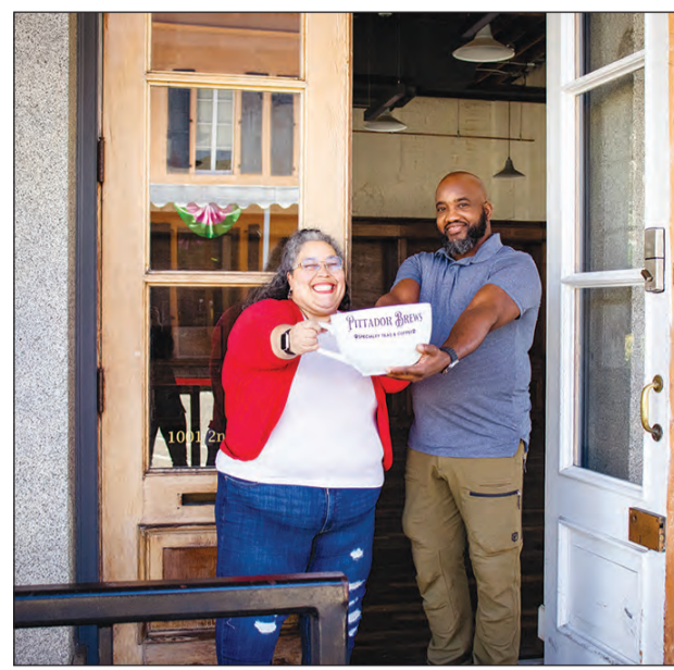
Pittador Brews, last year's Calling All Dreamers winner, plans to open in September in Old Sacramento Waterfront.

The selection committee will choose the five program finalists in December