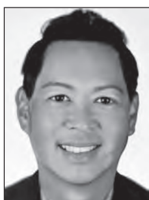
Gavin Joe Photos courtesy of United Way California Capital Region