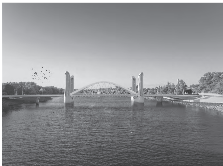
The long-anticipated I Street Bridge Replacement Project is expected to take four years to finish. Construction is expected to begin in spring 2026.

Construction is expected to begin in spring 2026 and take approximately four years to complete. ★