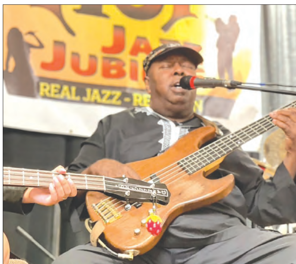
Five venues will offer music for the Hot Jazz Jubilee at the Doubletree by Hilton Sacramento, ranging from the large Grand Ballroom to the more intimate Garden Terrace and RJs.

For special group rates, inquire at info@hotjazzjubilee.com. ★