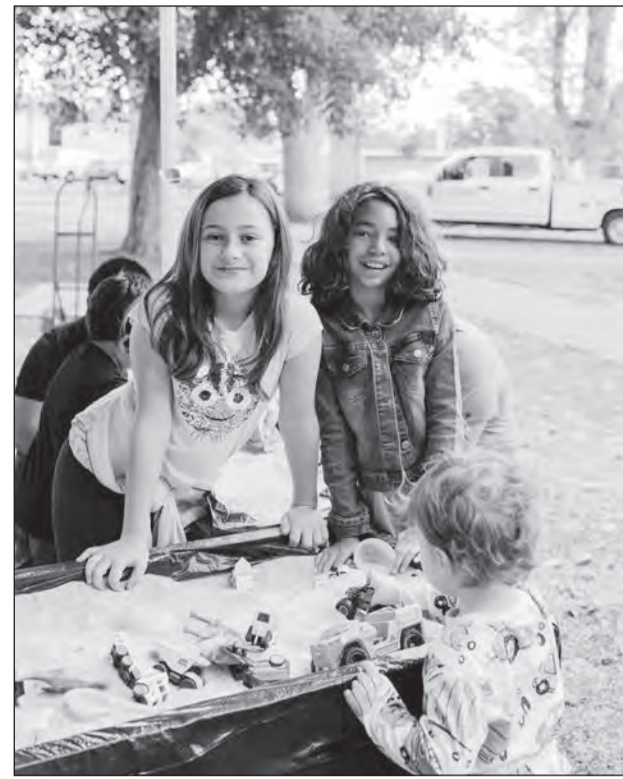
Hosted by The Hope Community Church, the Back 2 School Block Party event Aug. 23 at McClatchy Park (3500 Fifth Ave.) aims to connect families with resources and provide a fun experience for youth in the community to become excited about the new school year.

Continued from page 1 10 a.m. Those interested in attending can register at williamland.scusd.edu/calendar/2025-08 .