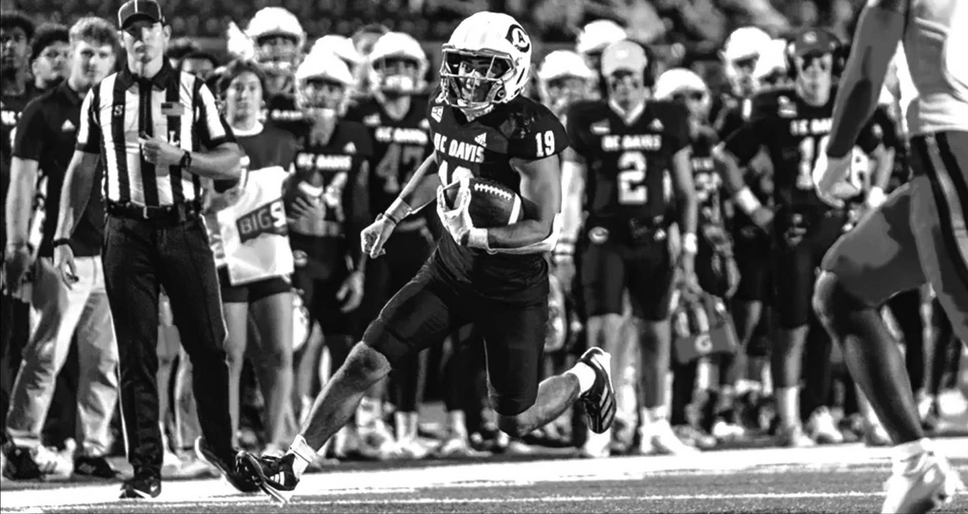
University of California, Davis returns a large collection of talent from its historic 2024 squad that finished ranked No. 5 in the nation after going 11-3.