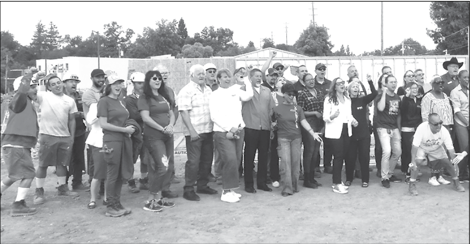
Here is a group photo prior to the wall raising on Aug. 15.