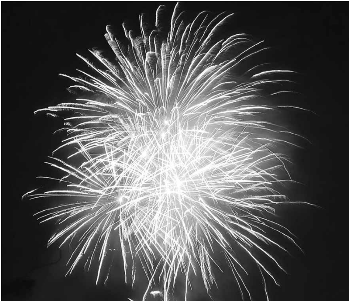
Police Chief Alex Turcotte provided an up-close aerial drone’s eye view from 1,000 feet in the sky as colorful bursts from illegal fireworks lit up the July 4 skies over just one city neighborhood.

This year, enhanced laws, higher fines, proactive outreach and unmanned aerial support (UAS) drone support combined to improve enforcement and community safety during peak fireworks times over the July 4