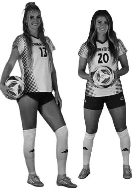
Following a pair of exhibition contests last week, California State University, Sacramento officially kicks off the 2025 season on the road on Aug. 14, after press time, traveling to Pacific for a 7 p.m. start against the Tigers in Stockton.