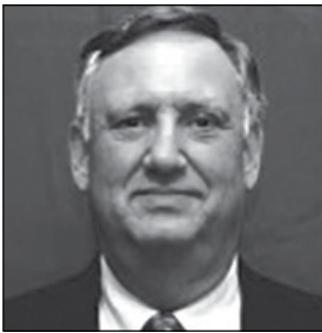
By Dan Walters, CALMatters.org

Gov. Gavin Newsom justifies — or rationalizes — his drive for a mid-decade reconfiguration of California’s congressional districts as a heroic mission to thwart President Donald Trump’s power grab. Newsom, who seems to be edging ever closer to a 2028 presidential campaign, proposes to alter the state’s 53 districts to shift five or six seats now held by Republicans into Democratic hands during the 2026 elections. If successful, it would neutralize efforts by Texas Republicans to gerrymander its districts to gain a similar number of seats. Republicans hold a paper-thin majority in the House of Representatives and Trump has sought mid-decade redistricting in Texas and other red states to block Democrats from gaining control in 2026. The Texas situation is in limbo because Democratic legislators have fled the state, but how long they can hold out is unclear. Newsom played host to some Texas Democrats last week as he talked up action in California, which would require voter approval in a November special election. “I think the voters will approve it. I think the voters understand what’s at stake,” Newsom said on Friday. “We live in the most un-Trump