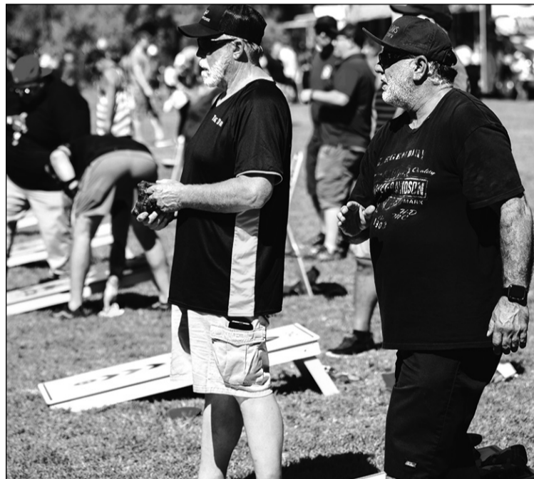
Players look forward to participating in the Fair Oaks Chamber of Commerce's Cornhole Tournament during the Fair Oaks Chicken Festival.

enhancing business success in the community, the Chamber of Commerce promotes local businesses and offers valuable networking and advocacy