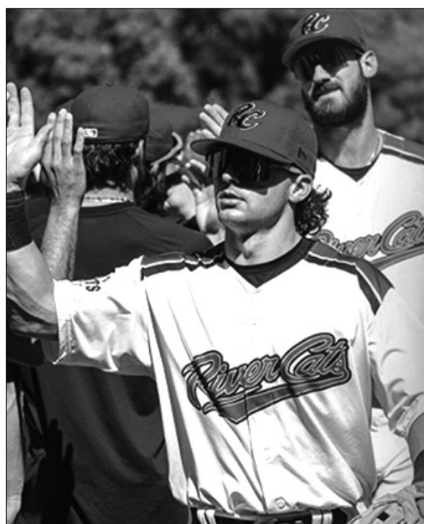
A total of 13 series will be hosted by the River Cats at Sutter Health Park, opening with a three-game set against the El Paso Chihuahuas (San Diego Padres) from March 27 to 29.

The River Cats travel twice to face off against the Salt Lake Bees (Los Angeles Angels) in the first weeks of action, spending six games in the Beehive State from March 31 to April 5 before returning from April 28 to May 3. Salt Lake visits Sacramento twice in 2026, starting from July 7 to 12 before coming back from Sept. 1 to 6.