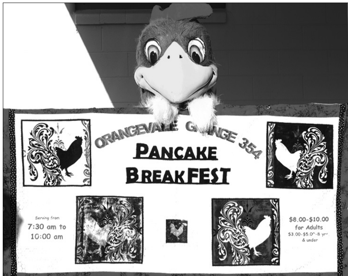
The lovable Rocky is at every Orangevale/Fair Oaks Grange number 354 pancake breakfast.

Nearby, you'll find some friendly competition at the Cornhole Tournament, hosted by the Fair Oaks Chamber of Commerce. As a nonprofit organization supporting and