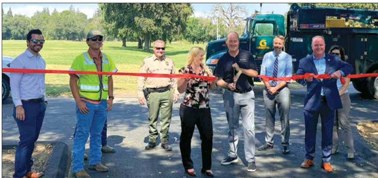
Representatives from Sacramento County and Granit Construction celebrate the reopening of Ancil Hoffman Park in Carmichael with an Aug. 26 ribbon cutting.

Sacramento County Parks and Recreation News Release