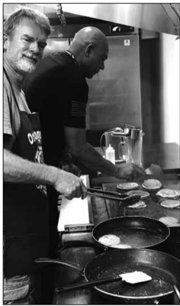
Orangevale/Fair Oaks Grange number 354 members prepare the annual pancake breakfast. Breakfast proceeds support Future Farmers of America (FFA) and the Grange's Garden Project.