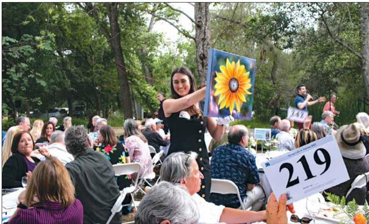
Original works by high-profile artists are among auction items at the Effie Yeaw Nature Center gala. Guests will wine and dine beneath a natural canopy in the center's reserve.

Story and photo by Susan Maxwell Skinner