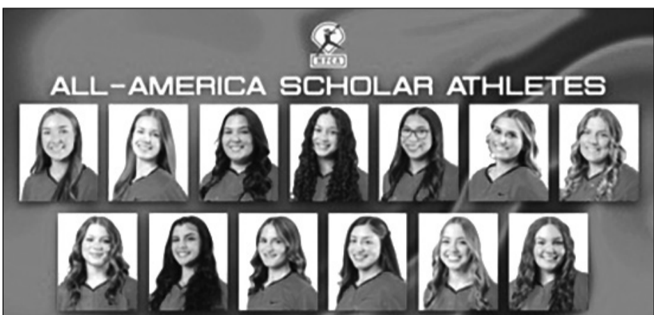
This season, the Hawks put 13 players on the Easton/National Fastpitch Coaches Association All-America Scholar-Athlete Team.