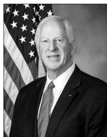
Rep. Mike Thompson (CA-04)

Mike Thompson represents California’s 4th Congressional District. The district includes all or parts of Lake, Napa, Solano, Sonoma and Yolo Counties. He was first elected in 1998. Prior to serving in Congress, Thompson represented California’s 2nd District in the California State Senate, where he chaired the powerful Budget Committee. ★