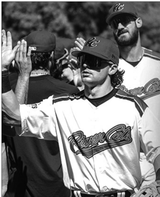
A total of 13 series will be hosted by the River Cats at Sutter Health Park, opening with a three-game set against the El Paso Chihuahuas (San Diego Padres) from March 27 to 29.

The River Cats travel twice to face off against the Salt Lake Bees (Los Angeles Angels) in the first weeks of action, spending six games in the Beehive State from March 31 to April 5 before returning from April 28 to May 3. Salt Lake visits Sacramento twice in 2026, starting from July 7 to 12 before coming back from Sept. 1 to 6.