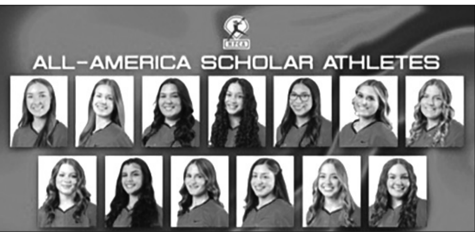
This season, the Hawks put 13 players on the Easton/National Fastpitch Coaches Association All-America Scholar-Athlete Team.