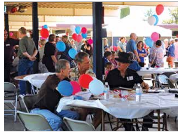
A day of festivities will celebrate the 65th Mira Loma High School anniversary on Sept 27.

For more information, visit miralomaalumniandfriends.com ★