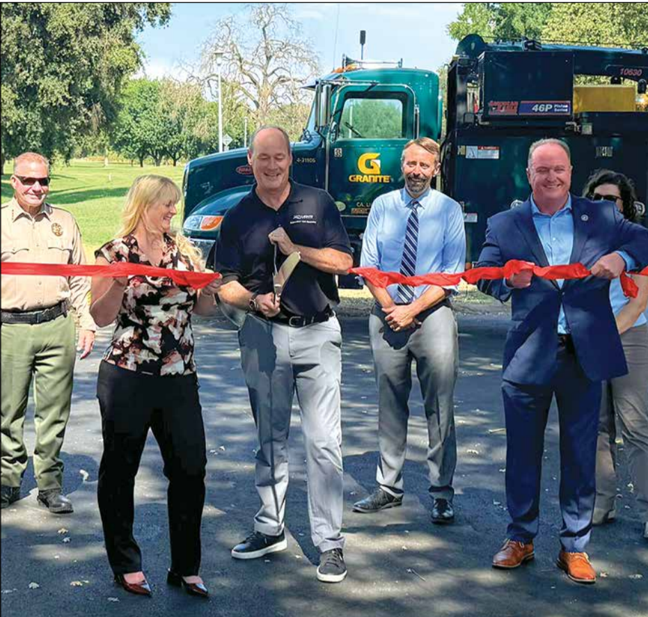
Representatives from Sacramento County and Granit Construction celebrate the reopening of Ancil Hoffman Park in Carmichael with an Aug. 26 ribbon cutting.

San Juan Unified School District's McKinney-Vento Department representatives did not respond to the Citrus Heights Messenger's multiple requests for comment about the proposed federal cuts or their likely local impact.