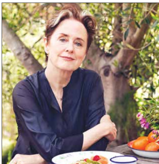
Celebrity chef Alice Waters is one of the many world-renowned culinary talents participating at the Terra Madres America festival from Sept. 26 to Sept. 28 at the downtown SAFE Credit Union Convention Center, 1401 K St., Sacramento.

Visit Sacramento curated a playlist for attendees to get a sneak peek of the music that will be heard at Terra Madre Americas Festival on Spotify at bit.ly/41CSL6U (case sensitive).