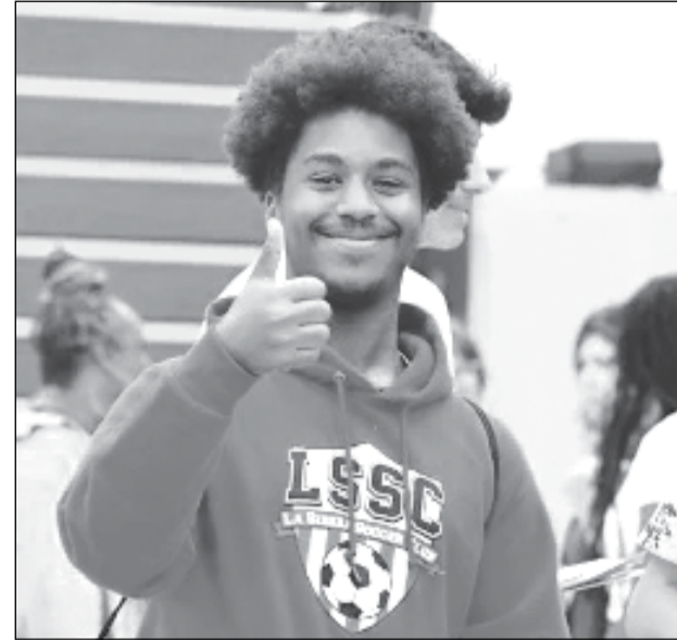
College Week kicks off its college-readiness celebrations starting Sept. 18 with the Historically Black Colleges and Universities Recruitment Fair.

SACRAMENTO REGION, CA (MPG) - College application season has begun and San Juan Unified District will host a variety of opportunities from Sept. 18 to Sept. 26 to help students explore educational options and prepare for post-secondary success.