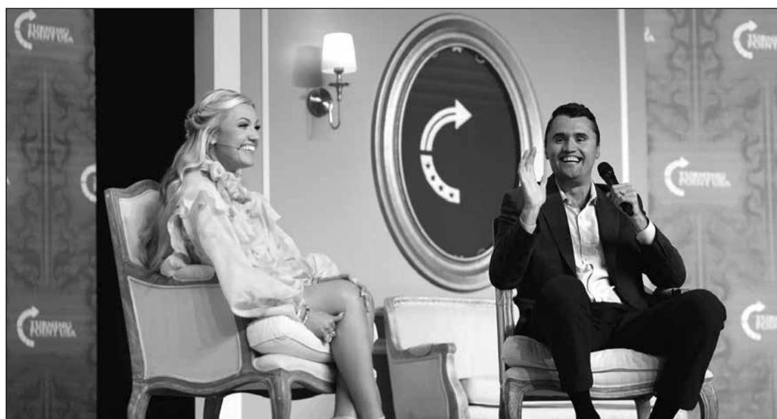
Charlie Kirk and his wife, Erika, speak together at an event in Texas in 2025.

It was not about demanding agreement but about proving that open dialogue matters more than uniformity of thought. He even sat with California Governor Gavin Newsom; while the two disagreed on most issues, they still managed to show millions of viewers what respectful debate