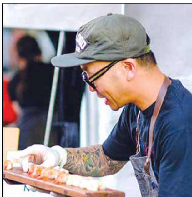
Presented by Visit Sacramento and Slow Food, Terra Madre Americas will be dedicated to showcasing the diverse flavors and traditions of Sacramento and cultures from around the globe Sept. 26 to Sept. 28 at SAFE Credit Union Convention Center, 1401 K St., Sacramento.