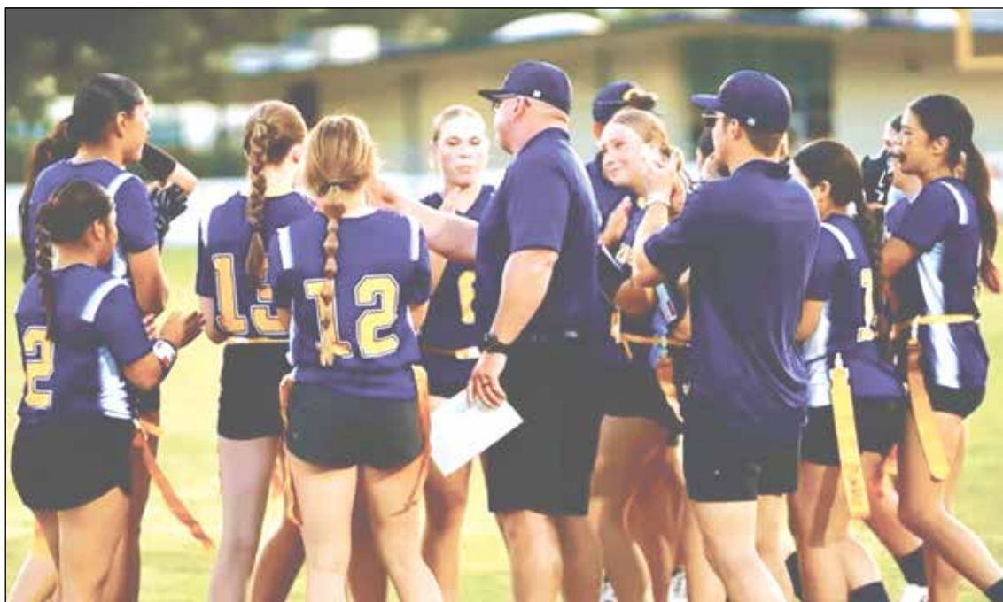
The Gridley Bulldogs Girls Flag Football team won their first game on Sept. 8 26-6 against the Center Cougars. Gridley is the lone Northern Section team with flag football.

For more updated sports content on all local volleyball, flag football and football action, go to ysbcsports.com . ★