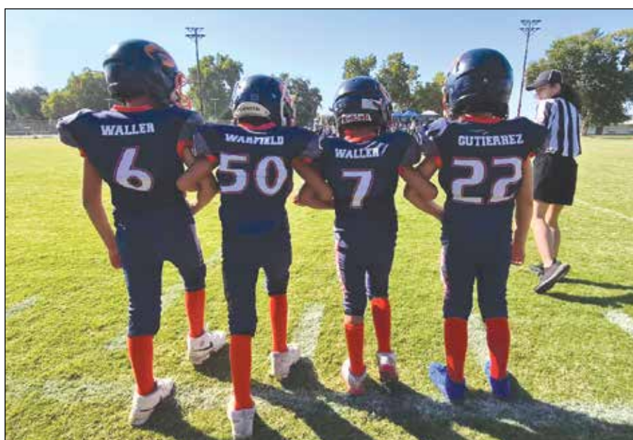
Titan 8U captains ready to take the field.