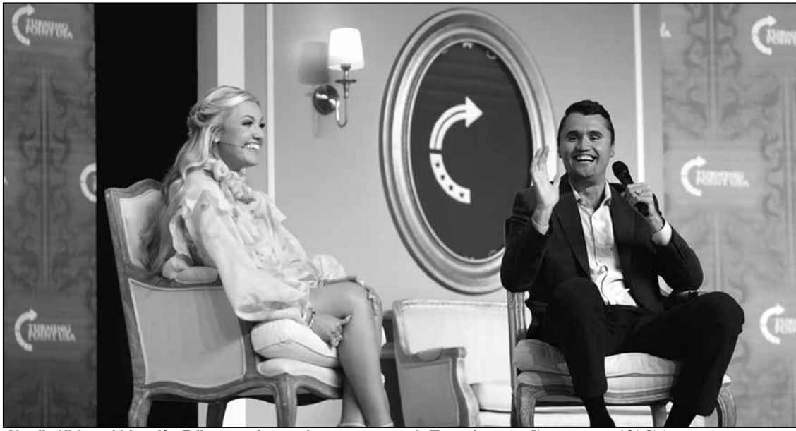
Charlie Kirk and his wife, Erika, speak together at an event in Texas in 2025.

It was not about demanding agreement but about proving that open dialogue matters more than uniformity of thought. He even sat with California Governor Gavin Newsom; while the two disagreed on most issues, they still managed to show millions of viewers what respectful debate