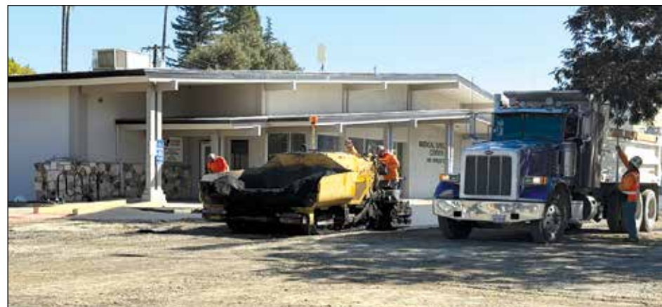
Gridley Medical Specialty Center parking lot was ripped out Monday as part of a resurfacing project.

Staff and patients are advised to locate the nearest and most secure available parking, making use of surrounding roadways or designated hospital parking