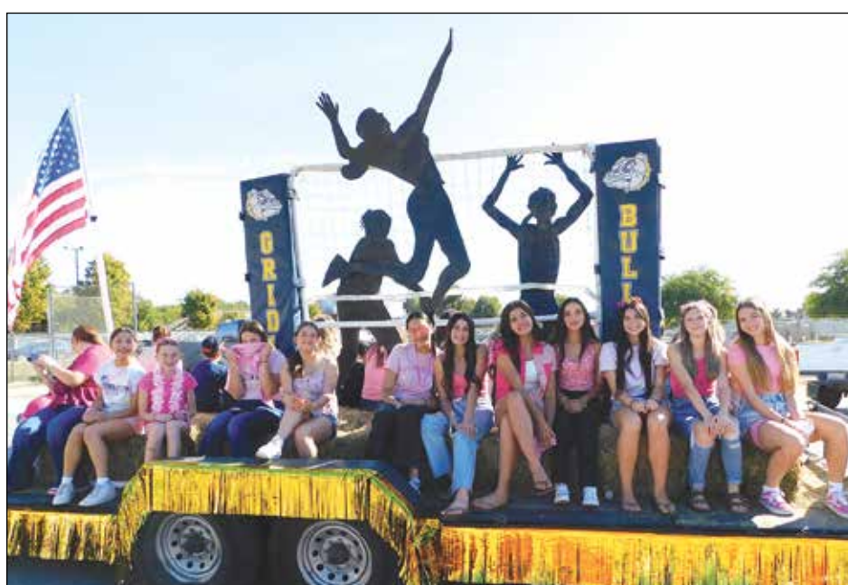
Each year, clubs, teams and senior students band together to parade through town. Last year, leadership students joined Volleyball players to ride down their awesome team float for the Homecoming Parade.

Saturday, couples will dance the night away under "A Night in Paris." The homecoming dance will be held from 8 to 11 p.m. with pre-sale ticket prices beginning at $20 a ticket (with ASB card) and $35 a couple (with ASB card). Ticket prices will increase during the week of Homecoming. Students planning to bring a non-Gridley High School student will need to contact the high school office for guest-pass accommodations. ★