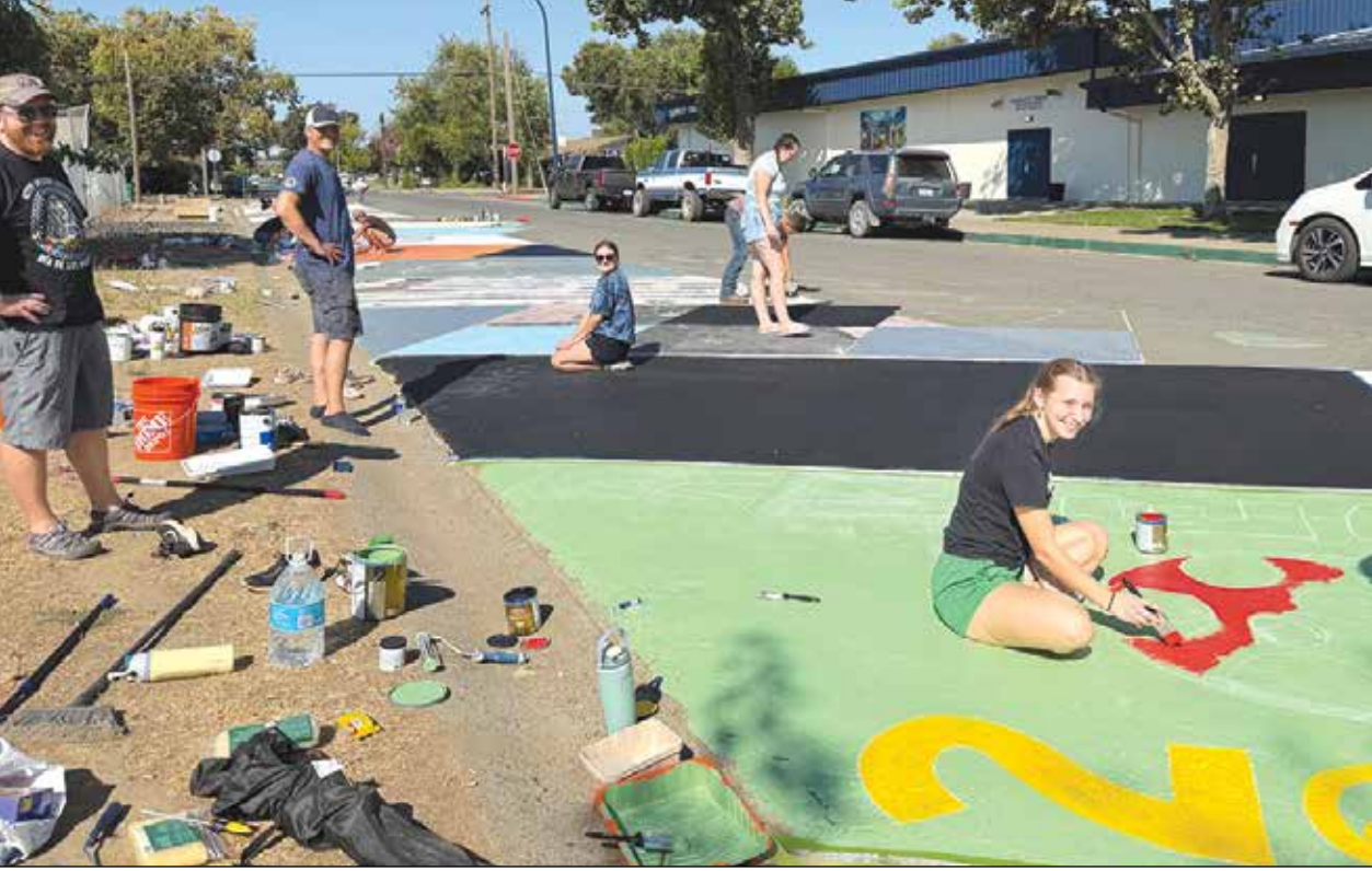
A large amount of seniors and parents turned out Saturday Sept. 13 to memorialize their senior year by painting their parking spaces.

GHS Seniors Continue Street Painting Tradition