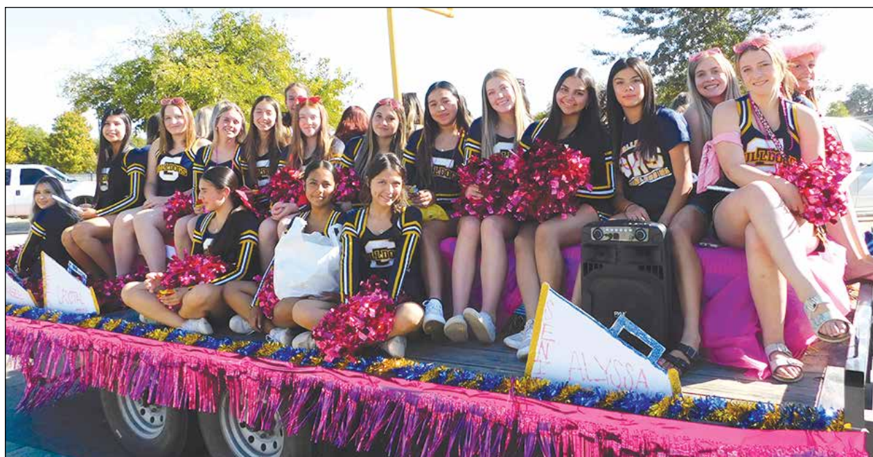
Sitting pretty with school spirit, the 2025 cheerleaders always bring a bit of sparkle and flash to last years Homecoming parade.