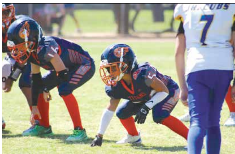
10U Titans players No. 5 and No. 16 get ready to face off against the Anderson Cubs.

The Titans travel to face Weed next week for their first divisional game of the season. ★