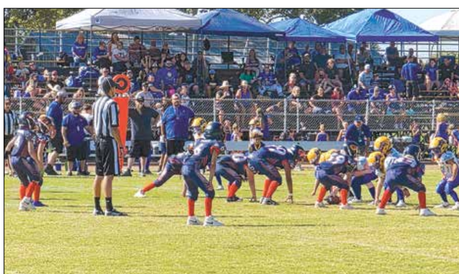
Titans push hard against the Anderson Cubs at the Gridley High School Boneyard.