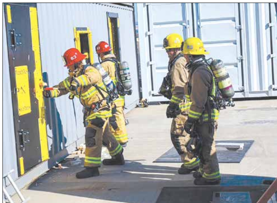
On Friday, Sept. 12, CAL FIRE/Butte County Training and Safety Bureau, alongside several field Battalion Chiefs, hosted a multi-company drill at our Openshaw Training Center.