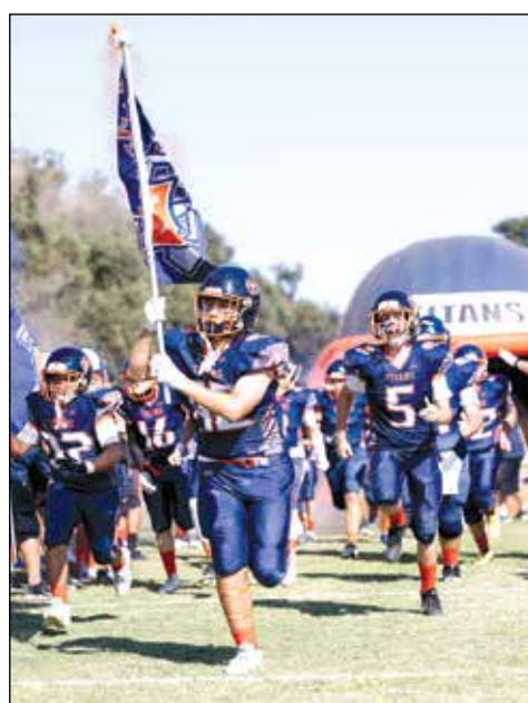
The 14U Titans run onto the field carrying their colors.

The 14u Gridley Titans look forward to starting league play this week. It will be an away game vs the Weed Jr Trojans. ★