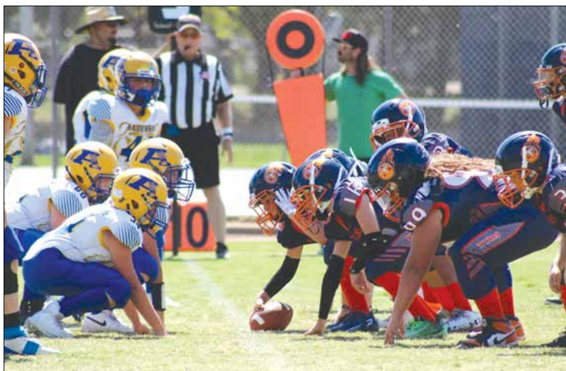
Titans on the line, getting ready to score.

The Titans travel to Weed next week to take on the Siskiyou Trojans. ★