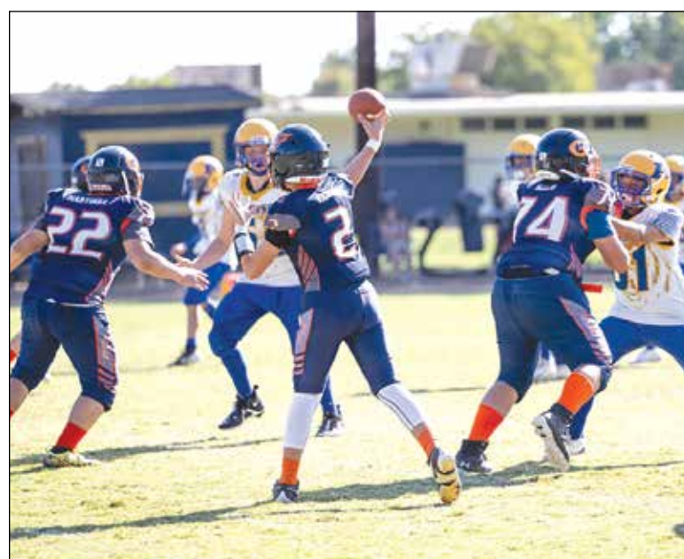
Titans quarterback No. 2 fires one off to one of his receivers.