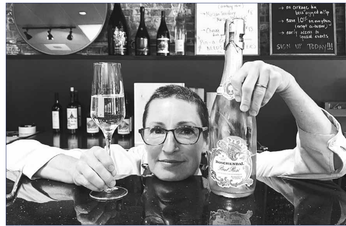
Pip Wine Bar, located at 116 N. 1st St., opened its doors March 4, 2020, offering a curated wine experience in a relaxed, welcoming setting. Founded by Amy Grabish, the space was established as a cozy place that was neither a traditional bar nor a formal tasting room.