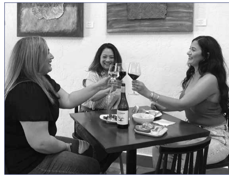
Pip Wine Bar also hosts private events and tastings both on- and off-site. Its Wine Club offers curated monthly selections, with benefits such as discounts and complimentary corkage on in-house consumption.