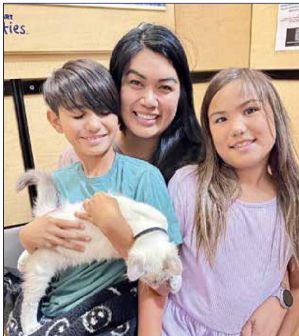
Solano Kitten Network hosts adoptions from 1:30 to 4 p.m. every Saturday at PetSmart in Vacaville and will hold its second annual Scentsy Bingo Night fundraiser on Nov. 2. The event is the organization's biggest fundraiser of the year, as it relies entirely on donations.