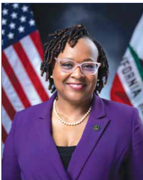
The Office of Assemblywoman Lori D. Wilson is hosting an event from 10 a.m. to 3 p.m. Sept. 30. Held at City Hall, 600 E. A St., the event offers constituents the opportunity to schedule one-on-one meetings with Assemblywoman Wilson.

Dixon Community Theater will begin auditions for its production of The Christmas Express from 6 to 8 p.m. Sept. 29 and 30. Hosted at Veterans' Memorial Hall, 1305 N. First St., the theater is looking to cast actors 18 and up. Show dates are listed as Nov. 28, 29, 30 and Dec. 5, 6 and 7. The production