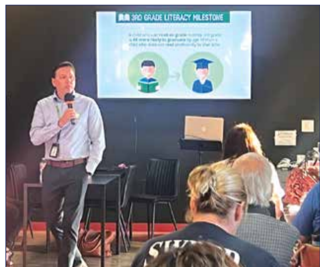
Barley's presentation focused on the importance of early literacy and its impact on long-term student outcomes. The Superintendent emphasized that students who read proficiently by elementary school are more likely to attend college, find stable careers and avoid involvement in the criminal justice system.

Future Kiwanis Club events include participation in National Night Out on Oct. 1 at