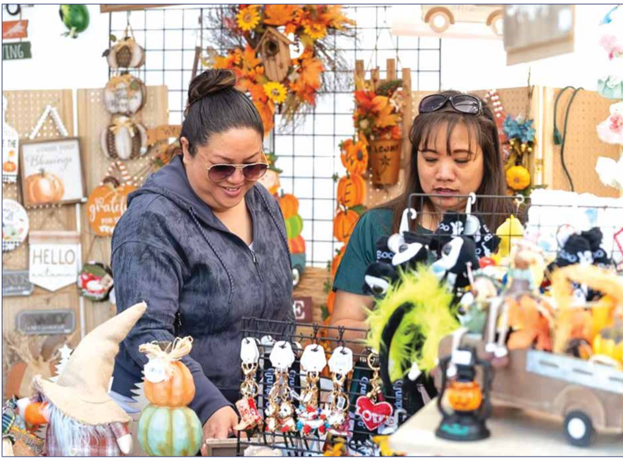
The Solano County Fall Home & Garden Show returns this weekend to the Dixon Fairgrounds from 10 a.m. to 4 p.m. Sept. 20 and Sept. 21, marking its 10th anniversary. About 75 vendors, live demos and family-friendly attractions will be set up at the event.