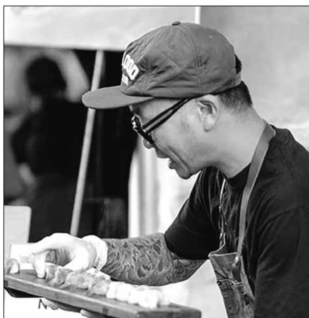
Presented by Visit Sacramento and Slow Food, Terra Madre Americas will be dedicated to showcasing the diverse flavors and traditions of Sacramento and cultures from around the globe Sept. 26 to Sept. 28 at SAFE Credit Union Convention Center, 1401 K St., Sacramento.