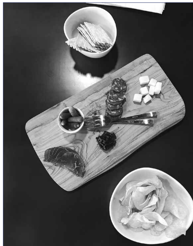
The bar features a rotating inventory of approximately 200 wines and offers light food options, although it is not a full-service restaurant. Outside food is not allowed but customers can bring celebration desserts for a fee.

For more information, visit thepipwinebar.com or call 707-693-3069. ★