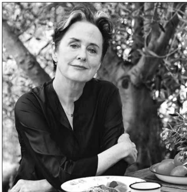
Celebrity chef Alice Waters is one of the many world-renowned culinary talents participating at the Terra Madres America festival from Sept. 26 to Sept. 28 at the downtown SAFE Credit Union Convention Center, 1401 K St., Sacramento.

Visit Sacramento curated a playlist for attendees to get a sneak peek of the music that will be heard at Terra Madre Americas Festival on Spotify at bit.ly/41CSL6U (case sensitive).