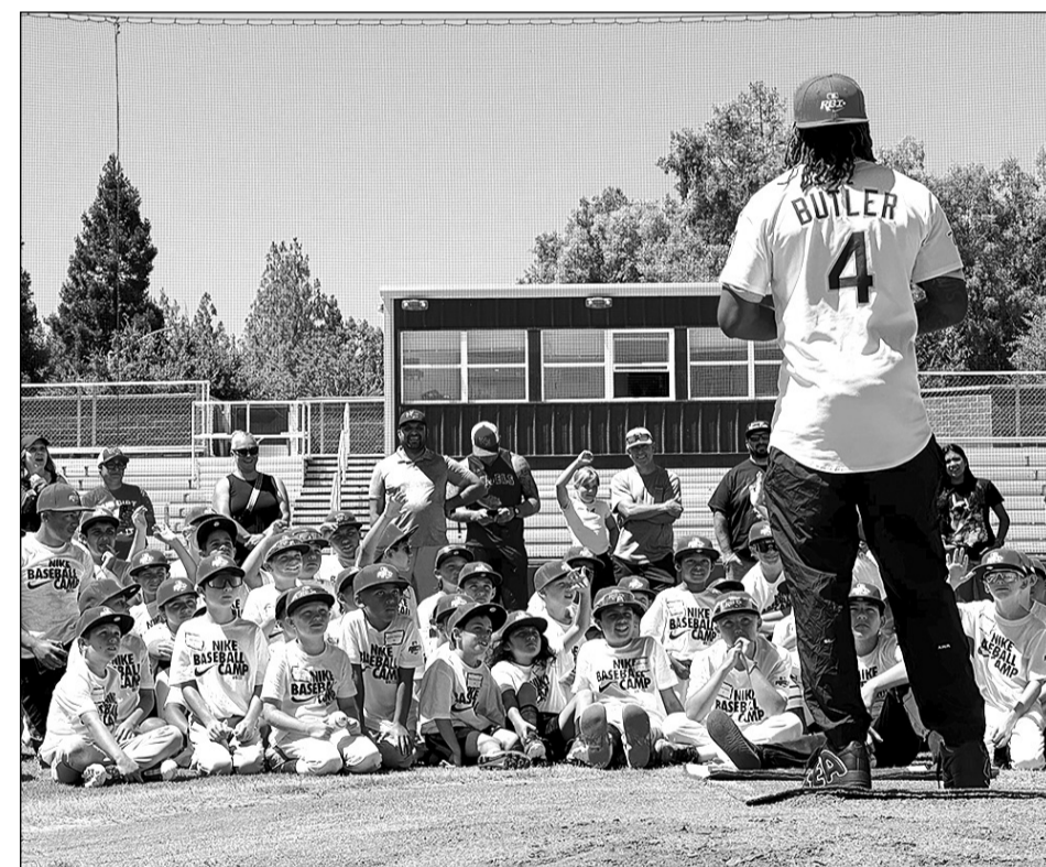
Lawrence Butler's nomination highlights a season defined by leadership and impact beyond the diamond for the Athletics.