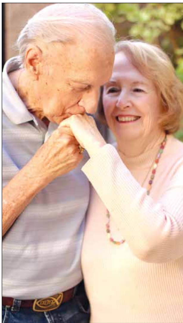
The couple first met in 1955 and have shared a life journey built on devotion, patience and laughter.

Louie still tears up remembering the sight of