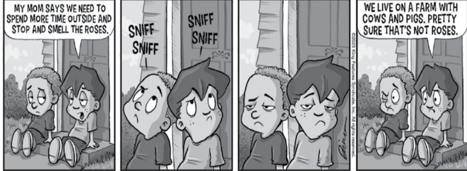
Out on a Limb