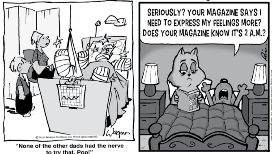
Just Like Cats & Dogs