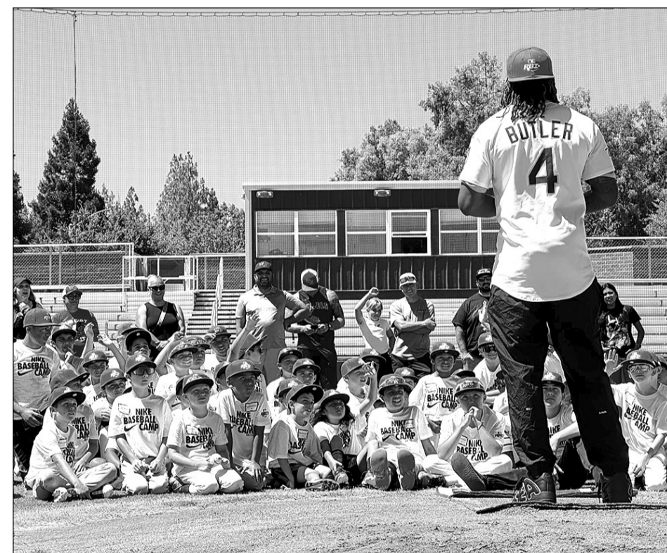
Lawrence Butler's nomination highlights a season defined by leadership and impact beyond the diamond for the Athletics.