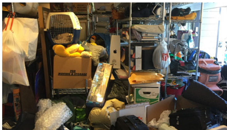
Get a handle on the messy garage before winter is here.

Install or replace weatherstripping on doors and windows