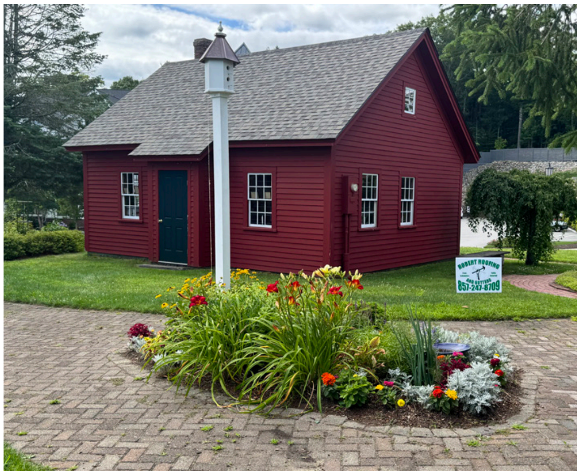
Robert Roofing recently donated a new roof to the historic Norfolk "Tramp House," originally built in 1886.

there are some things to look for that may signal the need for care, especially if it is an older home (20+ years old). Note if any shingles are curled or buckled, or missing altogether, and check if there are any fiberglass strands shining through on the shingles or granules in your gutters or at the end of downspouts. Any or all of these things could mean that you need repairs or replacement, and it's best to get this done before winter hits.