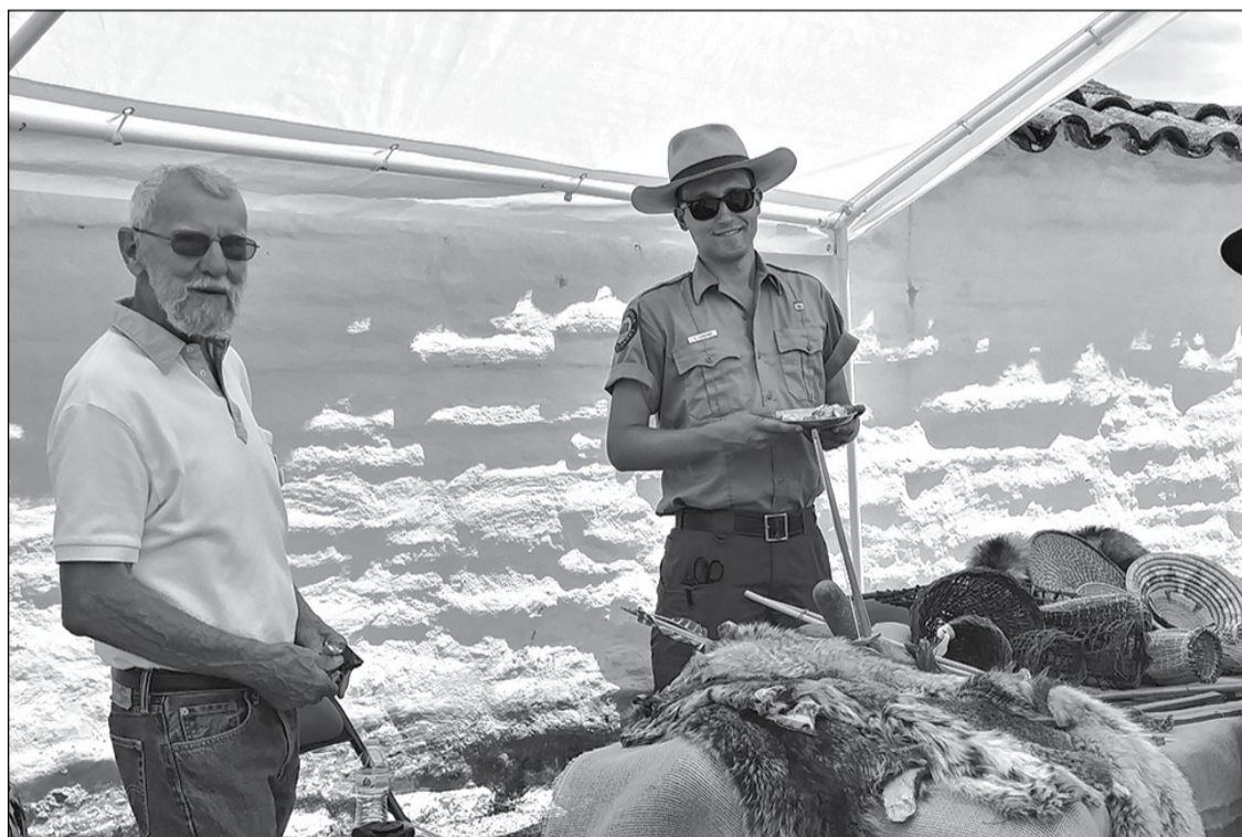
Let the adventures begin. California State Parks and First Partner invite fourth-graders and their families to experience the state's unmatched beauty and history for free. It's easy for Sonoma State Historical Park visitors to picture life here in the 1800s. The historic old town of Sonoma comes alive at the state park. Sonoma State Historical Park is an easy drive from this area.