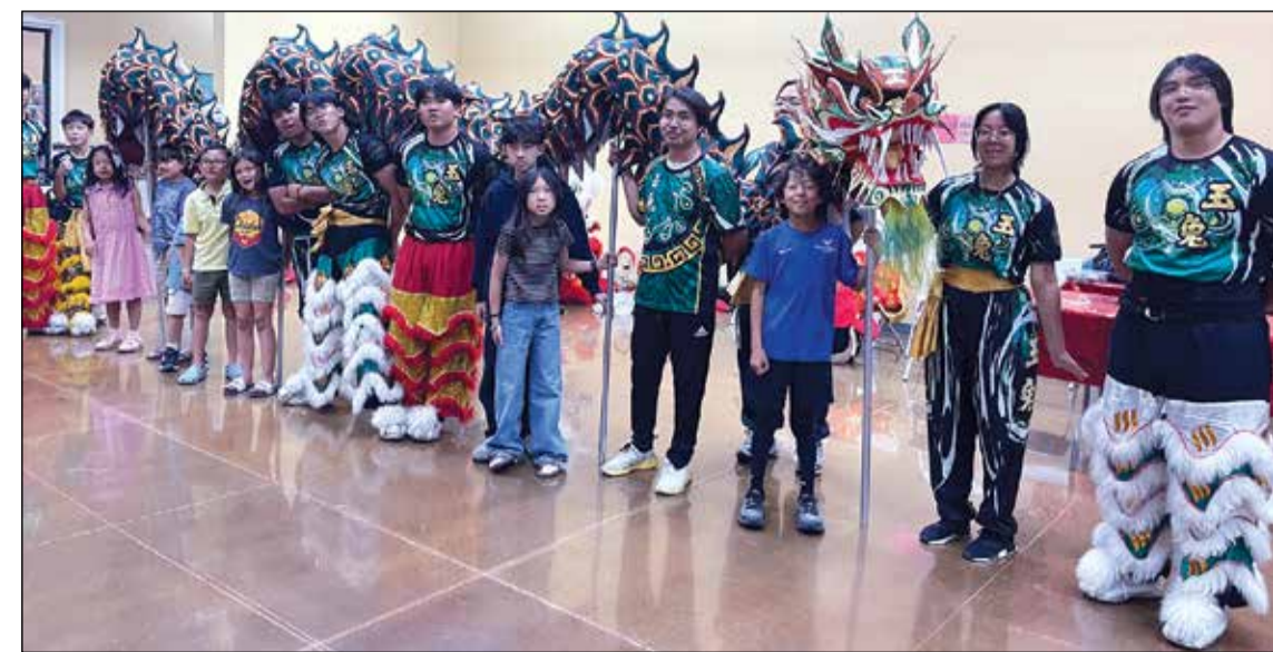
Attendees smile alongside performers for a group photo.

Continued from page 1 thanks for the year's successes while looking ahead to the future.