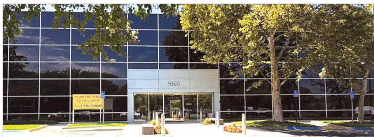
A new exterior drop box is available so that members of the public can turn in their forms after hours. There are currently signs at both the former (3700 Branch Center Road) and new (9300 Tech Center Drive, Suite 100) location to assist the public with the transition.

For any questions regarding the new location or general inquiries about the Public Authority office, call 916-874-2888 or email HHS-PA@Saccounty.gov . ★