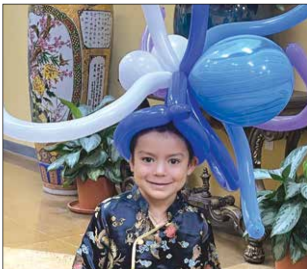
Balloon art was a popular attraction at the Mid-Autumn Festival, where kids requested fun designs that were brought to life with colorful balloons.

The festival, which marked the end of the autumn harvest, featured a variety of activities