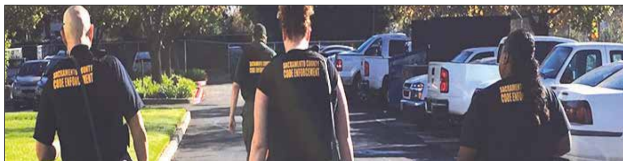
A key factor in this success was a new emphasis on gathering stronger evidence from residents. By working directly with complainants, Code Enforcement was able to turn previously unactionable complaints into enforceable cases.

partnership with the Sacramento County Sheriff's Office and Sacramento Metropolitan Fire District, Code Enforcement used drones to identify violators in real time. Drone operations