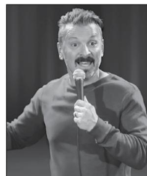
A shift in Zane Lamprey's career has resulted in more tour dates and more opportunities for live audience connection.

At a touring pace of 130 shows per year,