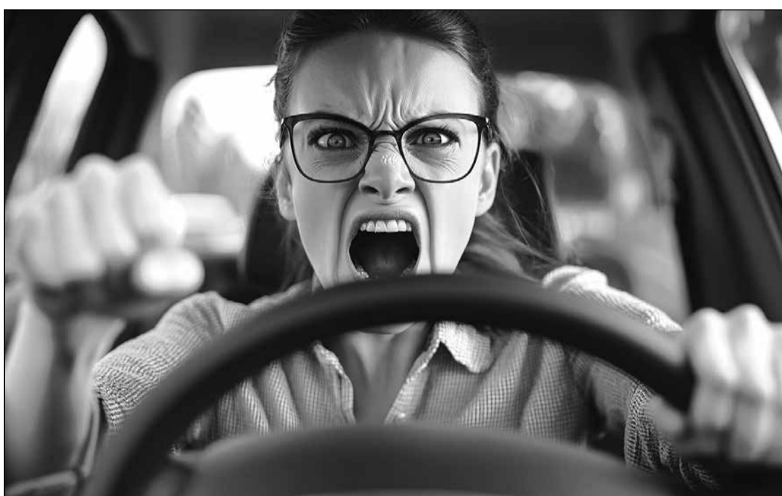
Ninety-two percent of drivers reported aggressive behaviors that put others at risk, such as speeding or cutting off other vehicles. Their top motivators were to get to their destination faster and avoid perceived danger.

The study found that being in a hurry often fuels aggressive behavior on the road. Drivers were also more prone to engage in unsafe behavior as a reaction to other aggressive vehicles. This self-fulfilling cycle of aggressive driving and road rage is fueling a culture where impatience and