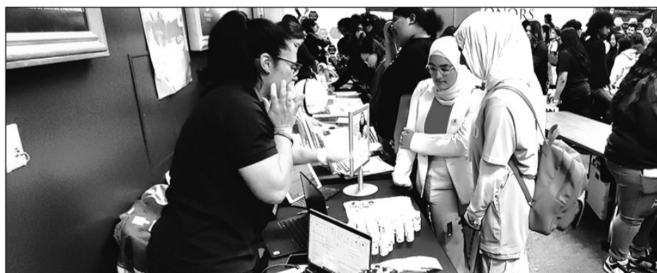
CalKIDS connects with students at the Asian Pacific Islander Desi American Center at the California State University, Sacramento.

CalKIDS scholarships can be used at accredited colleges, universities, community colleges and career training programs across the country. Eligible education-related expenses include tuition and fees, books and school supplies, and computer equipment.