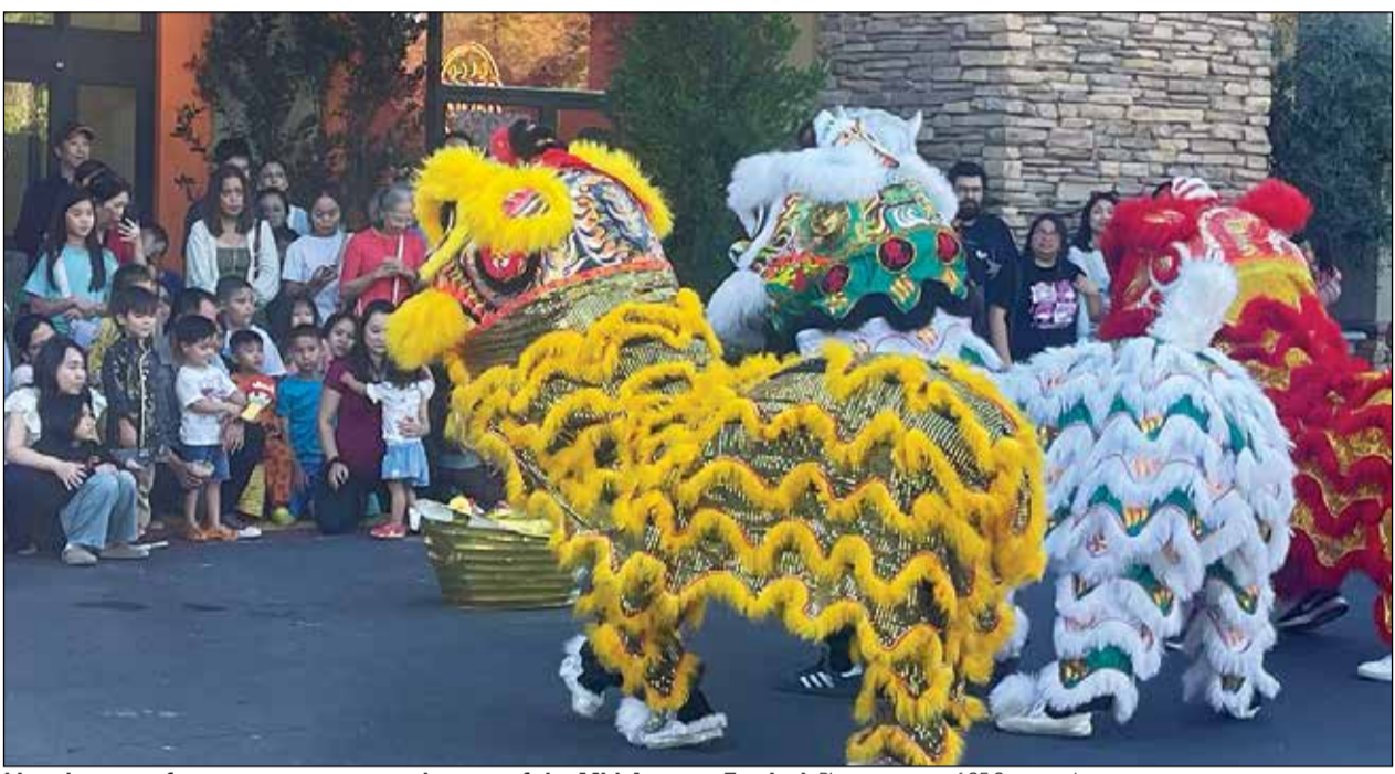
Lion dance performances were a popular part of the Mid-Autumn Festival.

SF Supermarket Hosts Vibrant Mid-Autumn Festival