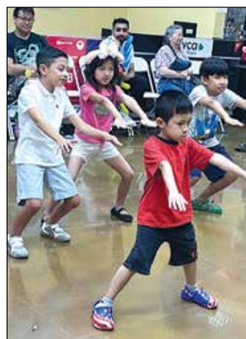
Young children were encouraged to participate in traditional dances at the Mid-Autumn Festival.

participant in the contest. "I added hearts and stars to my lantern."