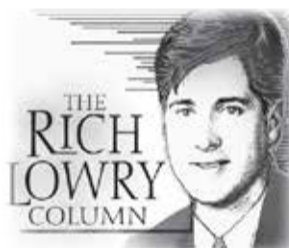
Mississippi, Not California, is the Education Future