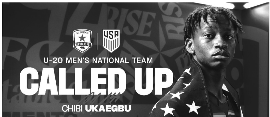
All three of Sac Republic FC's homegrown players have earned National Team call ups this year.