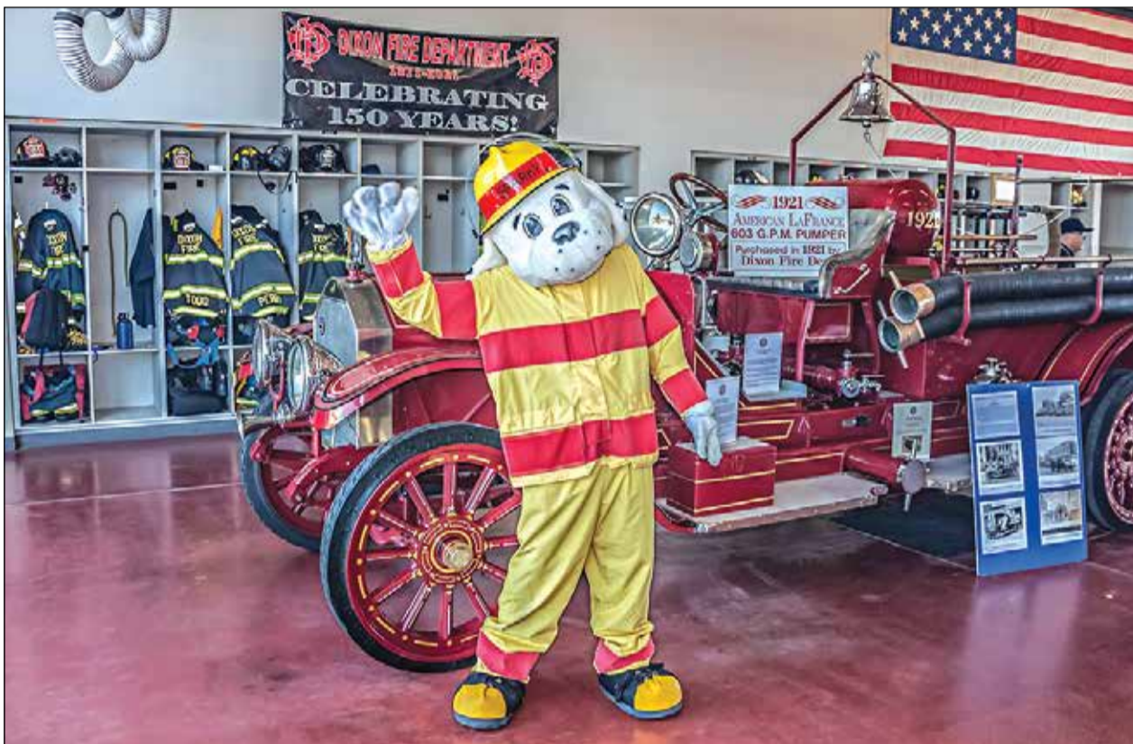
Throughout the day, firefighters demonstrated CPR techniques and allowed children to operate fire hoses, spraying targets under supervision. A smoke chamber and firehouse obstacle course were also available to give attendees a greater understanding of the challenging conditions first responders work through.