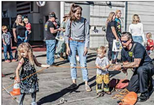
Dixon Fire Department hosted its annual community open house from 10 a.m. to 2 p.m. Oct. 11. The event offered residents a hands-on look at the tools, training and teamwork behind the city's emergency services.

Firefighters, police officers and emergency personnel welcomed guests of all ages with interactive exhibits and demonstrations. A highlight included tours of Fire Station 81, where attendees were guided through living quarters, training areas and the