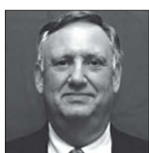
By Dan Walters, CALMatters.org

Refinery Fire Spotlights California's Gas Supply Crunch