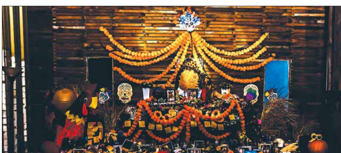
A Dia de los Muertos celebration will take place Nov. 2 from 1 to 5 p.m. at Silveyville Cemetery, 800 S. First St., with music, dancing, food, vendors and remembrance ceremonies.

Nearby, the Western Railway Museum will operate its annual Pumpkin Patch Festival Oct. 11 to 12, 18 to 19, and 25 to 26. Located at 5848 California 12 in Suisun City, the festival features train rides, pumpkin chucking, a zipline, petting zoo and more.