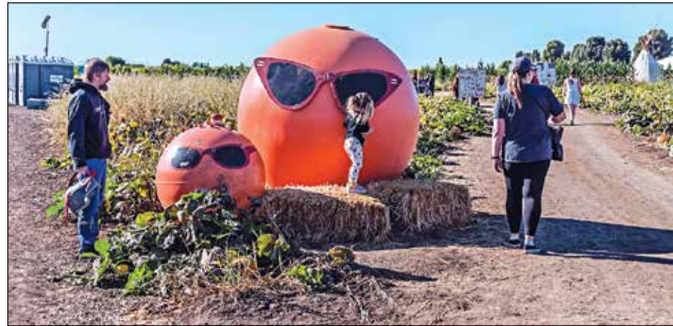
Cool Patch Pumpkins at 6150 Dixon Ave. W is 77-acres of seasonal activities, including a pumpkin patch, hay castle, rocking horses, teepees and much more.

For more information, visit the Dixon Calendar and Events Facebook page or call 707-678-8400. ★