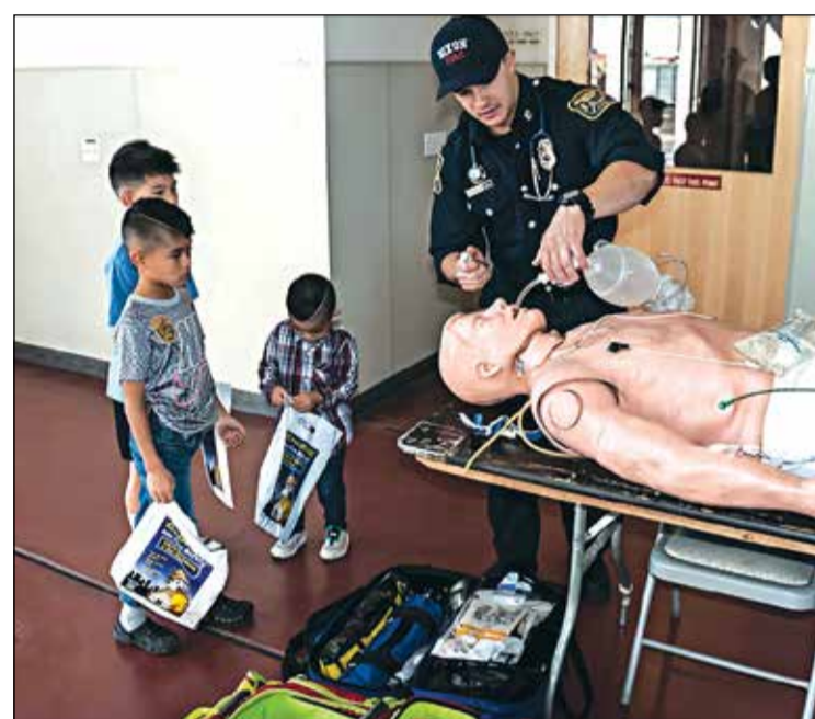
Throughout the day, firefighters demonstrated CPR techniques and allowed children to operate fire hoses, spraying targets under supervision. A smoke chamber and firehouse obstacle course were also available to give attendees a greater understanding of the challenging conditions first responders work through.