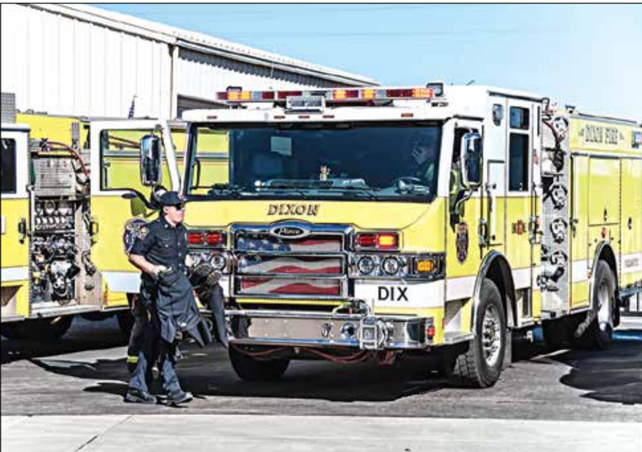
The Dixon Firefighters Charitable Fund is hosting a prawn feed from 5:30 p.m. to 11:30 p.m. Oct. 18. Held at Dixon Fire Station 81, 205 Ford Way, the event offers all-you-can-eat prawns, ravioli, salad and rolls for $70 per person.