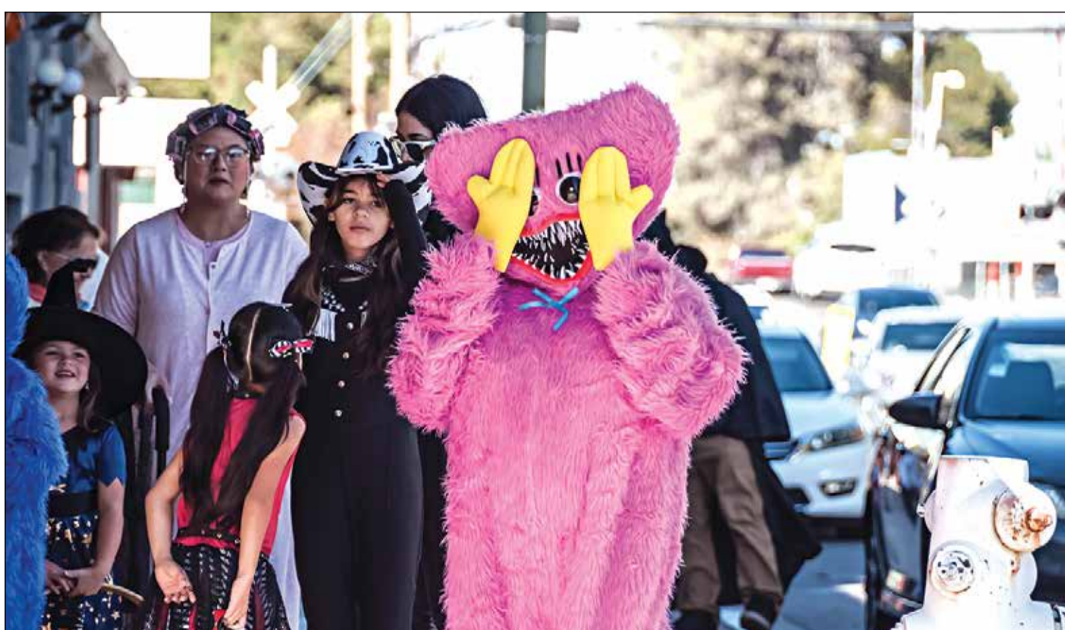
Downtown Dixon will host trick-or-treating on Halloween day, Oct. 31, from 1 to 4 p.m. Businesses will offer treats to children in costume. Concurrently, the Dixon Chamber of Commerce will host a Trunk or Treat event from 2 to 5 p.m. in the chamber's parking lot.

For those interested in painting, Lilly of the Arts will host a Pumpkin Paint Party from 1 to 3 p.m. Oct. 26. Held behind Uptown Collective, 115 E. A St., the two-hour session is open to all skill levels and includes supplies, guidance and refreshments. The event costs $30 plus a $3.85 service fee. Tickets are available at Eventbrite. For more