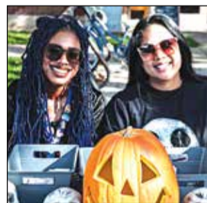
Dixon Public Library is offering a full schedule of youth and family-oriented events throughout October, including activities for children, teens and families.