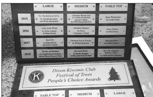
For more than 15 years, the Kiwanis Club of Dixon has offered a memory-making opportunity to children and families at the annual Festival of Trees, which will be on Dec. 13 this year.

Local businesses, clubs and organizations help by "sponsoring" trees that