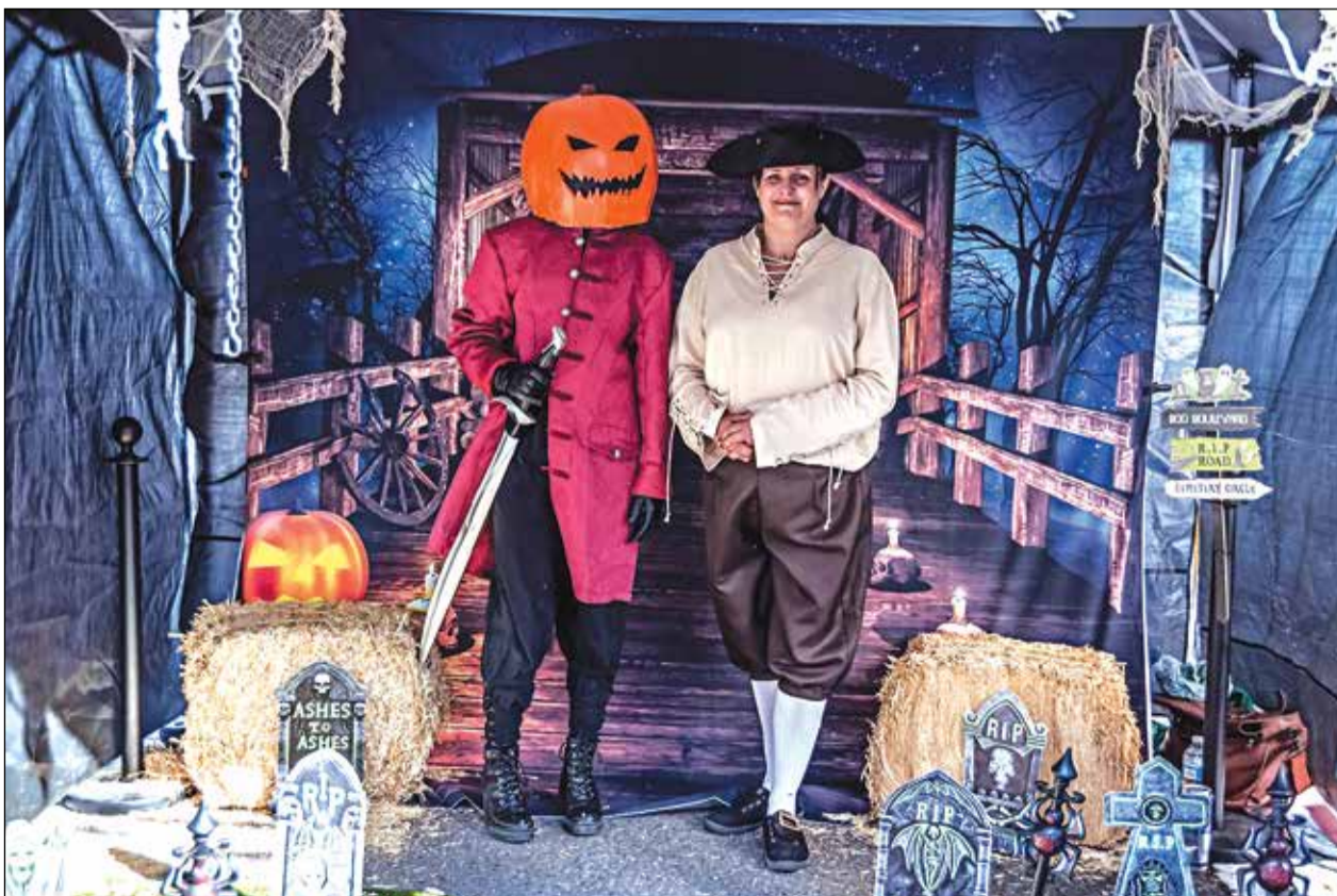
The Dixon Community Theater, in partnership with the Dixon Historical Society, will host Haunted History Walking Tours in downtown Dixon on Oct. 24 and 25. Tours are offered at 7 and 9 p.m. both nights for $20 per person.