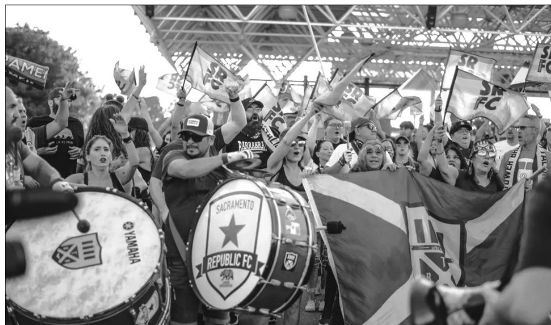
Republic FC's 2025 playoff campaign is sponsored by Sentivo Vineyards & Winery. The partners will team up for a variety of fan and community engagement opportunities throughout the postseason, including the club's Week of Service leading up to the Quarterfinal match on Nov. 2.

The general public on-sale tickets began Oct. 16 at SacRepublicFC.com and seats start at just $25. Season ticket members have priority access to purchase additional seats at a discounted price before any remaining seats are released to the public. To stay up to date on the latest playoff ticket news, supporters can text