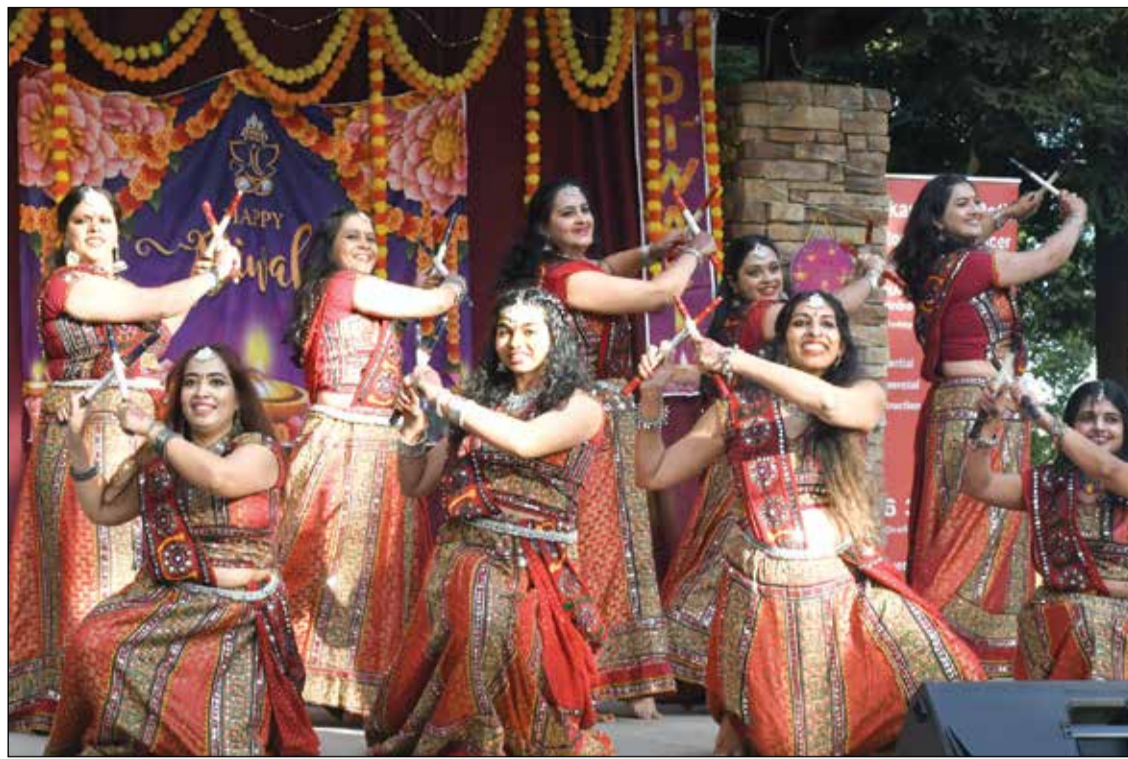
The event concluded as a shining example of teamwork and community spirit.

Assemblymember Josh Hoover delivered a meaningful message to the community, acknowledging California's formal recognition of Diwali as an official holiday, a milestone that reflects the growing cultural diversity and inclusion across the state. He emphasized that festivals such as Diwali not only celebrate tradition but also strengthen community bonds and promote shared values of light, hope and unity. To honor the efforts of Suvidha International Foundation in bringing the community together and preserving cultural heritage through large-scale, inclusive events, he presented a certificate of recognition from the California State Assembly. He congratulated the organization and its volunteers for their leadership in cultural engagement, youth empowerment and service initiatives in Rancho Cordova and beyond.