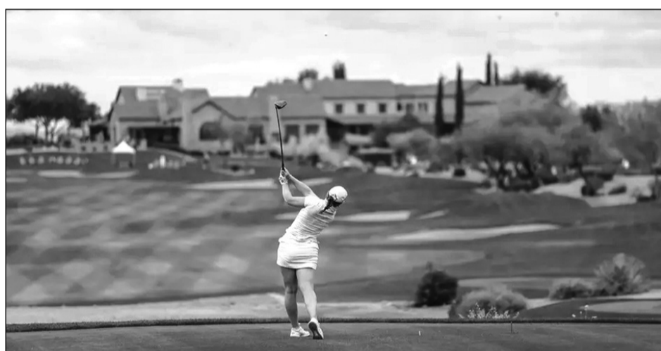
The Hornets finished tied for eighth place out of 19 teams in the tournament with scores of 284-285-301-870 at the Golf Iconic Classic on Oct. 15 at the New Mexico State University Golf Course. Boise State won the team title after finishing 13-under par.