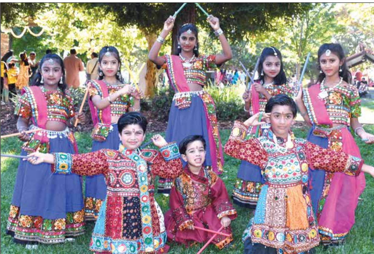
Stone Creek Park was transformed into a glowing celebration space with diyas, candles, colorful LED lights, photo booths, decorative banners, and festive hangings, while trees throughout the park sparkled with LED lights, creating a magical setting.

By Bhaskar Vempati – Suvidha International Foundation