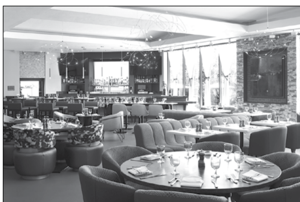
Facilitating weddings, San Juan Soccer Club gatherings, as well as an array of tradeshow, the general manager said that the hotel's restaurant, the Formaggio Restaurant and Bar, has also been fully updated, including the outdoor patio and terrace.