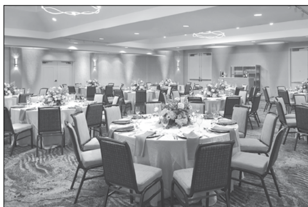
Approximately 13,000 square-feet of meeting and banquet space feature catering options to accommodate an array of gatherings and 1GIG wireless high-speed internet is available in meeting or breakout rooms, in addition to public areas.

Garcia said that the Marriott is the tallest building in Rancho Cordova,