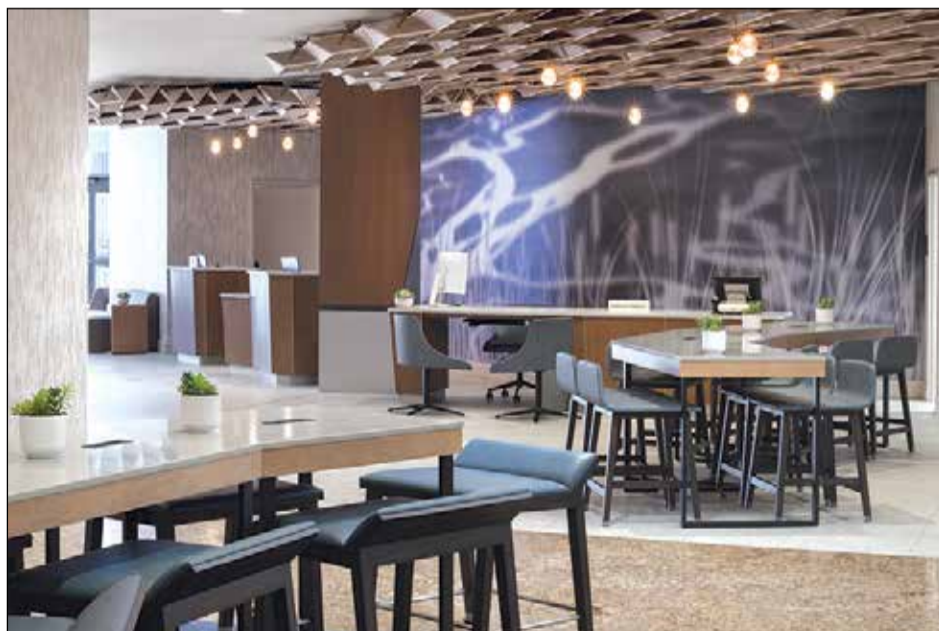
An open lobby concept features multiple communal seating areas and plugs, as well as all throughout the hotel.

Facilitating weddings, San Juan Soccer Club gatherings, as well as an array of tradeshow, the general manager said that the hotel's restaurant, the Formaggio Restaurant and