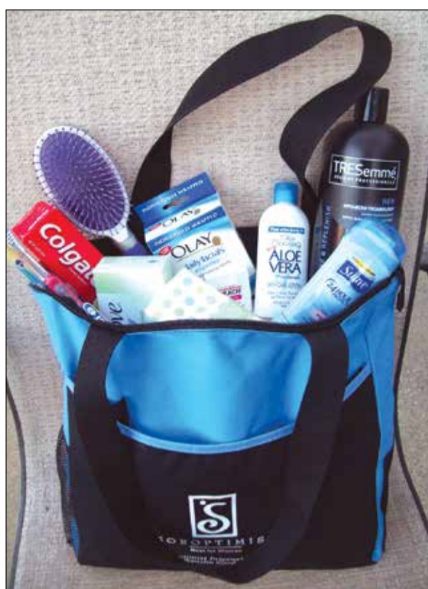
Soroptimist is an international nonprofit organization that seeks to improve the lives of women and girls through programs leading to social and economic empowerment.

Domestic violence shows itself in several different forms, whether it is punching, slapping, choking or threatening, manipulating, yelling and many others. No matter the situation,