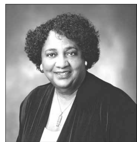
Pictured is California Secretary of State Shirley N. Weber, Ph.D.