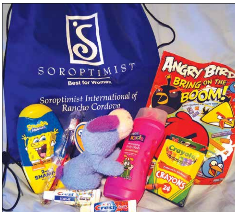
Soroptimist International of Rancho Cordova and Gold River helps survivors reclaim their lives by providing Comfort Kits to survivors and their children and by giving cash awards to head of household women, called the Live Your Dream award, who have overcome challenges to help survivors complete higher education.