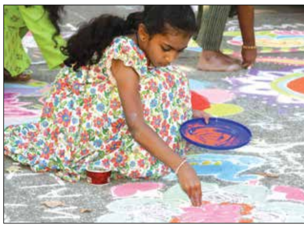
Reflecting this spirit, the celebration welcomed families from diverse cultural backgrounds, with Suvidha International Foundation greeting attendees with traditional sweets to mark a warm and festive beginning.

celebrated globally by Hindu, Jain, Sikh and Buddhist communities, symbolizes the triumph of light over darkness and the power of unity over division. Reflecting this spirit, the celebration welcomed families from diverse cultural backgrounds, with