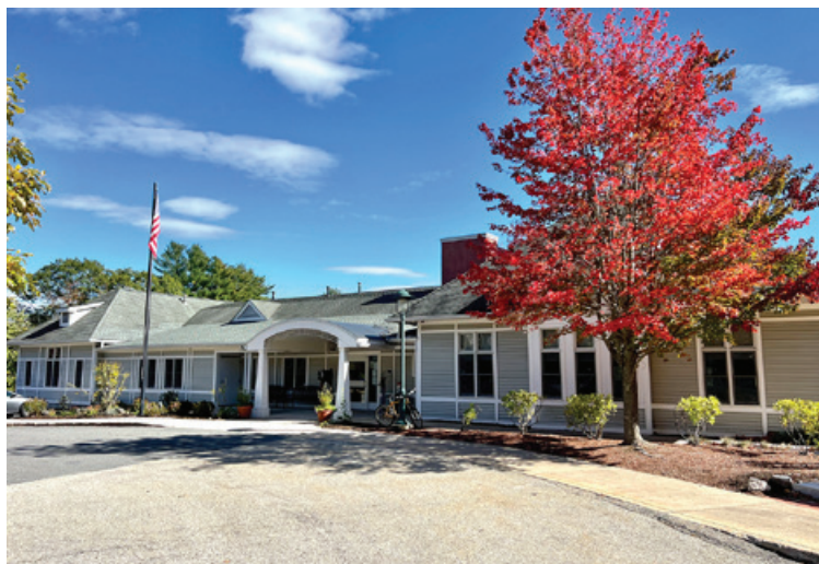
Ashland Community Center.

Craft Class – Second Tuesday at 9 a.m. and third Friday of the month at 10 a.m.