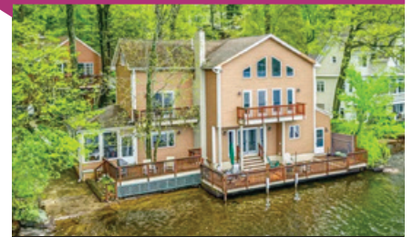
28 Downey Street Hopkinton