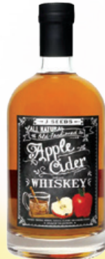
J. Seeds Whiskey 750ml $19.99