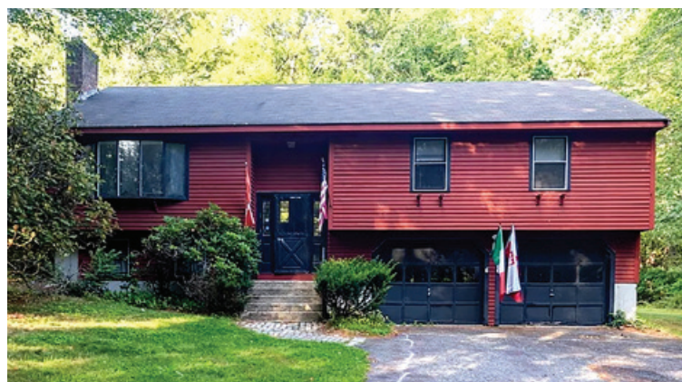
The 3-bed, 2-bath, 1,988-square-foot home at 28 Kings Row in Ashland recently sold for $590,000.

Sponsored articles are submitted by our advertisers. The advertiser is solely responsible for the content of this article.