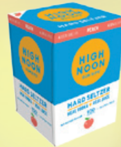
High Noon RTD All Flavors 4 pack $11.99