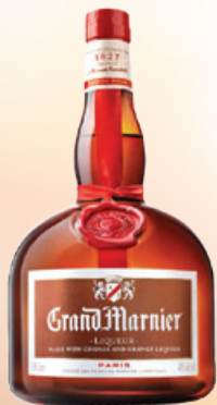
Grand Marnier Liqueur 750ml $39.99