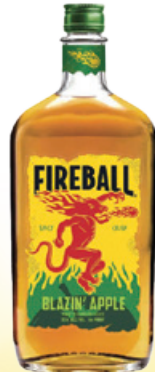
Fireball Whiskey 750ml $18.99