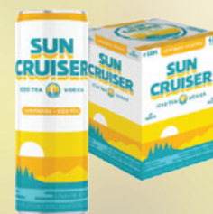
Sun Cruiser RTD All Flavors 4 pack $11.99