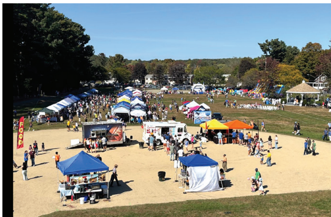
Aerial view of Ashland Day event.