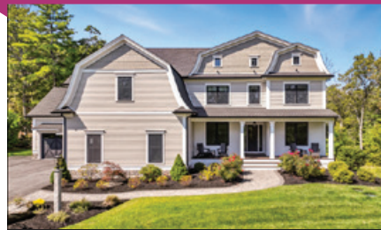
2 Whisper Way Hopkinton