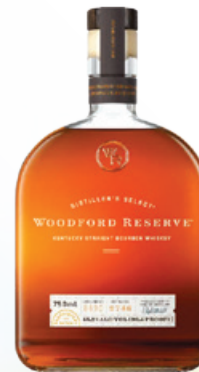
Woodford Reserve Bourbon 750ml $37.99