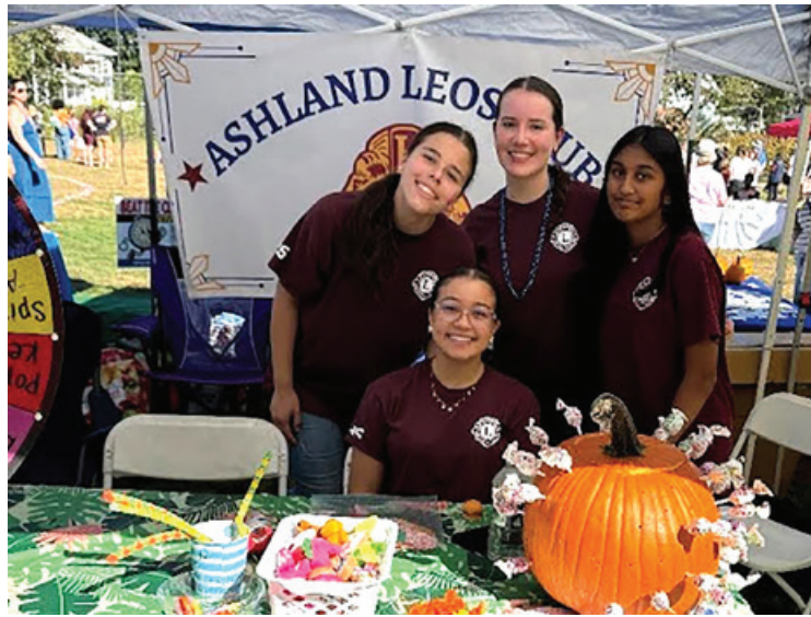
Leos raise funds for Ashland Emergency Fund at Ashland Day 2025.

It's hard to believe that Thanksgiving is only a month away. But do you know what opens the day after Thanksgiving? The Lions Christmas Tree lot! This will be our third year selling trees at our new location - the Ashland Farmers Market on Front Street! We'll have lots more surprises in store this year as well. Please consider buying your fresh Christmas tree from the Ashland Lions this year and donate to a great cause. Cash, credit cards and Venmo are accepted. Remember, Lions give back 100% of fundraising to eye research and the local community. Hope to see you soon!