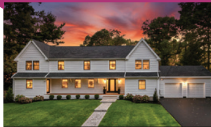
165 Lumber Street Hopkinton