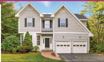
3 Candlewood Lane Southborough