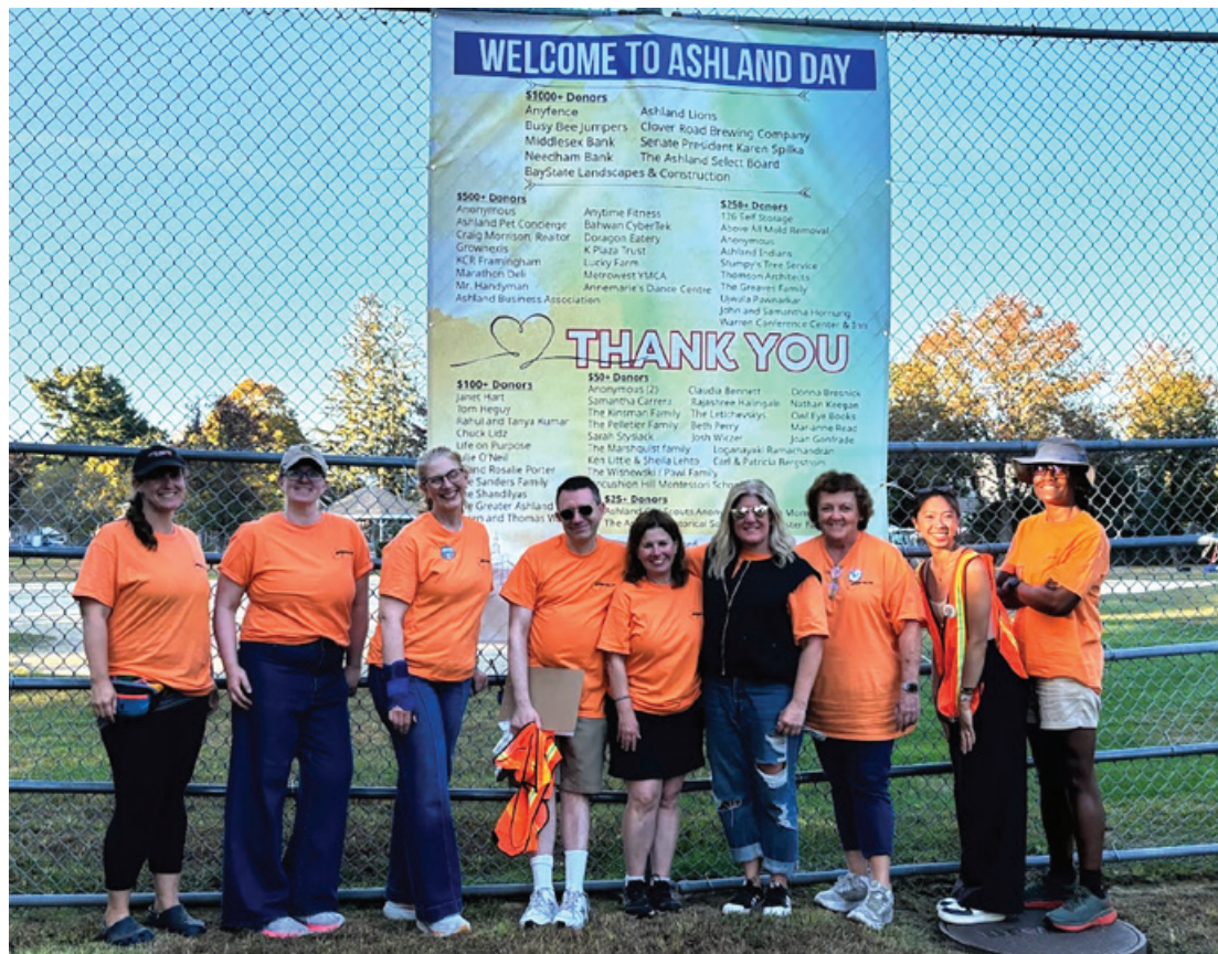
Committee and some of the volunteers in front of sponsor banner.