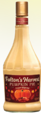
Fulton's Harvest Pumpkin 750ml $10.99