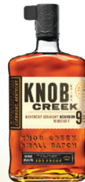
Knob Creek Bourbon 750ml $34.99