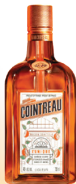
Cointreau Liqueur 750ml $34.99