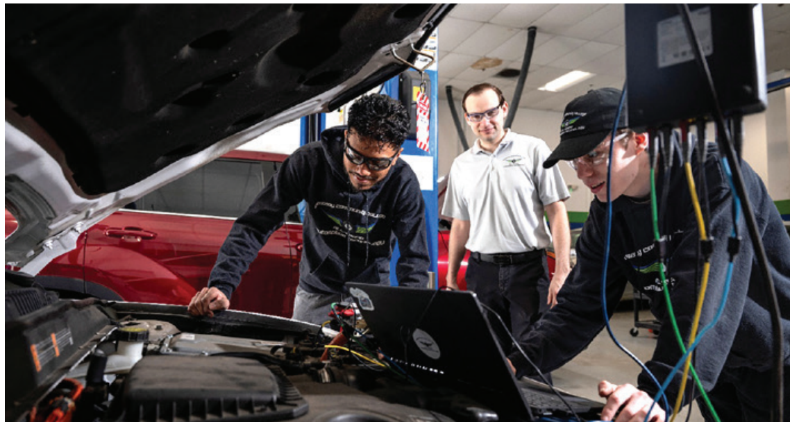
MassBay Community College Automotive Technology All Brand students work in the automotive labs, Ashland, MA, April 2024.

MassBay's Auto Technology is the premier automotive training center in the New England region, offering programs that