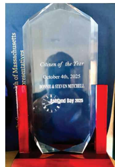
Citizens of the Year trophy.