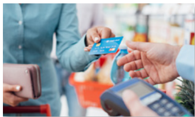
Take advantage of retail sales