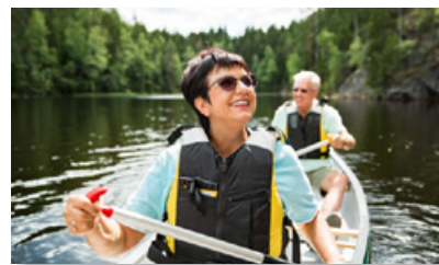
Secure your weekend spending