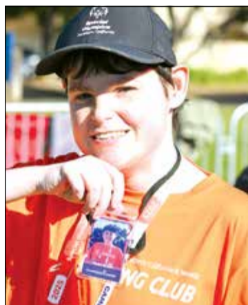
Athletes had the opportunity to have their own trading card made, displaying certain "stats" about the athletes, such as their favorite sport or food. The collectible trading cards are a courtesy from one of the event's sponsors, New York Life.