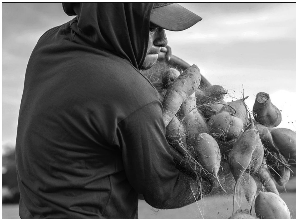
California farms are expected to lose a total of about $1.3 billion per year to natural disasters, an average per-farm loss of $20,528, according to Trace One analysis of Federal Emergency Management Agency data. The worst type of natural hazard for California's agriculture is drought, which can reduce irrigation, shrink harvests and put extra strain on livestock.

The increased frequency of natural hazards has created a challenging environment for farmers. However, the effects of climate- and weather-related disasters are not uniform, varying greatly depending on location. To pinpoint where these events are having the greatest impact on farmers and the nation's food supply, Trace One researchers conducted an in-depth analysis of the latest data from the U.S. Department of Agriculture and the Federal Emergency Management Agency (FEMA).