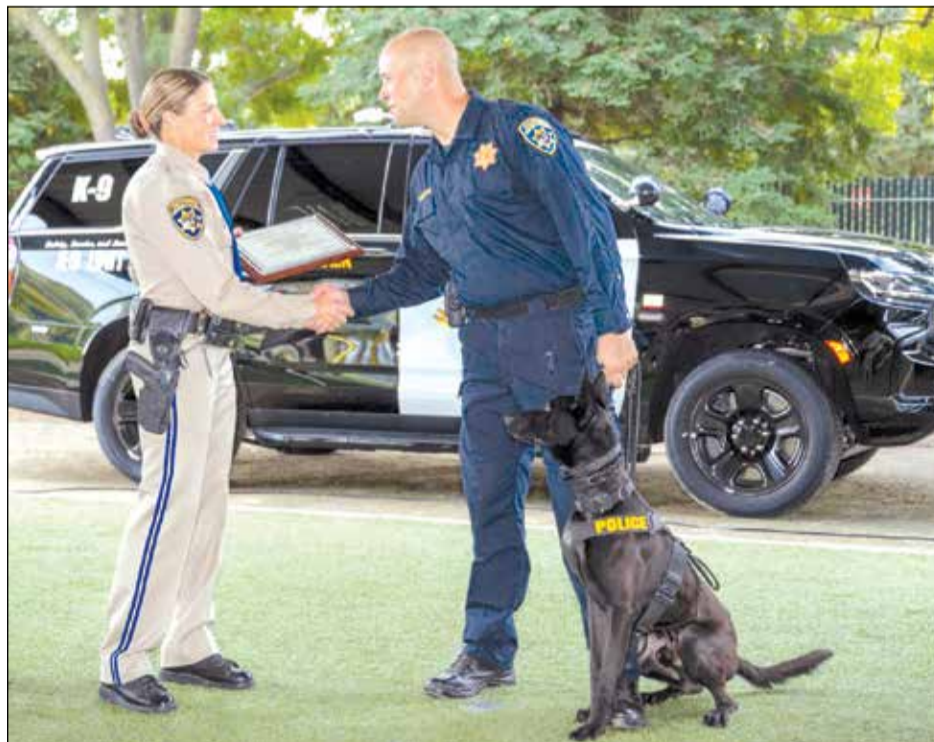
With this graduating class, the second of 2025, the CHP now deploys 53 K-9 teams statewide, including 37 Patrol and Narcotics Detection Canine teams, nine Patrol and Explosives Detection Canine teams, five Explosives Detection Canine teams and two Narcotics Detection teams.

Over the past 11 weeks, the four K-9 teams completed more than 400 hours of intensive training that met the standards set by