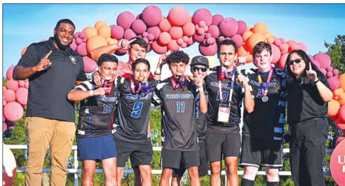
Special Olympic athletes pose with their medals at the end of the 2025 Fall Games at Russel Field in Davis at the UC Davis Campus on Nov. 8.

The second annual Guardian Games fundraiser features activities such as putting greens, rubber axe throwing, cornhole and other game stations for a unifying event, meaning people with and without intellectual disabilities can compete together. The Guardian Games fundraiser seeks to raise $75,000, currently raising more than $46,000 as of press time.