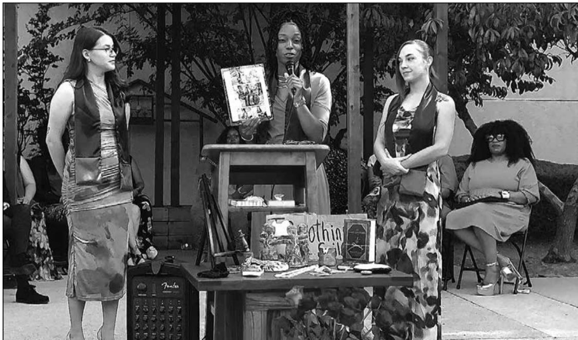
The Kelly Foundation envisions a Greater Sacramento region where everyone has a chance to live in a safe and affordable home; access to meaningful work, a sustainable environment, healthy food, and quality education; and where each person's ability to thrive is connected to the well-being of the community.

Grant funds will support Women's Empowerment's quarterly two-month program where each woman works one-on-one with a social worker, housing specialist and employment specialist. She attends classes and