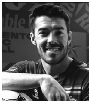
With the regular season campaign in the rearview mirror, Republic FC now turns its attention to the USL Championship Playoffs.

In front of goal, Desmond added his second goal contribution of