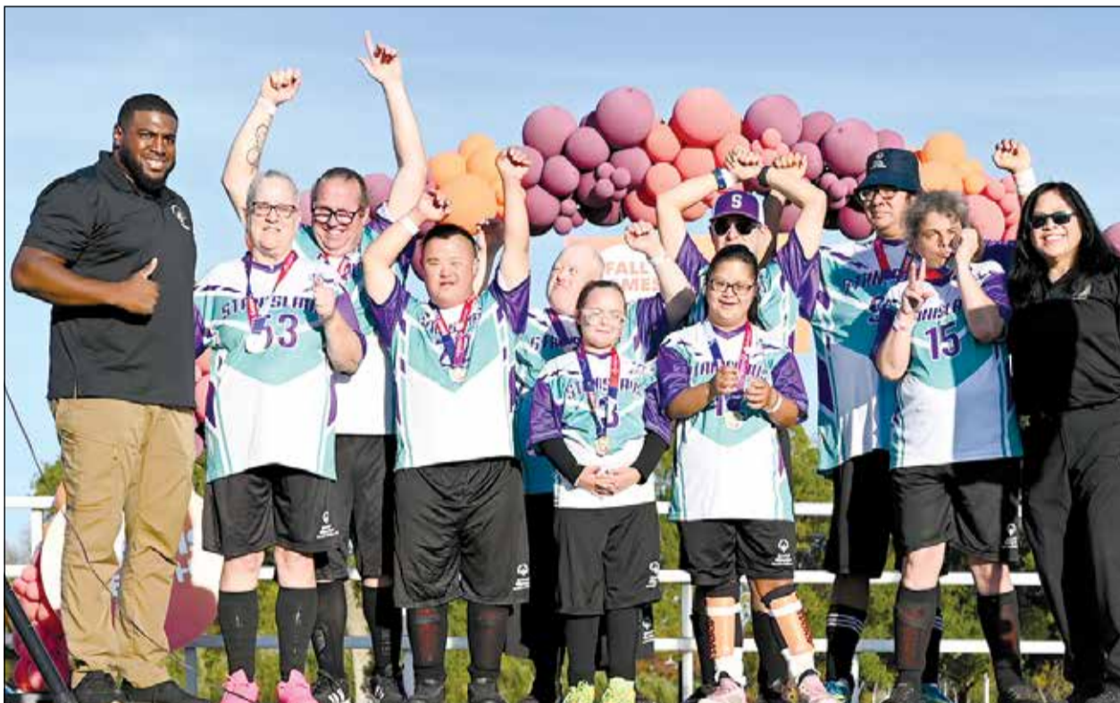
Special Olympic athletes pose with their medals at the end of the 2025 Fall Games at Russel Field in Davis at the UC Davis Campus on Nov. 8.

Special Olympics at UC Davis' Russell Field Hosts Hundreds of NorCal Athletes