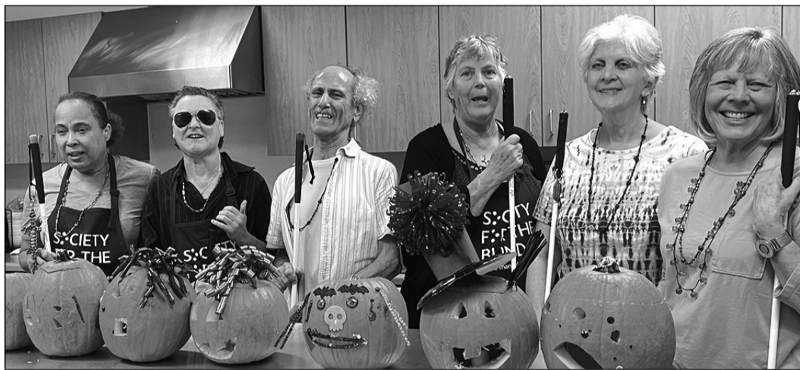
Society for the Blind's senior program members learned how to carve pumpkins without vision last October during Blindness Awareness Month.