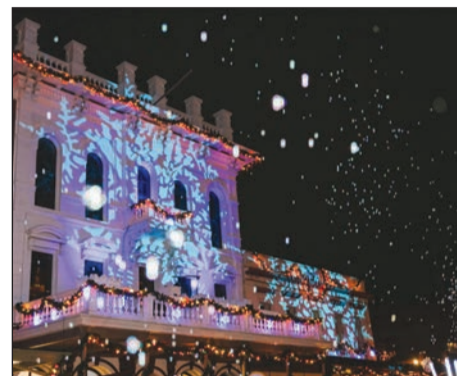
In addition to the Old Sacramento Waterfront holiday tree, every building in the district will be adorned with garland and lights, street poles will sport red bows and storefronts will have their own decorations.

the district's shops, restaurants and attractions while collecting stickers for the bingo card. Completed cards can be entered for a chance to win a family four-pack of tickets to The Polar Express Train Ride in 2026, along with other festive prizes.