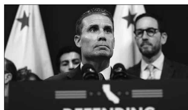
Senate President Pro Tem Mike McGuire speaks during a press conference before Gov. Gavin Newsom signs the Election Rigging Response Act at the Capitol Annex Swing Space in Sacramento on Aug. 21.

know these towns," McGuire says as he strolls down a tree-lined country road, a white pickup truck clearly visible in the background. "This district is big, it's rural, and now more than ever, it needs a fighter."