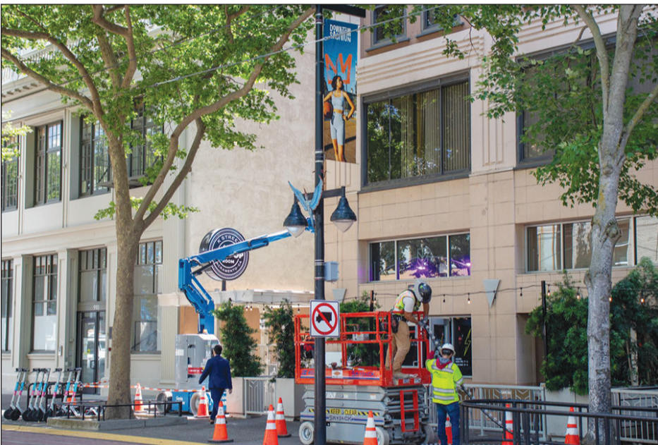
Above and right: New LED lights have been installed along K Street to promote evening pedestrian activity and safety.