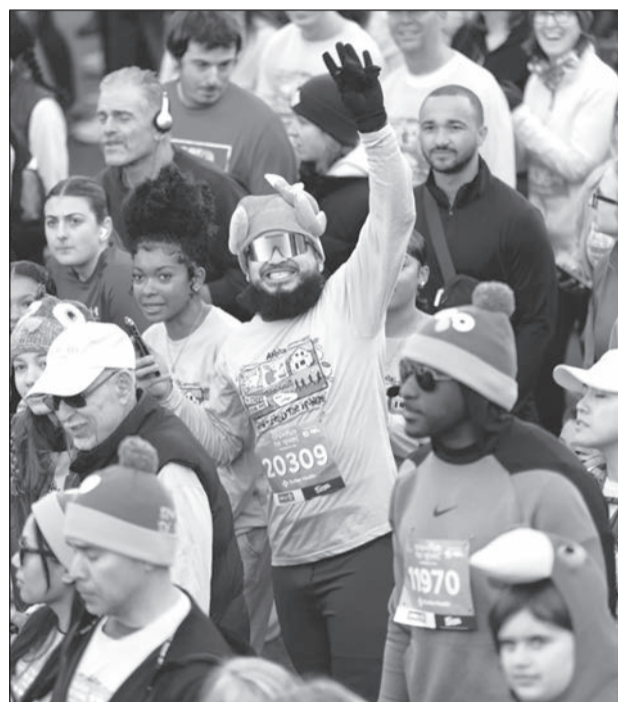
With Thanksgiving Day approaching on Nov. 27, several events and activities across the Sacramento area are offering residents a chance to give back, share a meal or simply enjoy time together.

will include food, music from DJ NADZ and plenty of time to share stories and make memories with friends. Register for the event at bit.ly/4i1Zrm7 (case sensitive).