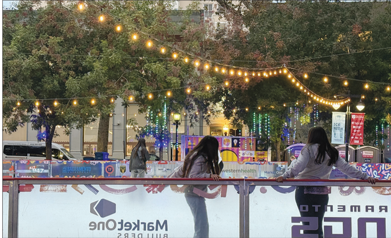
The Downtown Sacramento Ice Rink, presented by Dignity Health, is now open through Jan. 19.