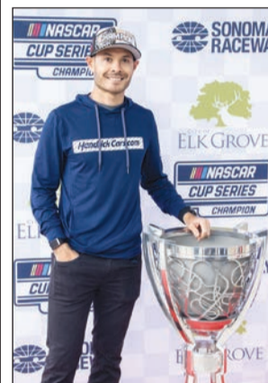
Pictured is Elk Grove native and professional racing driver Kyle Larson with his 2025 NASCAR Cup Series Champion Driver trophy.