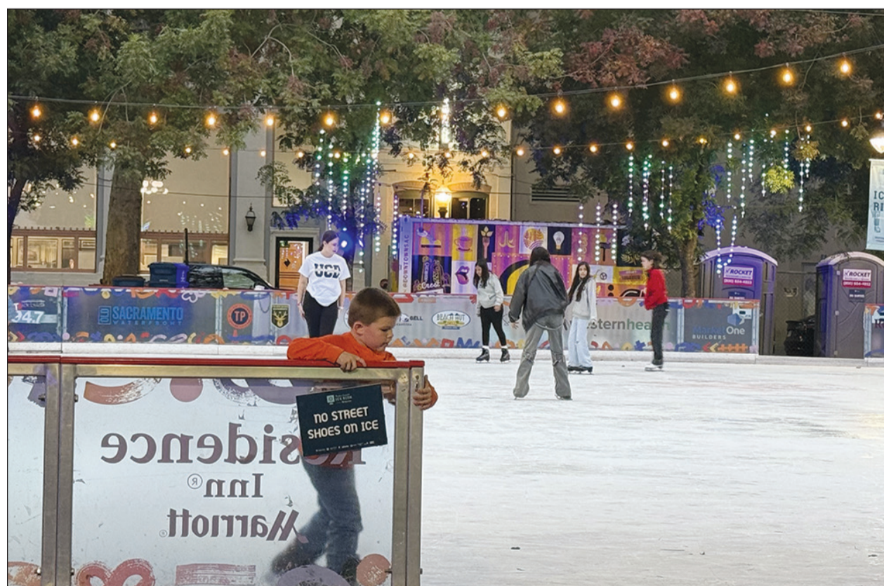
Skaters at the Downtown Sacramento Ice Rink on Nov. 12 exhibited all skill levels, from pro skaters showing off impressive spins, to children aided by skating walkers.