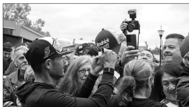
Kyle Larson signs Hendrick Cars merchandise for a fan at Old Town Plaza on Nov. 14.