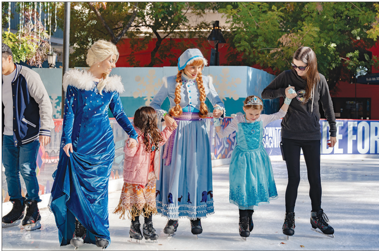
Skaters at last year’s Princess & Superhero Day were joined by characters including Disney princesses Anna and Elsa. This year’s event took place Nov. 15.