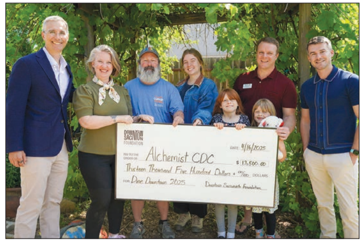
Nonprofit applications are being accepted now through Nov. 23 to partner with Downtown Sacramento Partnership and its sister organization, Downtown Sacramento Foundation, for the city's annual restaurant week that helps to enhance the downtown experience.