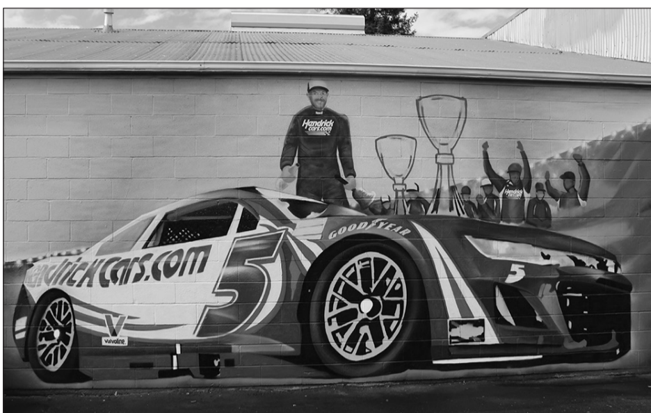
Wide Open Walls created a Kyle Larson mural at The Sign Center on Elk Grove Boulevard.