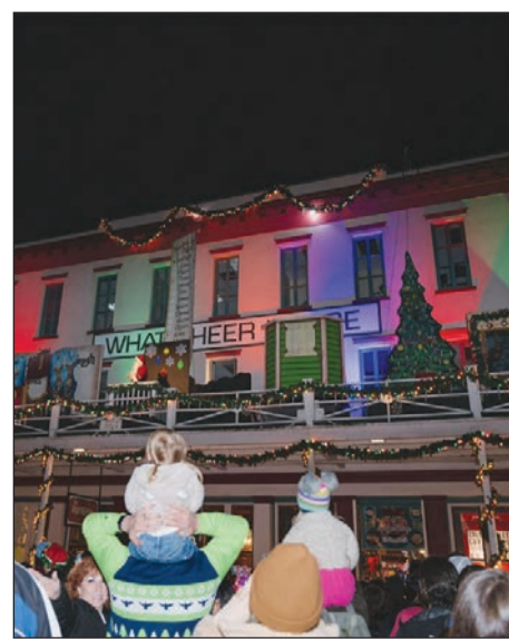
Theatre of Lights is a free, immersive performance retelling of "Twas the Night Before Christmas" in a uniquely Sacramento way on the balconies of Old Sacramento Waterfront.

The district is home to over 150 small businesses, each ready to help shoppers find the perfect holiday gift. This year, visitors can support local merchants in a new way with the Old Sacramento Waterfront Holiday Bingo Card. Guests can explore