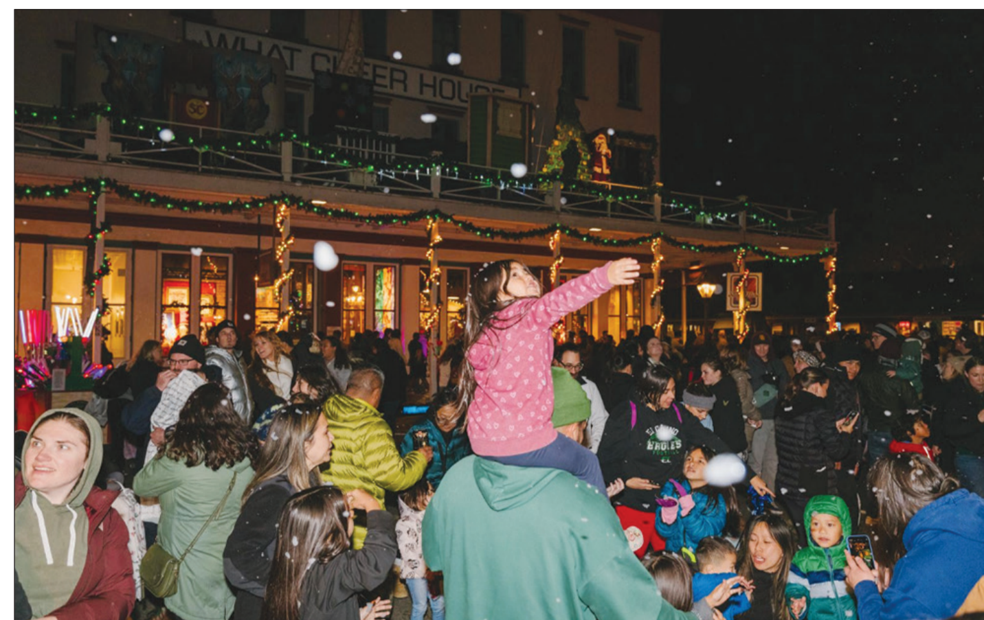
The historic Old Sacramento Waterfront district transforms into a holiday destination filled with shows, shopping and seasonal surprises.