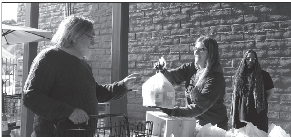
Those looking to help can contribute to the cause by donating at rivercityfoodbank.givingfuel.com/donate , helping ensure more families have a Thanksgiving meal to enjoy this season.

Those looking to help can donate at rivercity-foodbank.givingfuel.com/donate , helping ensure