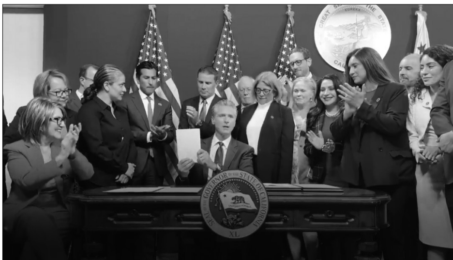
Gov. Newsom signs ACA 8, redistricting on ballot.

The AP reports: "The Trump administration accuses California of racial gerrymandering in violation of the Constitution by using race as a factor to favor Hispanic voters with the new map. It asks a judge to prohibit California from using the new map in any future elections." (Last) week, The Globe reported that the