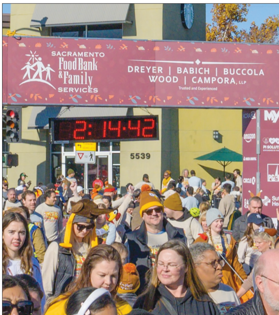
Celebrate Thanksgiving by participating in a morning run, walk or jog at the 32nd annual Run to Feed the Hungry 5K or 10K.