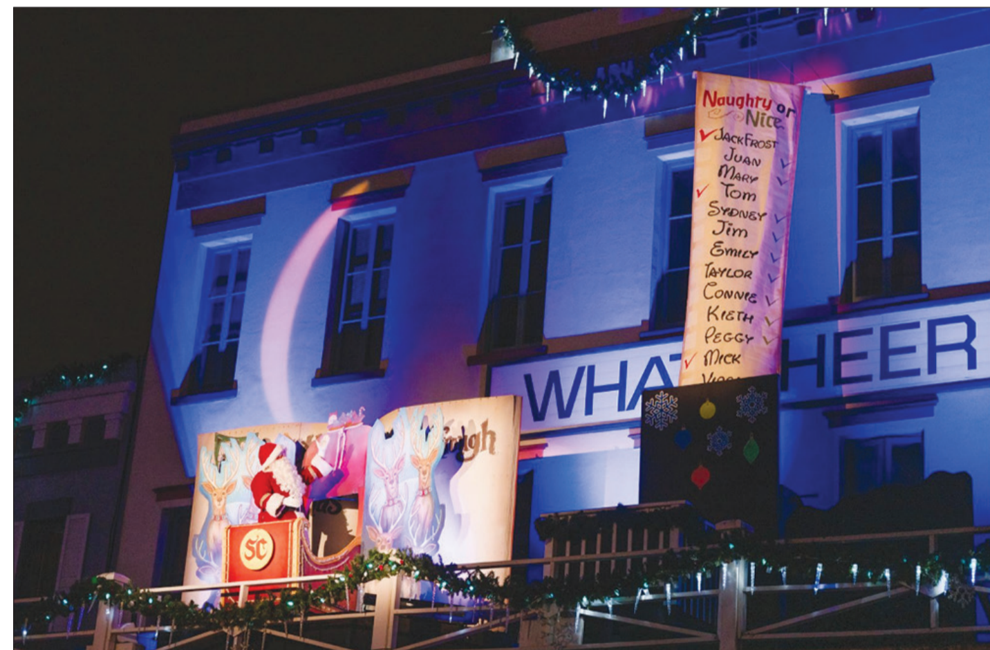
This free, family-friendly light show transforms the balconies of Old Sacramento Waterfront into a live holiday stage, blending a retelling of "Twas the Night Before Christmas" with stories from Sacramento's history.

For more information about Old Sacramento Waterfront, visit oldsacramento.com . ★