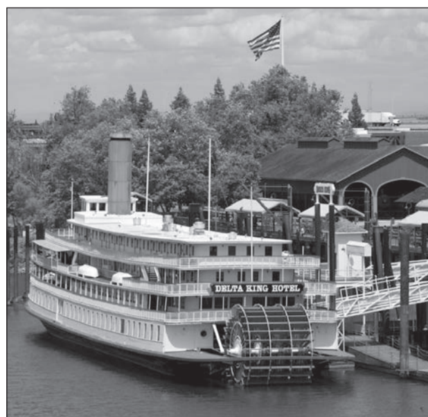
Those wanting a festive dining experience with a view can celebrate Thanksgiving aboard the historic Delta King Riverboat, 1000 Front St., from noon to 6 p.m. Nov. 27.

For a more casual celebration, Crawdads on the River will host its 10th annual Friendsgiving event at 5 p.m. Wednesday, Nov. 26 at 1375 Garden Highway. The evening