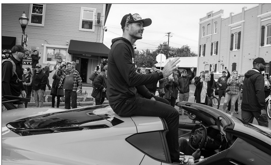
Elk Grove celebrated hometown racing hero Kyle Larson with a parade on Nov. 14, celebrating his most recent NASCAR Cup Series Championship win.

Larson is not just a hero for NASCAR fans, but a hero for the entire community of Elk Grove. Winning at the highest level possible yet still managing to come back to the community he grew up in to celebrate, he provides hope to the younger generation, showing that they can turn their dreams into reality. ★