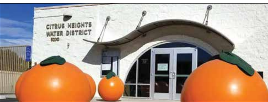
Pictured is the Citrus Heights Water District building, 6230 Sylvan Road, Citrus Heights.