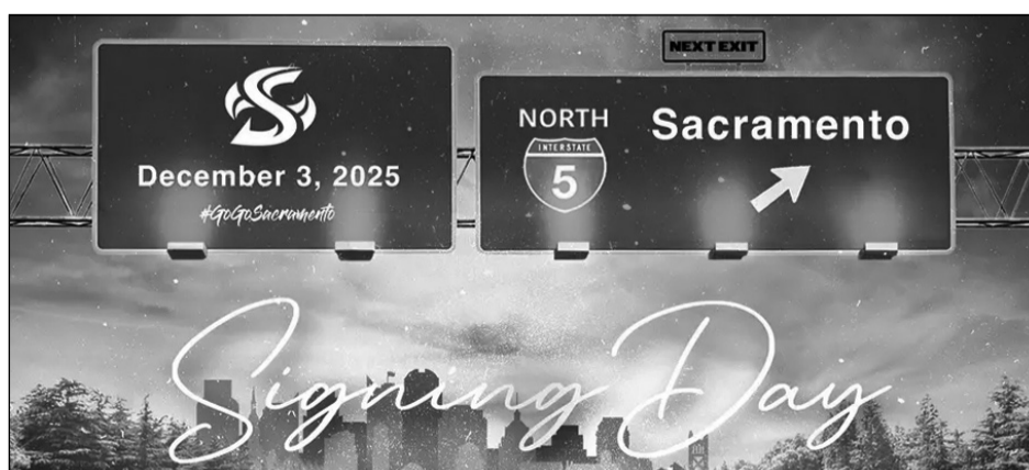
Eleven high school seniors were signed to the Sacramento State football team Dec. 3 during the early signing period's first day. Seven of the 11 players are from California.