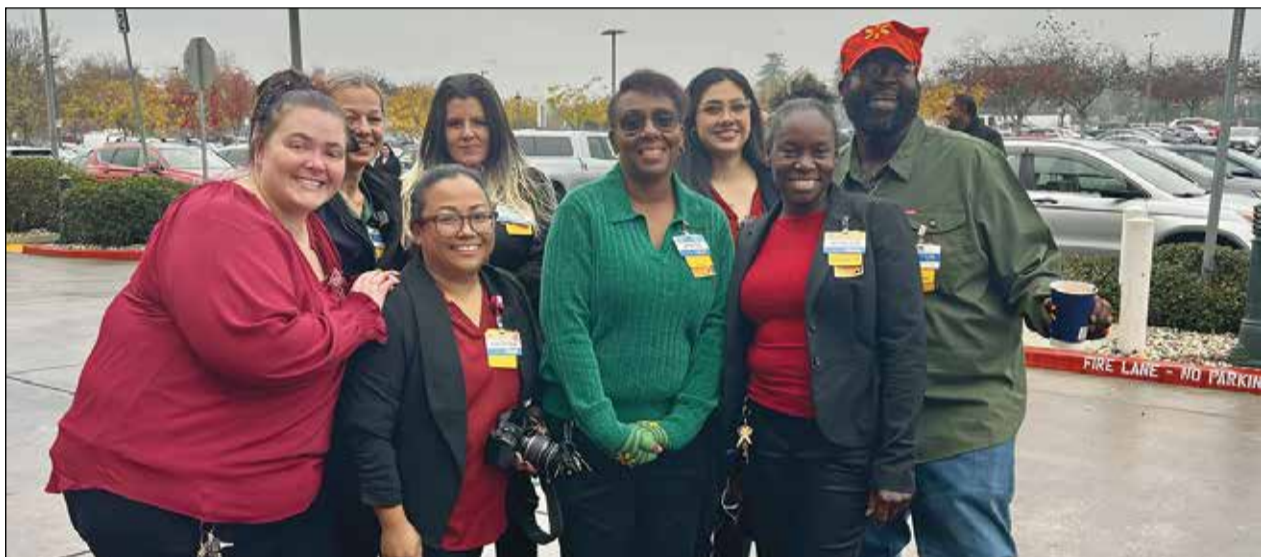
Walmart representatives and employees attended the reopening of the store Dec. 5.