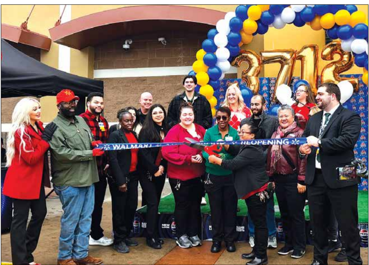
The Walmart at 7010 Auburn Blvd. marked its grand reopening Dec. 5 with a morning of ceremonies, community presentations and ribbon cutting hosted in partnership with the Citrus Heights Chamber of Commerce.