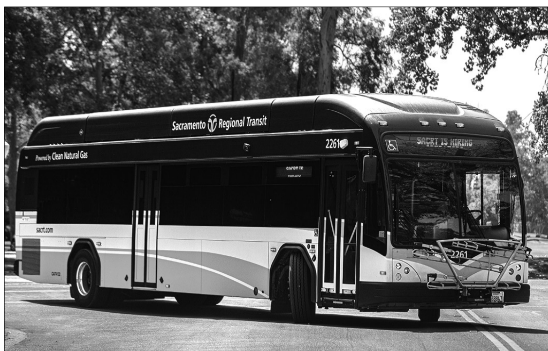
Federal Transit Administration funding will support replacing 49 Sacramento Regional Transit aging buses with modern, low-emission vehicles and fund infrastructure upgrades that will improve service reliability, reduce emissions and enhance transit access in underserved communities.

A 2021 redesign enables the facility to house and maintain up to 270 buses, including the 49 new compressed natural gas buses funded through this grant and future clean-fuel vehicles. Together, these investments in