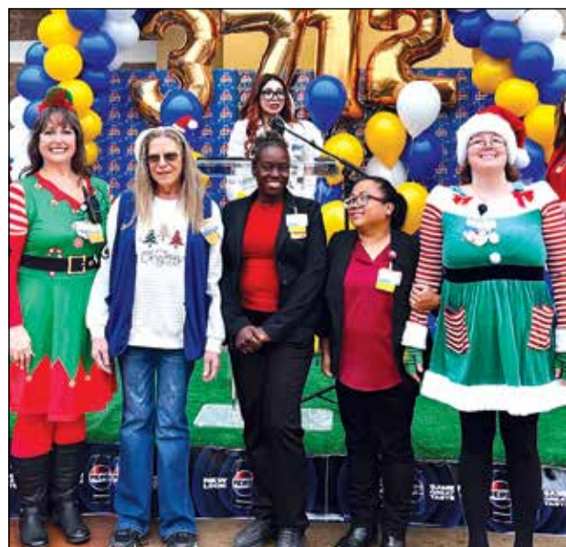
Several Walmart employees were recognized at the grand reopening on Dec 5, highlighting their contributions to the project.