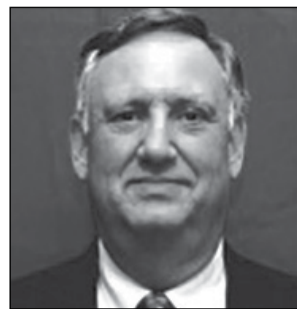
By Dan Walters, CALMatters.org

The California Legislature has a bad habit of writing new law in the moment and paying little or no attention to its potential consequences.