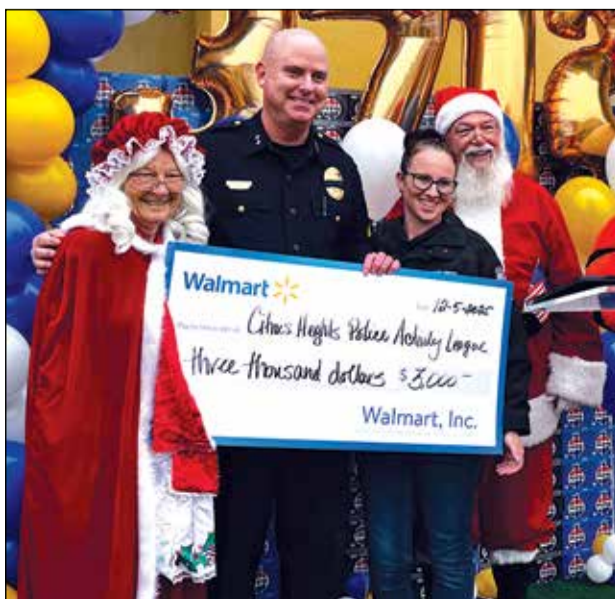
The Citrus Heights Police Activities League received a $3,000 donation accepted by Citrus Heights Police Department Commander Kris Frey.