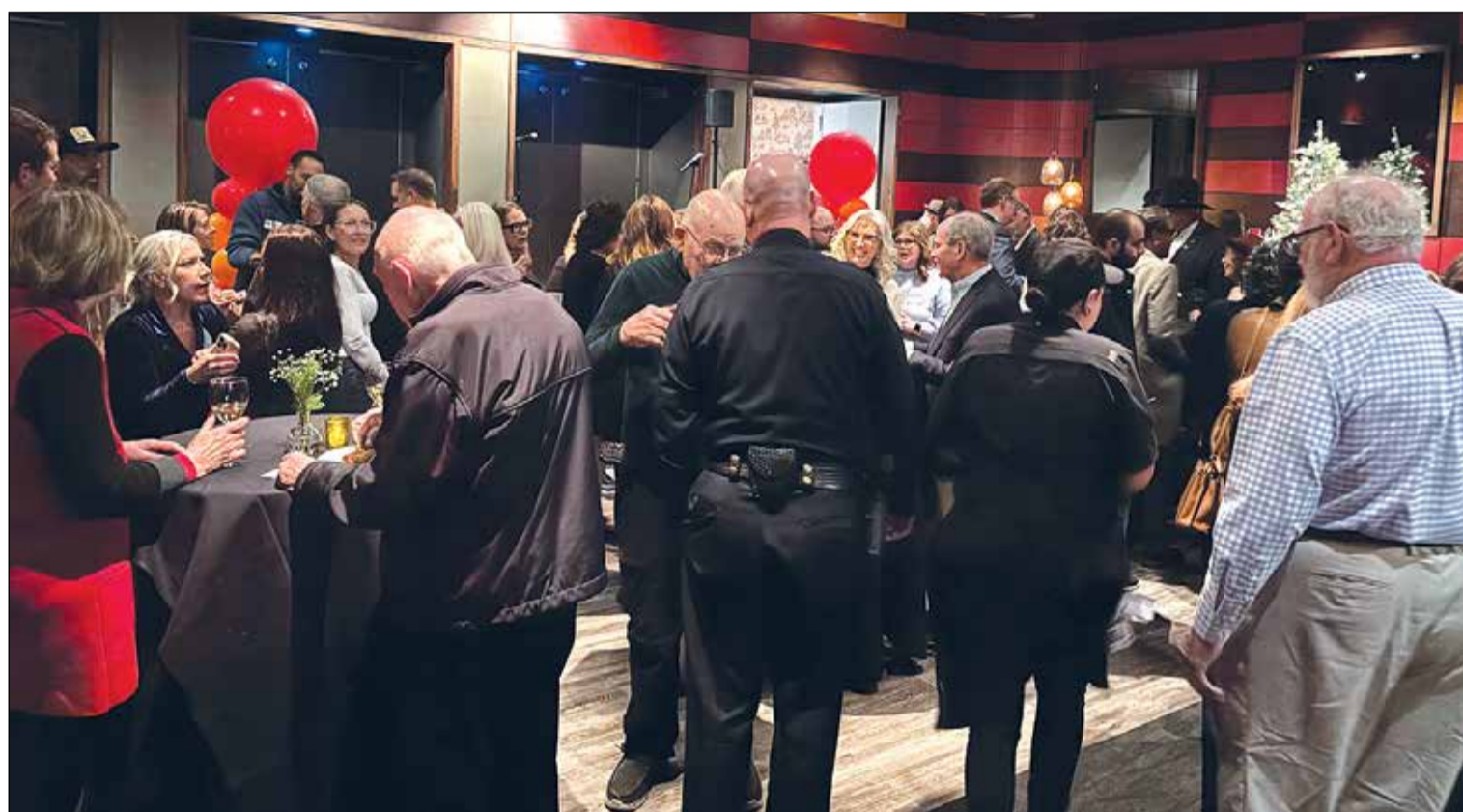
The 2025 Stones Gambling Hall "21" Award ceremony had a large turnout, with members of the Citrus Heights City Council, county and state representatives present.