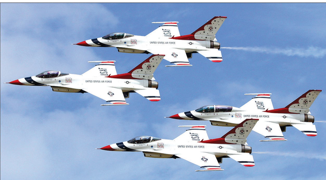
California Capital Airshow crowds are always dazzled by the Thunderbirds' performances. The U.S. Air Force Thunderbirds return next year to the highly-anticipated airshow.