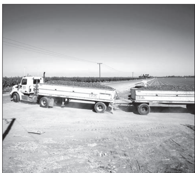
Truckloads of tomatoes are transported through traffic and higher temperatures with minimal losses, research shows.

was when cool temperatures coincided with heavy traffic. The worst-case scenario was hot temperatures combined with heavy traffic. When it's hot, slow traffic speeds cause trucks to spend more time at damaging temperatures.