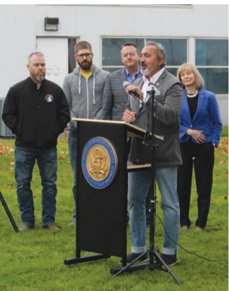
“It’s incredibly important that we have well trained aircraft controllers keeping us safe and confident in the skies,” Rep. Ami Bera said.