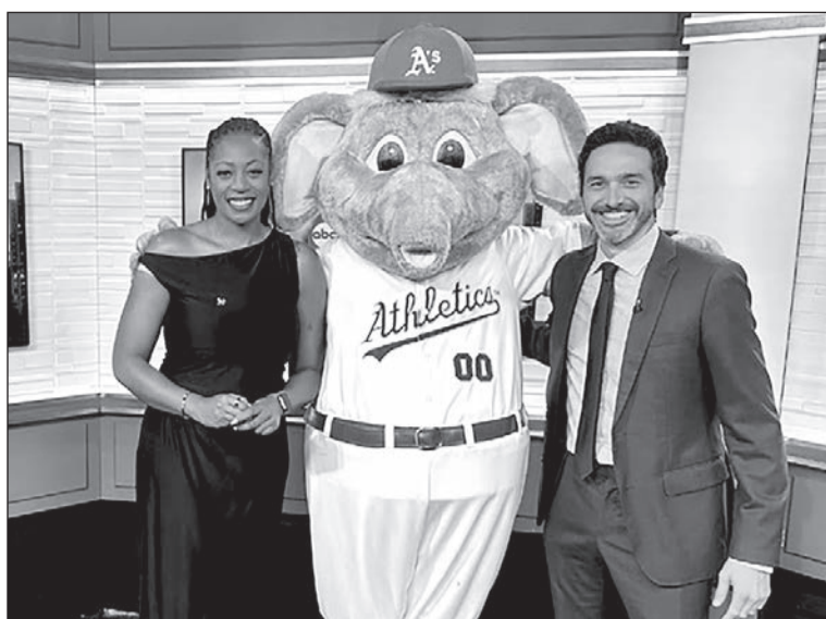
Stomper participated in ABC10’s Stand Against Hunger fundraiser, donating $50,000 to the cause.