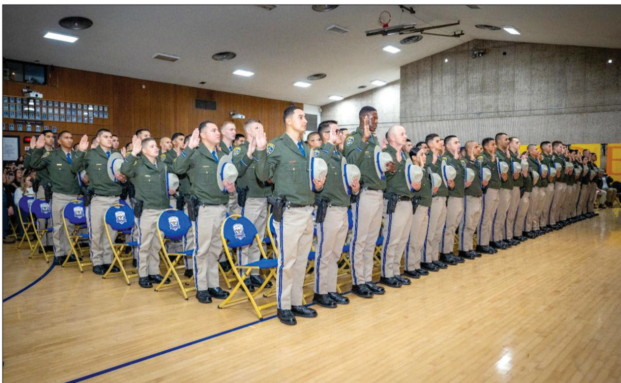
Before family and loved ones, the cadets took their oath and received their badges, officially joining one of the nation's largest law enforcement agencies.