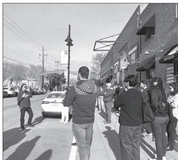
Planning Academy classes will take place on Monday evenings and be a mix of in-person and virtual sessions, plus two Saturday field trips.

If you have questions about the City of Sacramento Planning Academy, email planningacademy@cityofsacramento.org . ★