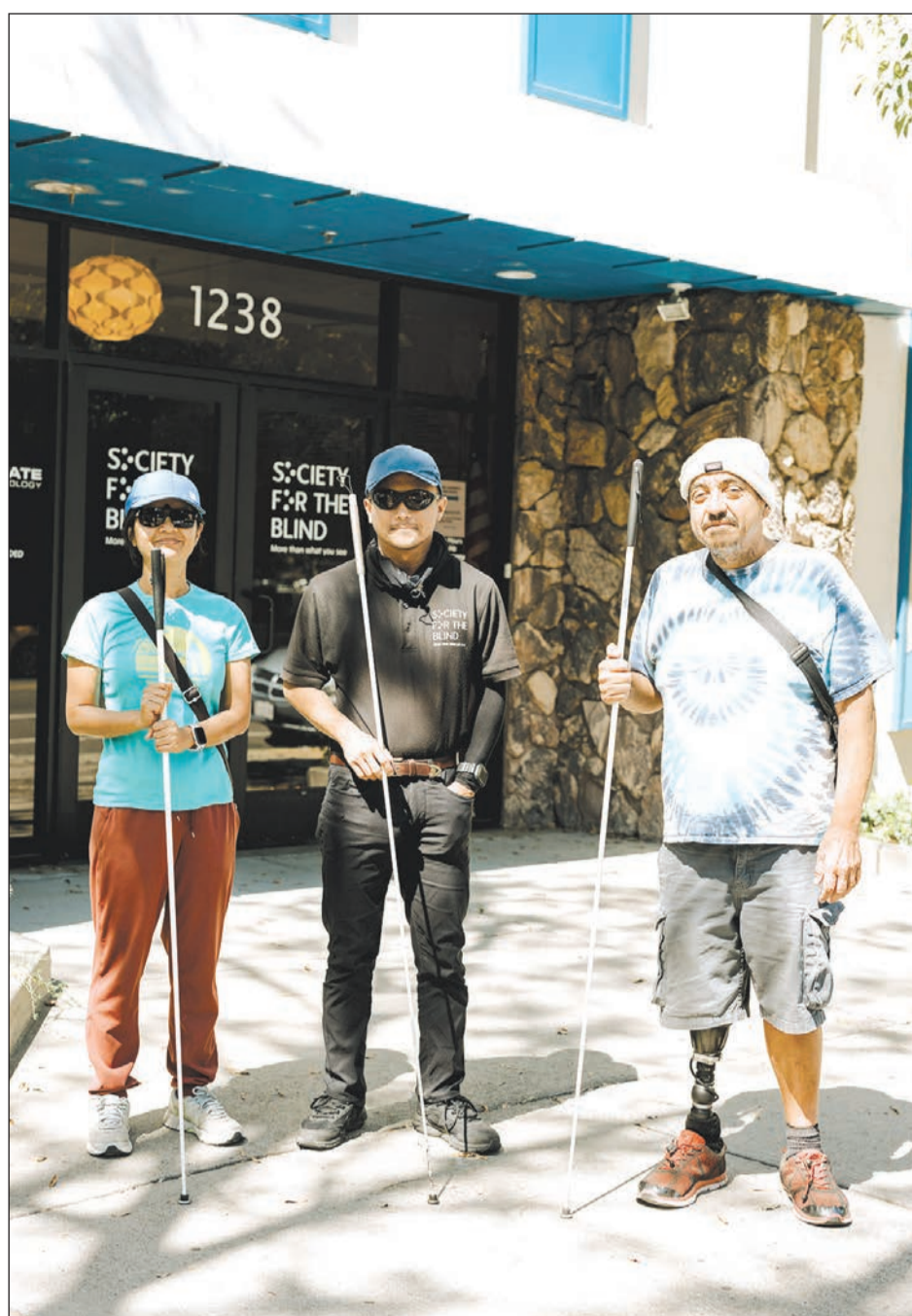
Society for the Blind clients practice their orientation and mobility skills with white canes. The nonprofit organization recently received a grant from the Maximus Foundation.

Learn more or donate: www.SocietyfortheBlind.org ★