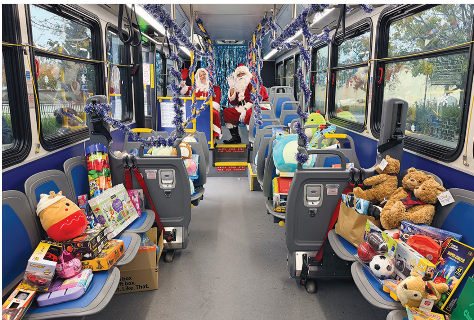
Santa and Mrs. Claus pose on the SacRT holiday bus filled with donated gifts for children, teens and foster youth served by Stanford Sierra Youth & Families.

Bus continues to operate fare-free through Jan. 2, rotating to a different route each day. Riders can still support Stanford Sierra Youth & Families by donating onboard or scanning a QR code to give online. Visit sacrt.com/HolidayBus for the full schedule and gift wish list.