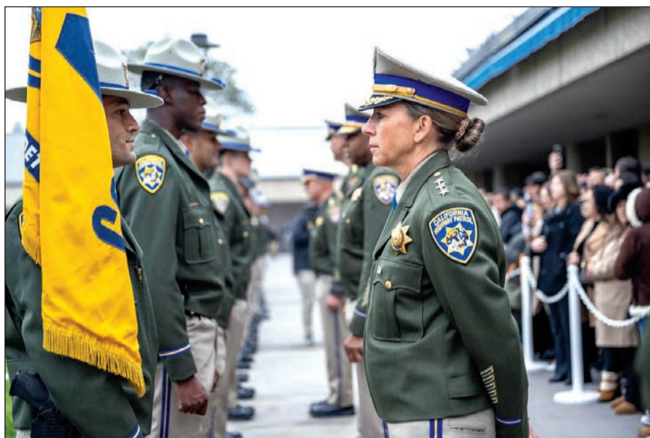
The new officers begin reporting to one of the California Highway Patrol's 102 Area offices throughout the state on Dec. 15.

Earlier last week, the cadets took part in a five-mile run as one of their training's last parts. The new officers