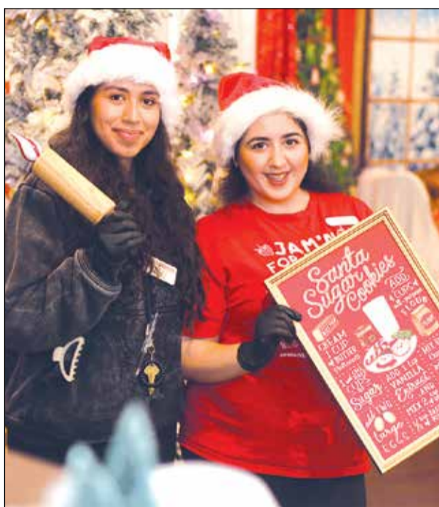
Decked out in Christmas décor residents, staff and guests welcomed the Holiday season.