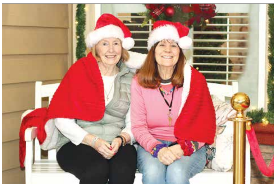
Residents and guests embrace the holiday season during this year’s Summersets Holiday Open House on Dec. 9.