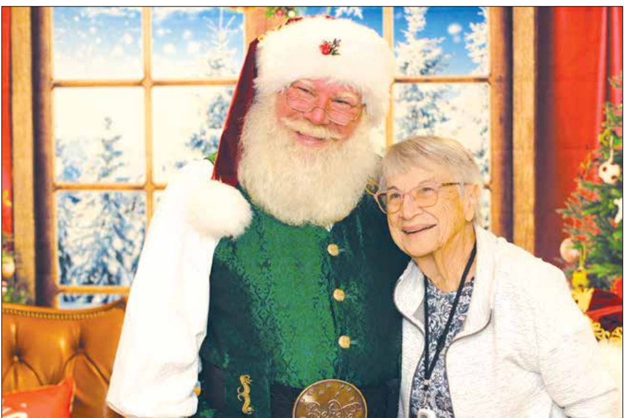
Santa Claus posed for photos with Summerset Senior Living residents at the Winter Wonderland event on Dec. 9.