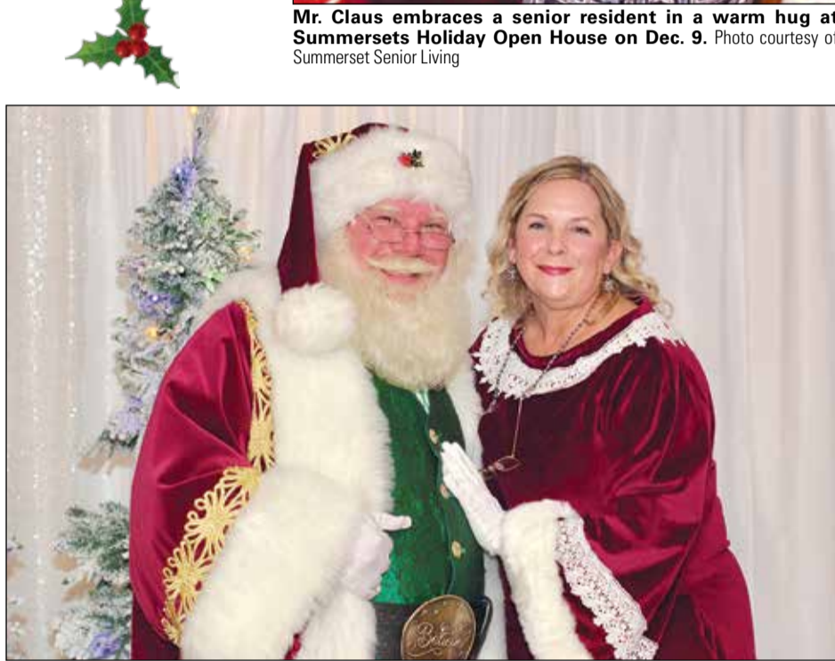
Mr. and Mrs. Claus came all the way from the North Pole to greet residents and guests at Summersets Holiday Open House on Dec. 9.