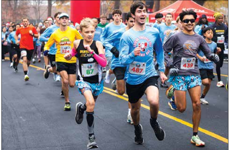
Racers hit the ground running at the 2025 annual PAL Holiday Run in Rancho Cordova.

The race featured multiple race options, including an untimed 1.2-mile family walk/run, a 5K for adults