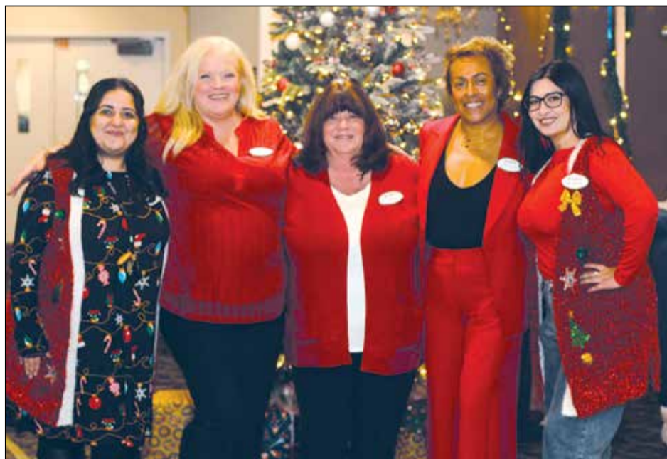
Summerset Senior Living staff said the immersive holiday experience was designed to bring joy not only to residents, but also to their families.

special. If you have to be in a place like this.” Family members visiting residents said the event