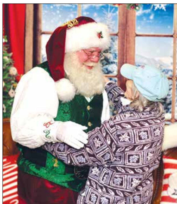
Mr. Claus embraces a senior resident in a warm hug at Summersets Holiday Open House on Dec. 9.