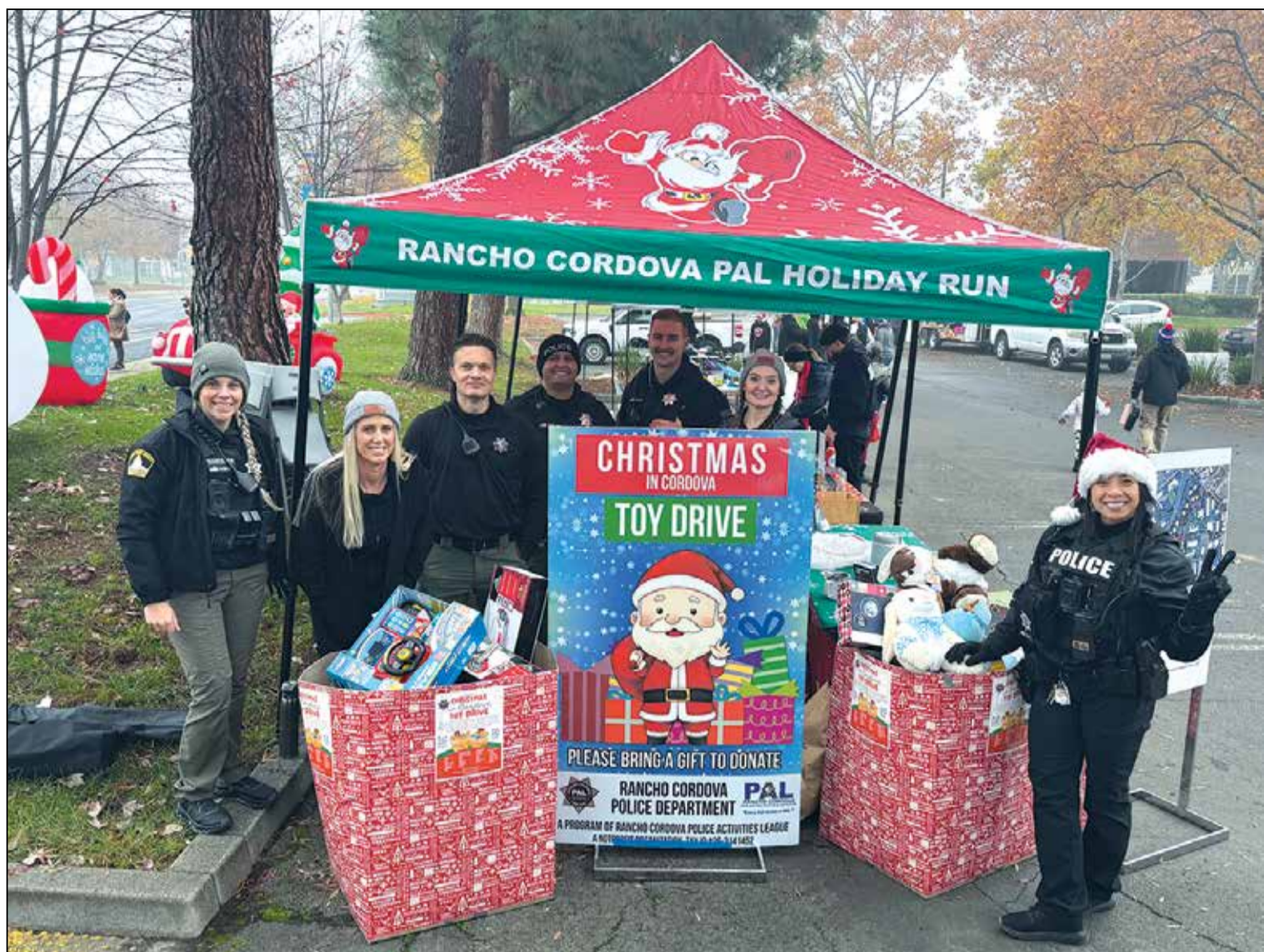
Rancho Cordova Police Department officers show off all the donations given by the community for Christmas in Cordova Toy Drive.

For some attendees, the event was as much about community spirit as competition.