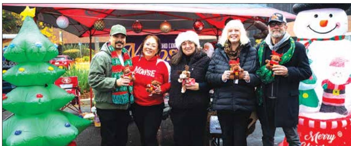
Rancho Cordova Moose Lodge was one of the many community organizations in attendance at the 2025 annual PAL Holiday Run.

For more information on race results visit https://palholidayrun.com/ . ★