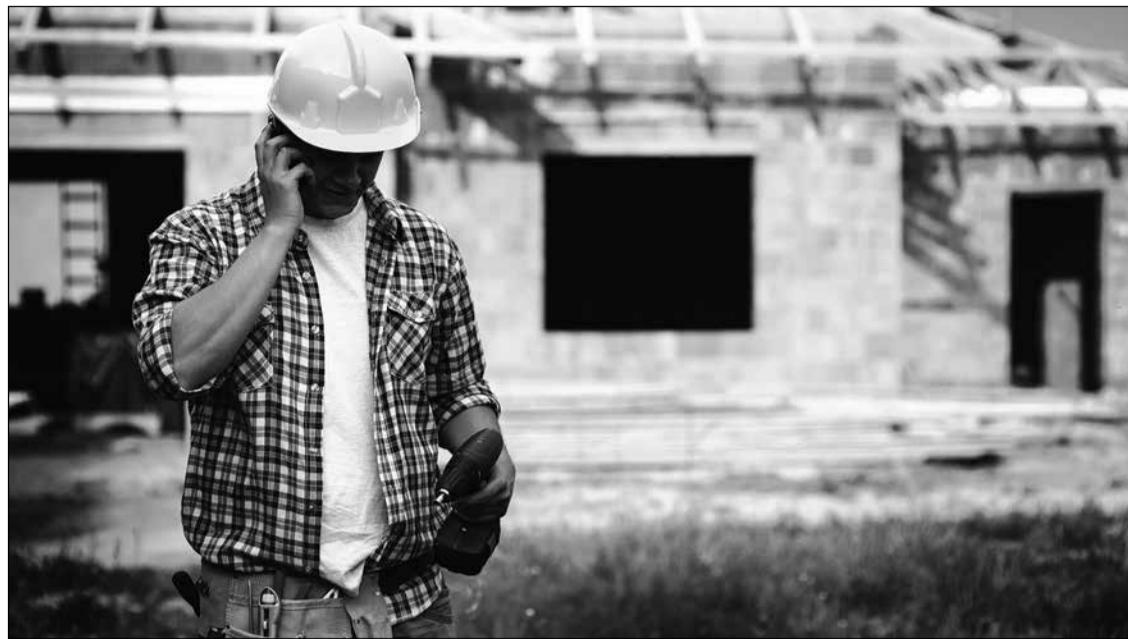
"High fees mean that only higher-priced homes can be profitably built, which adds to the region's growing housing affordability crisis," Murphy said. "But the study shows that rising fee burdens have reached the point where some projects may not be feasible."

"Housing production in our region is already far below levels needed to meet the need for new housing. Rather than adding to the cost to build, our partners in local