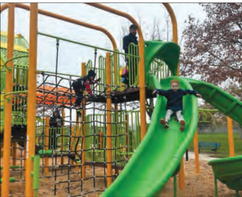
Children and parents enjoy the amenities featured at the new sensory playground at the Sports Complex located at 1022 Caroline Ave.