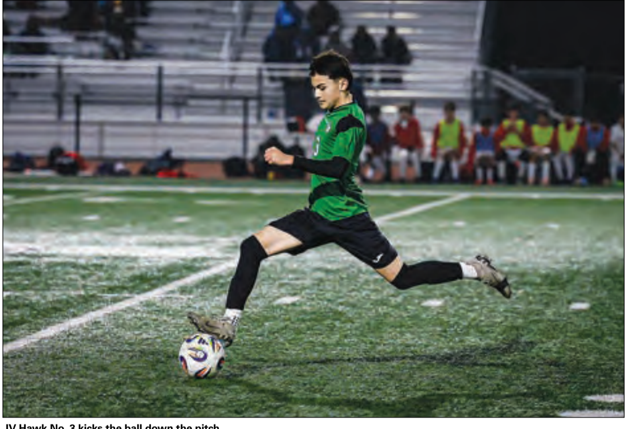
JV Hawk No. 3 kicks the ball down the pitch.

With a 2-0 league record firmly in hand, the Hawks will look to carry their momentum into their next matchup against Tokay on Dec. 29 at 4:30 p.m. If its recent form is any indication, Liberty Ranch is a team that gets better with every challenge it faces. ★