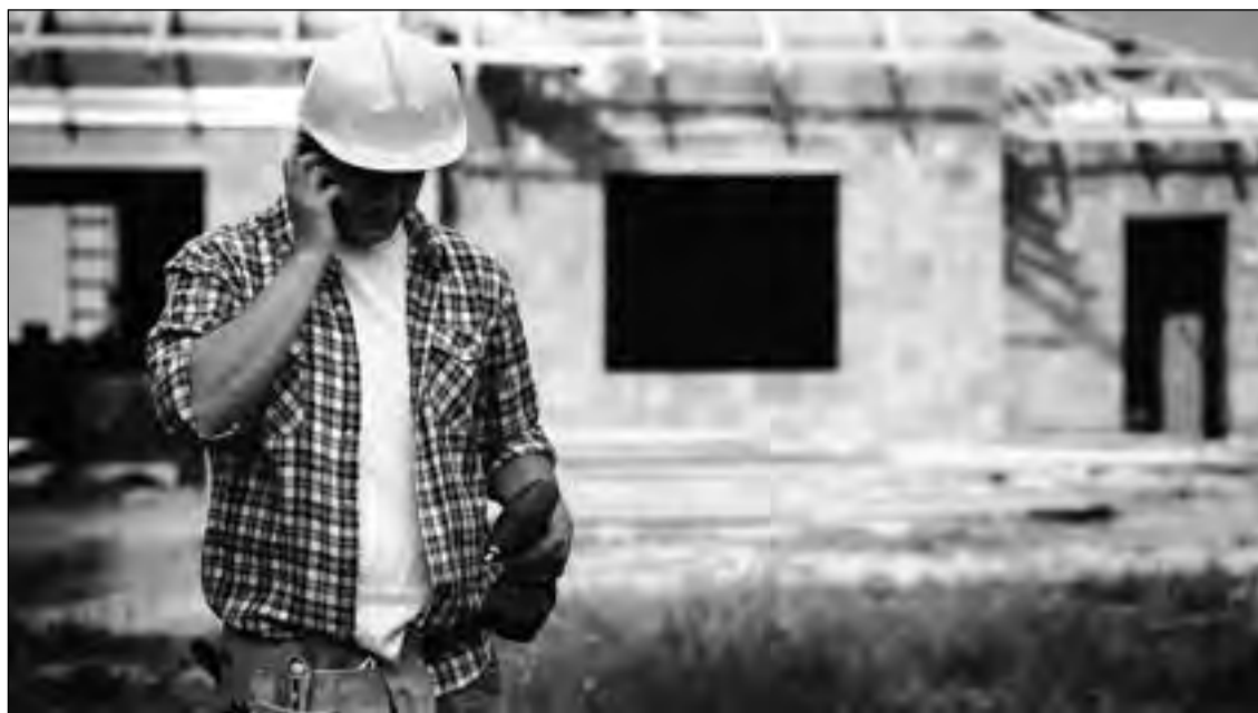
"High fees mean that only higher-priced homes can be profitably built, which adds to the region's growing housing affordability crisis," Murphy said. "But the study shows that rising fee burdens have reached the point where some projects may not be feasible."

"Housing production in our region is already far below levels needed to meet the need for new housing. Rather than adding to the cost to build, our partners in local