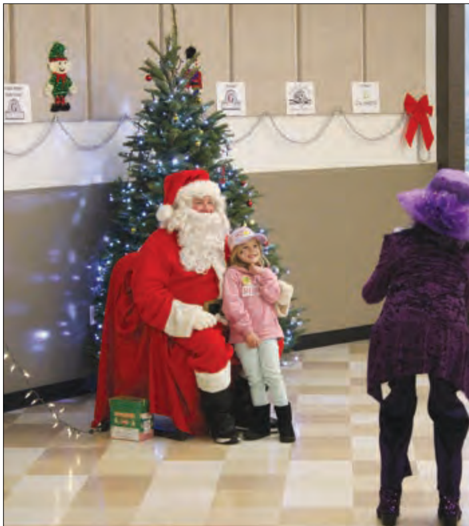
A parent takes a photo of Santa with her child at the Galt Sunrise Rotary Club community dinner.

Club's biggest event of the year and serves as a way to give back to the community. Its efforts continued