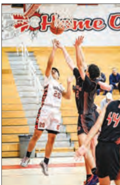
Warrior No. 20 battles through the Summerville defense for a shot attempt.

Story and photos by Paige Lampson Sports Editor