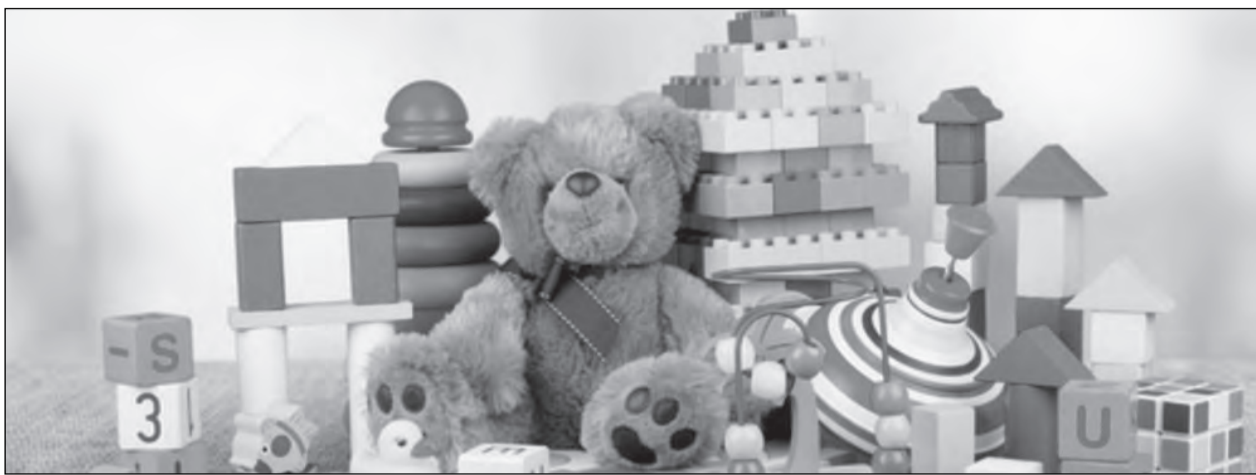
The Galt Police Department and Cosumnes Fire Department are proud to host this year's Toy Drive, and we're inviting our community to help make the season brighter for local children. Drop a new, unwrapped toy at any of our convenient donation stations, including the Police Department lobby, Fire Stations 45 and 46, and L'Chayim of Galt/Barsetti Vineyards tasting room. Hours may vary by location. Donation map at toydrive.galtca.org.

spectacular Christmas production is your ticket to creating unforgettable memories with your loved ones. We're transforming the fairgrounds into a Christmas paradise, including carnival rides, photos with Santa, games and play zone, face painting, a synthetic ice-skating rink and more. Tickets available at Eventbrite.com . 1658 S. Airport Way, Stockton.