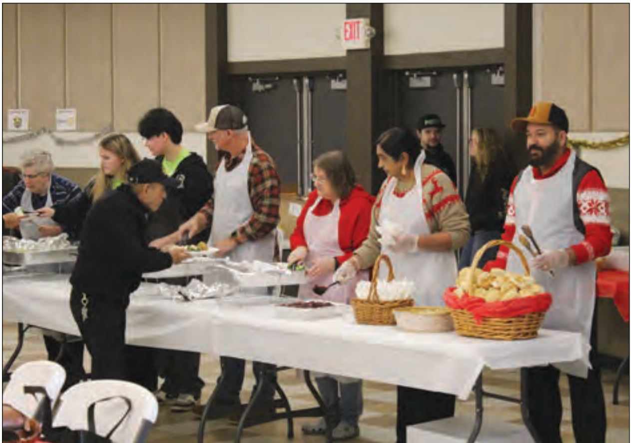
Pictured is the start of the 15th annual Galt Sunrise Rotary Club community dinner Dec. 13 with residents beginning to receive dinner.