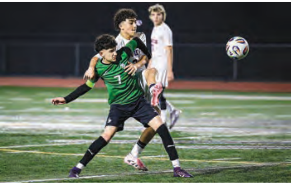
JV Hawk No. 7 wrestles to control the ball.