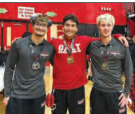
The Warrior Boys Varsity wrestlers show off their medals.