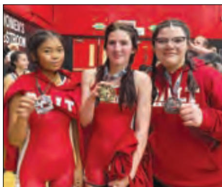
Galt Varsity Girls wrestlers pose with their medals.