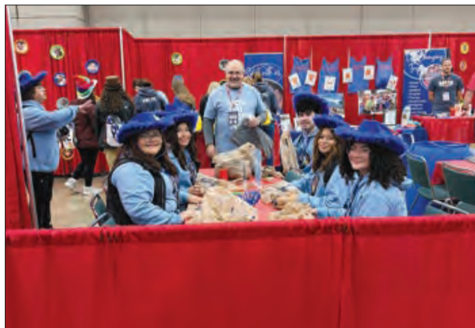
St. Christopher's Church youth members make sleeping mats out of plastic bags for the homeless community of Indianapolis.