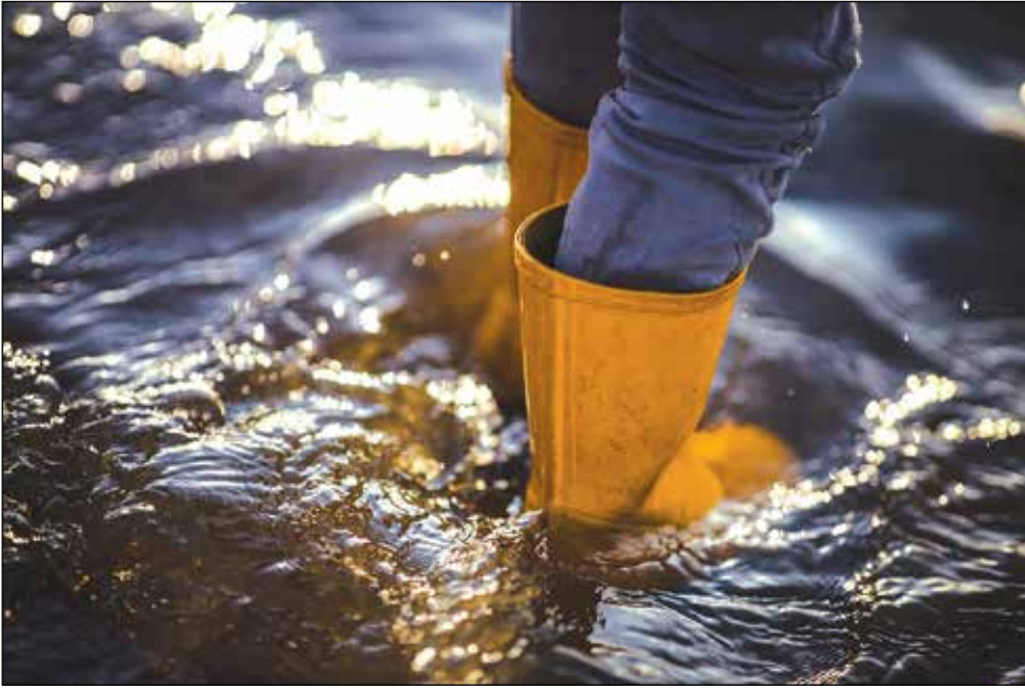
Local agencies are working to collect as much of that stormwater as possible for future use.