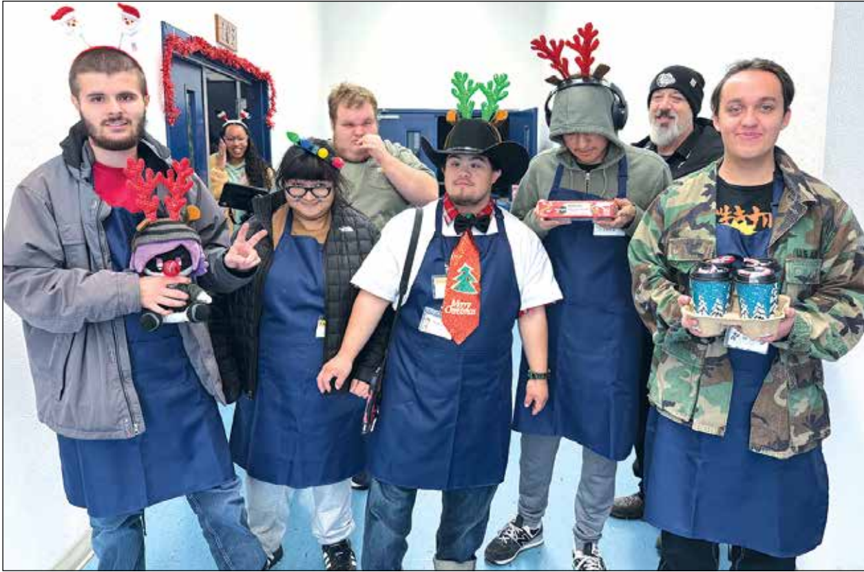
The Adult Extensive Needs program at Gridley High School assists individuals with disabilities transition into the adult world.