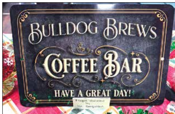
Bulldog Brews staff work out of a room in the Guardian Building in which they decorate and set up to reflect the atmosphere of a coffee shop.

GRIDLEY, CA (MPG) -Gridley Unified School District has multiple programs that facilitate the needs of their students, and when the time comes, the needs of those who aren't students anymore. Most notably the Adult Extensive Needs program, which is currently housed at the Gridley High School campus and assists individuals with disabilities transition into the adult world.