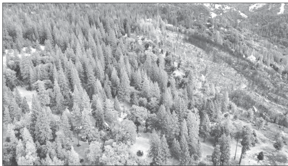
With the help of a recently established fuel break, firefighters were able to contain the Tiger Fire before impacting a nearby community.