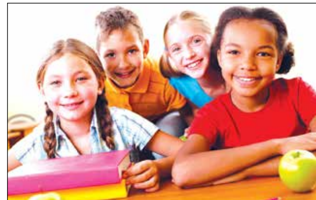
California K-12 schools will have a system in place beginning this year to prevent teachers and other staff from sexually abusing students.

So far, victims have filed more than 1,000 lawsuits against school districts and counties, with some resulting in enormous payouts. A jury in Riverside County in 2023 handed