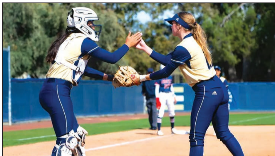
The Aggies will host 28 games in Davis, while hitting the road for their other 25 games.