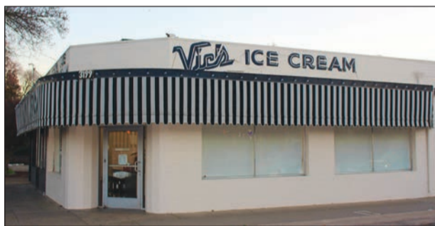
After a 13-month closure and a change in ownership, Vic's Ice Cream reopened at 11 a.m. Jan. 2, looking both familiar and refreshed, as the first patrons waited for nearly two hours in gloomy, rainy weather.