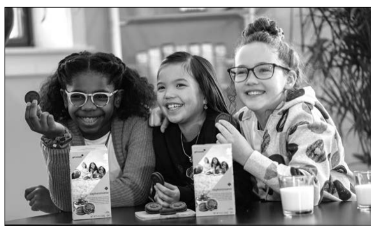
"Exploremores", a rocky road ice cream-inspired sandwich cookie, will join the legendary lineup for the 2026 cookie season.

This year, over 14,000 Girl Scouts in Northern California will