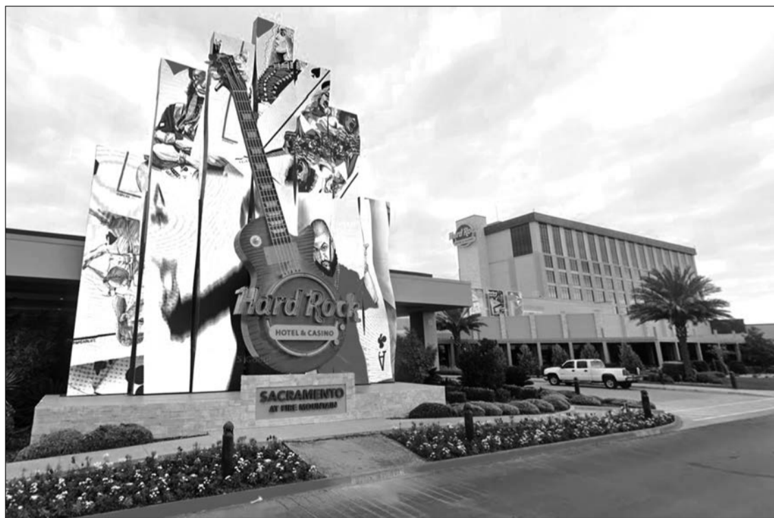
Hard Rock Casino is starting the year strong with a lineup of concerts, UFC fights and more.