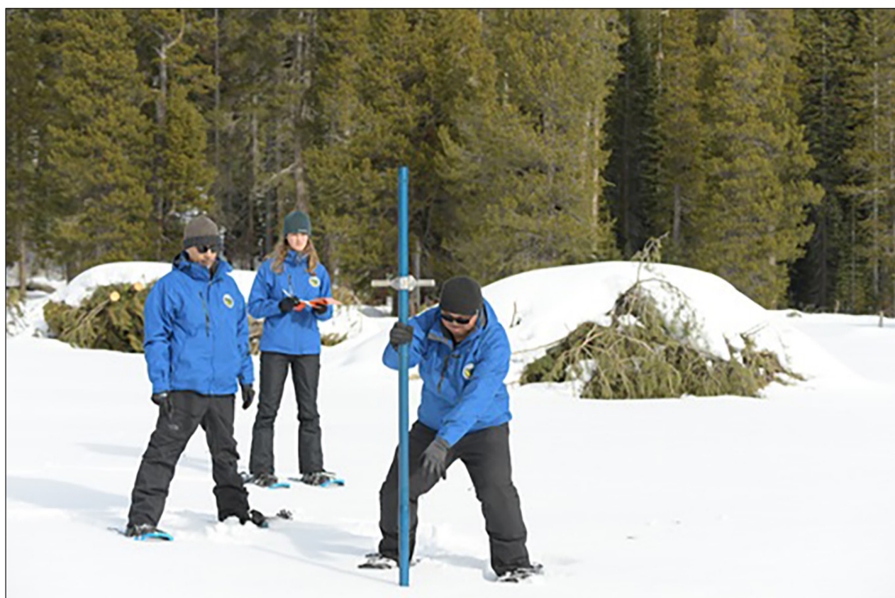
Department of Water Resources staff check snow levels at the January 2020 snow survey.

statewide are currently 123 percent of average thanks to recent precipitation on top of three consecutive years of above-average snowpack conditions.