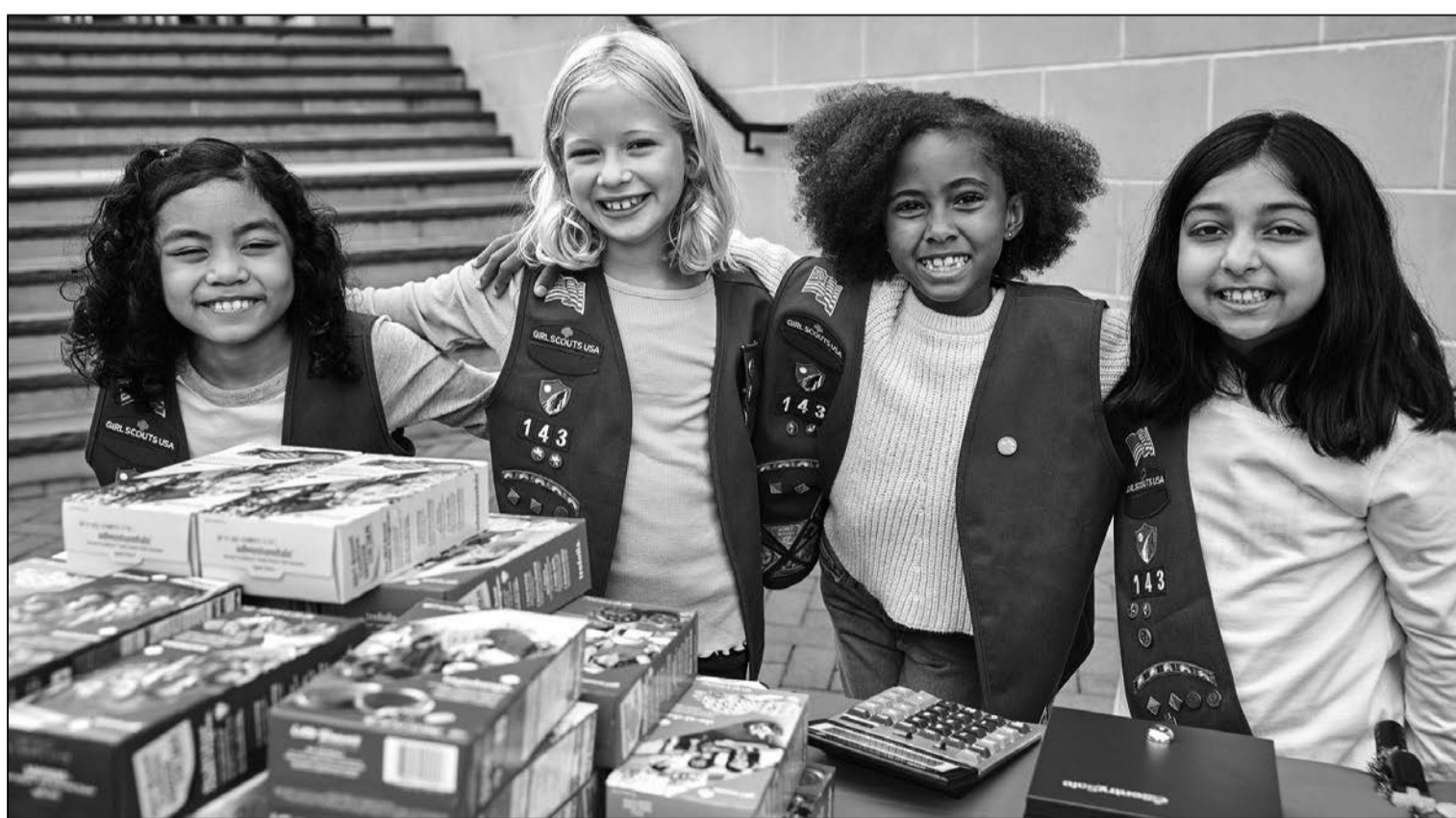
As this year's national sponsor of the cookie program, Bay Area-based Adobe will encourage girls to express their individuality and think creatively as they pursue their goals this cookie season.