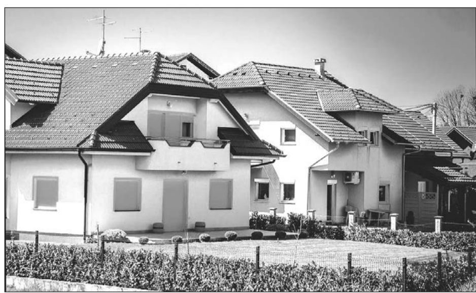
The Safe Homes grant program is designed to help low- and middle-income homeowners with fire mitigation.