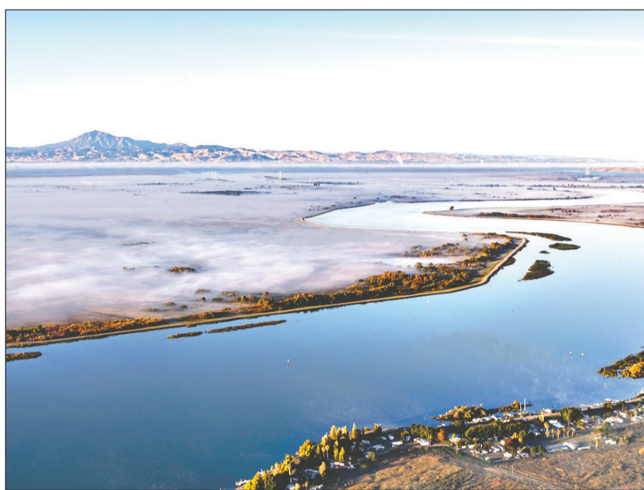
An aerial view in the morning of fog partially covering the San Joaquin River and Webb Tract Island, left, in the Sacramento-San Joaquin Delta. Photo taken Oct. 30, 2025.

The Department of Water Resources conducts four media-oriented snow surveys at Phillips