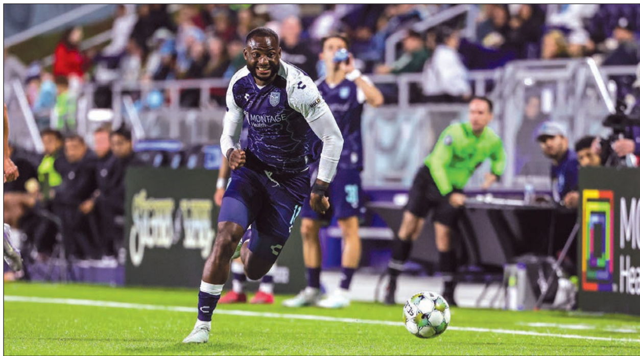
Malango will be available pending league and federation approval and is expected to wear No. 7 for Republic FC.

prominently for Monterey Bay FC during the 2025 USL Championship season, making 29 appearances across league and USL Cup play with five goals and two assists. His contributions included scoring the club's first goal of the