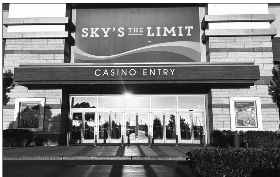
Sky River Casino is located on 1 Sky River Pkwy, Elk Grove and has a full calendar of events.

The event will be broadcast live on YouTube and UFC FIGHT PASS. For the full