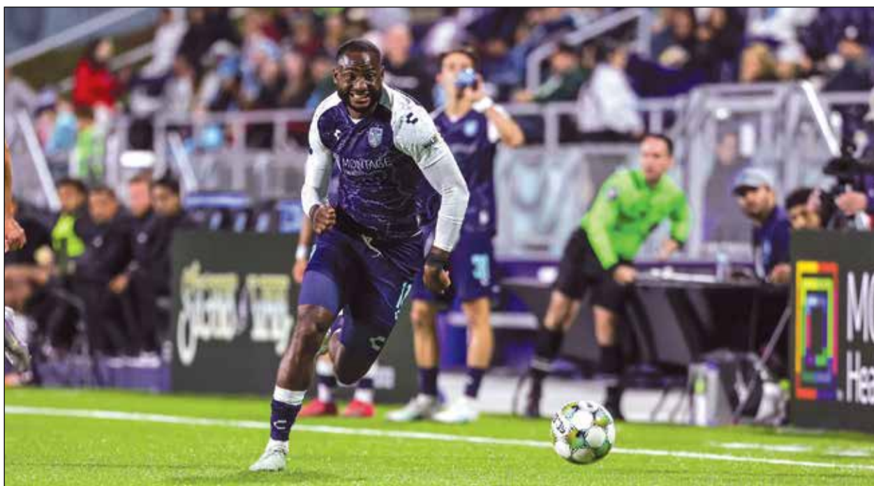
Malango will be available pending league and federation approval and is expected to wear No. 7 for Republic FC.

prominently for Monterey Bay FC during the 2025 USL Championship season, making 29 appearances across league and USL Cup play with five goals and two assists. His contributions included scoring the club’s first goal of the