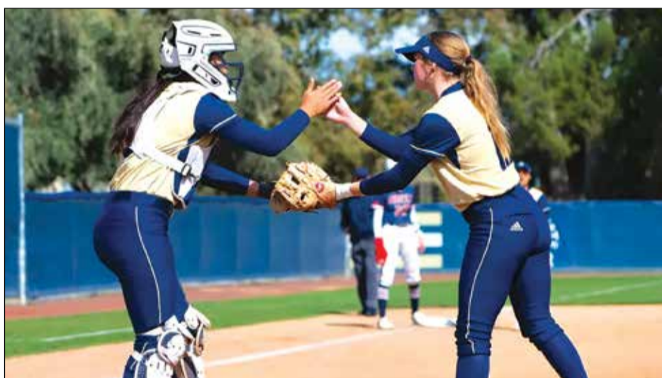
The Aggies will host 28 games in Davis, while hitting the road for their other 25 games.