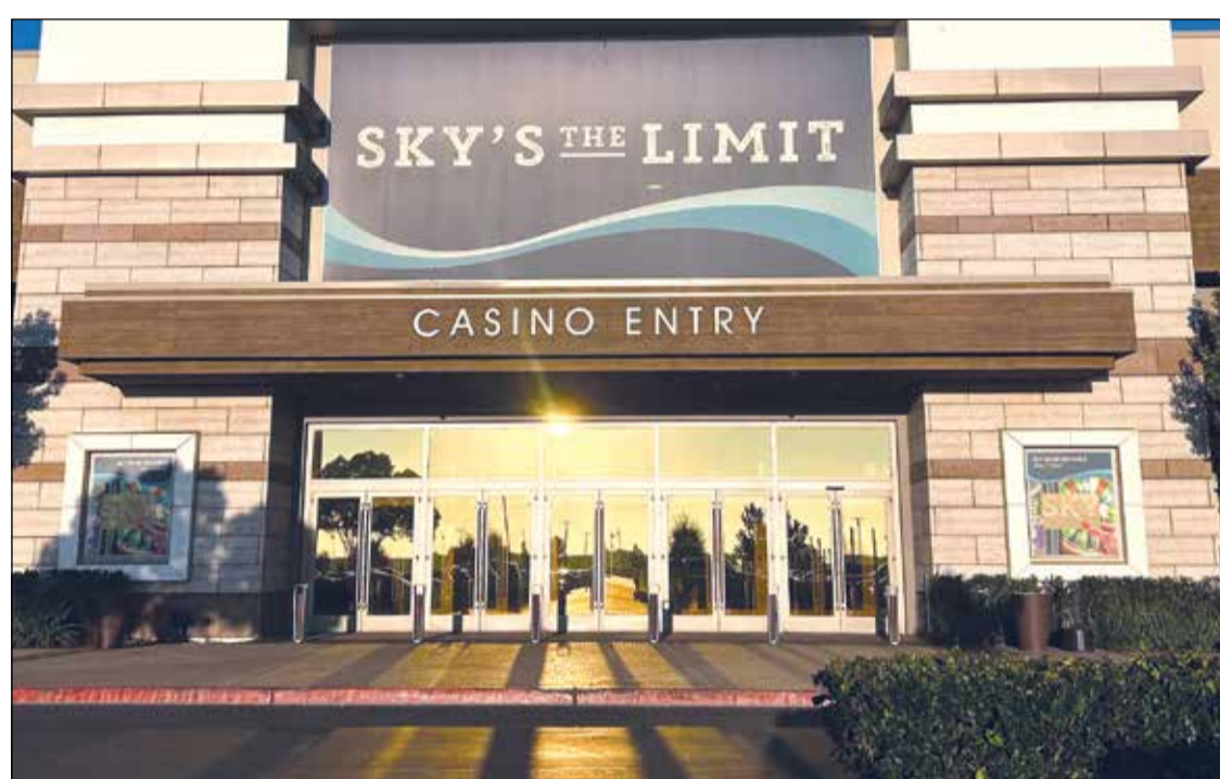
Sky River Casino is located on 1 Sky River Pkwy, Elk Grove and has a full calendar of events.

The event will be broadcast live on YouTube and UFC FIGHT PASS. For the full