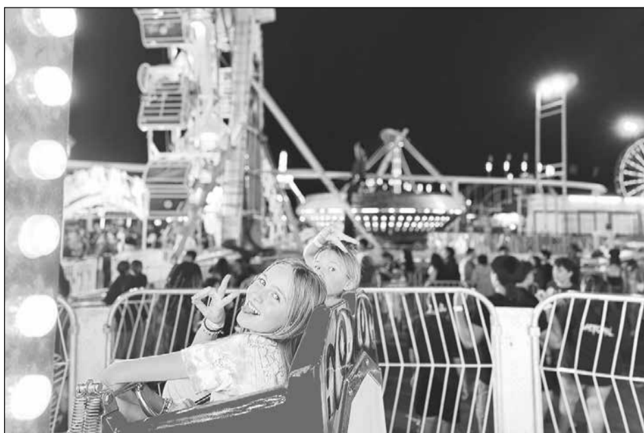
Fairgoers ride a carnival attraction during the California State Fair this past summer in Sacramento. Fair officials announced the event will move to fall dates beginning in 2027.