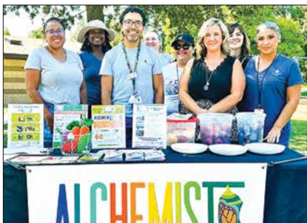
Twice each month, Alchemist (shown with Early Head Start staff at an information table at Stanston Park) is hosting a community meal where families learn to use the produce they receive to make healthy lunches.

The Sacramento County Office of Education has partnered with two local agencies to launch the new project. Sacramento's Goodful farm-fresh food delivery service is helping to distribute the produce boxes. The Alchemist Community Development Corporation is hosting community meals where families create healthy lunches and learn about recipes they can make with the food they receive. Children