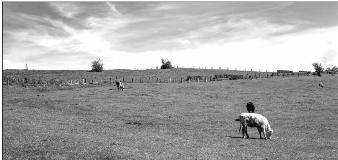
California farmers and ranchers are part of the solution. Grazing, vegetation management and stewardship reduce fuel loads and protect rural communities.

“The budget invests heavily in wildfire response, but funding for proactive strategies on working lands remains limited. California farmers and ranchers are part of the solution. Grazing, vegetation management and stewardship reduce fuel loads and protect rural communities. Expanding