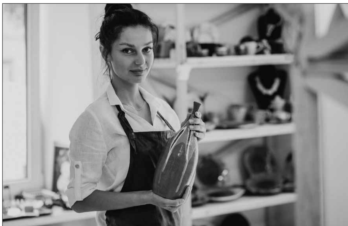
An increase in those expecting better business conditions primarily drove the rise in the Optimism Index.

“For instance, the day before the release of the National Federation of Independent Business’s latest Optimism Index, the U.S. Department of Labor announced in the Federal Register that California has had outstanding advances on its unemployment insurance loans for five consecutive years and as a result, employers here will be paying more in Unemployment Insurance (UI) taxes this year. To cope with the pandemic-caused strain on their unemployment trust funds, 22 states needed to borrow from the federal government in order to keep their Unemployment Insurance trust funds solvent and