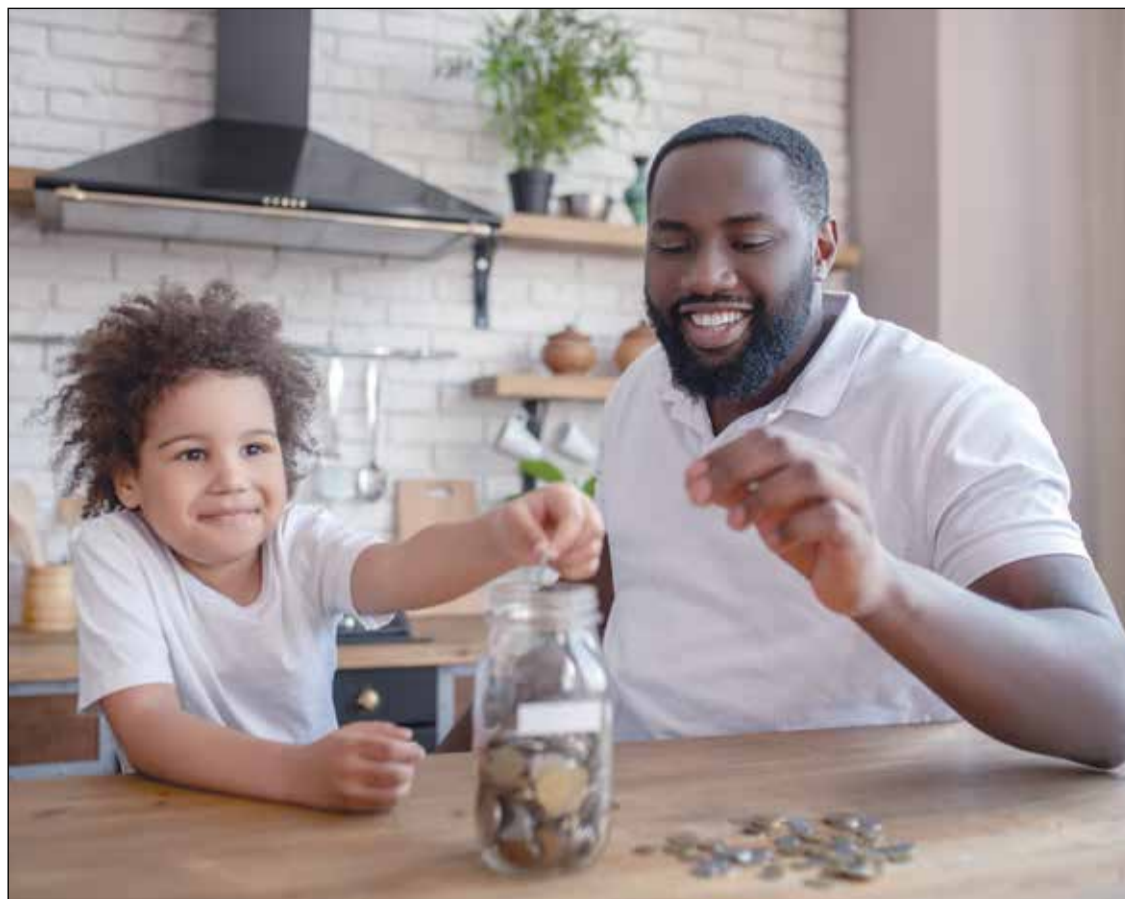
As a cradle-to-career program, CalKIDS helps families connect today's small step to tomorrow's opportunity.