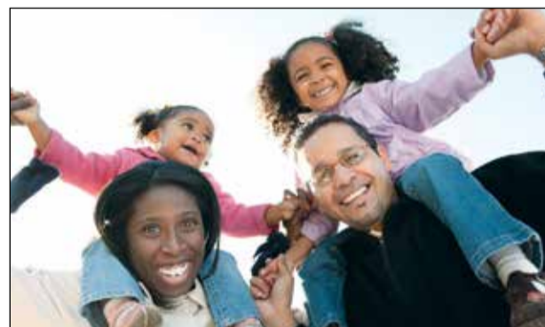
The funded programs are culturally responsive and community-driven, addressing long-standing inequities in early childhood development.

This historic funding decision was led by First 5 Sacramento's Equity in Action Committee, a 15-member body made up of parents, caregivers and community leaders who live in the neighborhoods where the grants will be implemented. Through this committee, First 5 Sacramento implemented a Participatory Grantmaking Model that intentionally