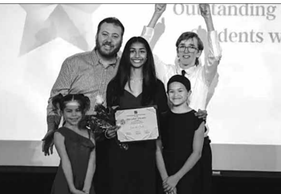
Nominations are now open for the San Juan Unified "You Light the Way" Awards and close Feb. 2.