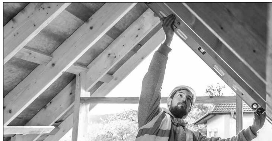
Despite generous builder incentives, many prospective buyers have been holding off until mortgage rates dip below 6 percent.

“Interest rates have been trending downward and fell to an average of 6.19 percent in early January. As financing costs continue to decline, we expect more households to reenter the housing market in 2026,” Murphy said.