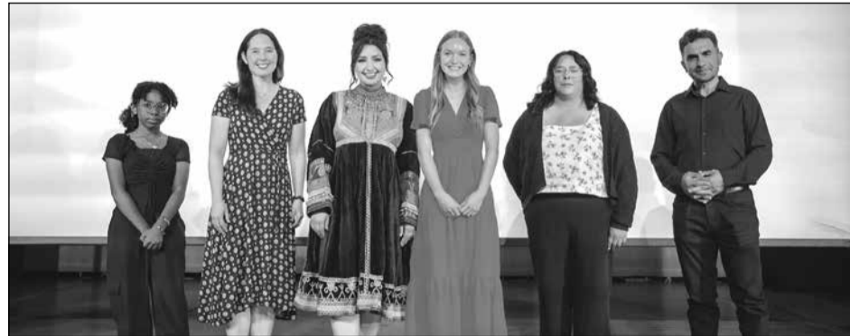
Nominations are now open for the Annual Spirit of San Juan Awards.

Nominate them for a Spirit of San Juan award and help recognize their outstanding contributions in our district this year. Visit sanjuan.edu/spirit to nominate someone today! Nominations are due Feb. 6. ★