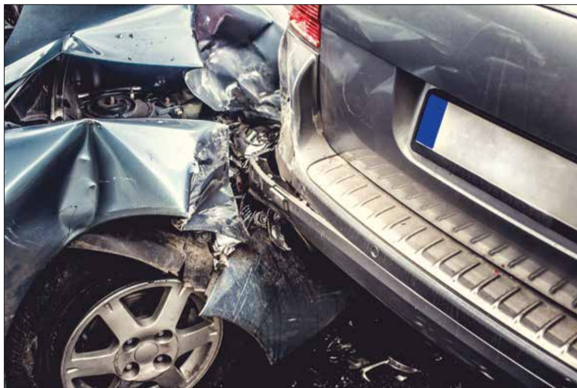
Majority of people support a range of impaired driving countermeasures that could significantly reduce fatalities, according to a new AAA survey.

While many participants acknowledged that impaired driving was unacceptable, some admitted to doing so anyway. That follows other AAA research that found a