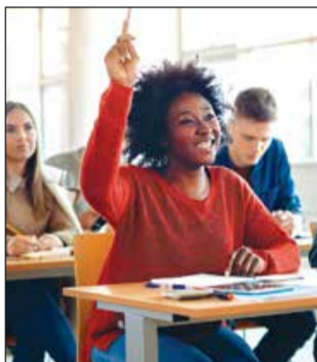
Statewide, more than 60 percent of public school students in grades 2 to 12 are eligible to claim a CalKIDS Scholarship worth up to $1,500.

Claiming a scholarship is quick, easy, and can be done