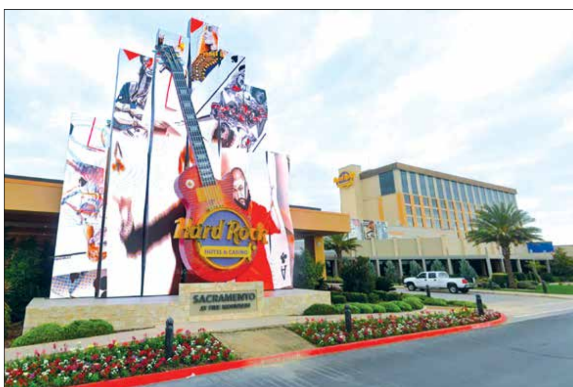
Hard Rock Casino is starting the year strong with a lineup of concerts, UFC fights and more.