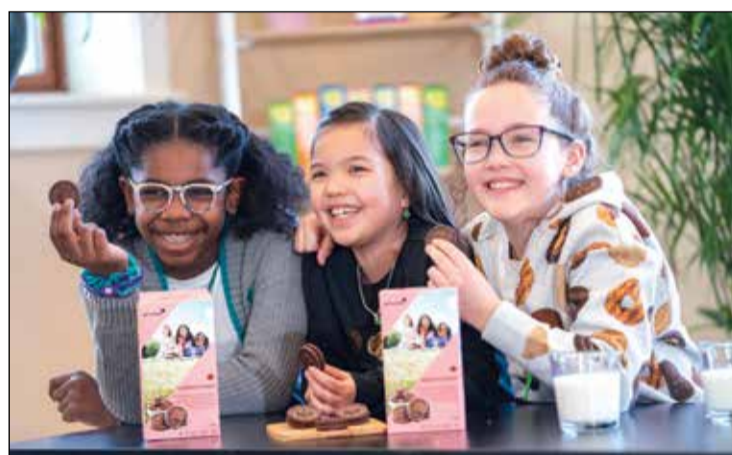
"Exploremores", a rocky road ice cream-inspired sandwich cookie, will join the legendary lineup for the 2026 cookie season.

This year, over 14,000 Girl Scouts in Northern California will