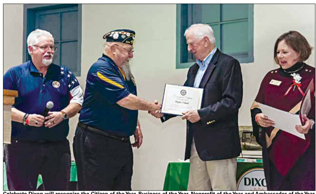
Celebrate Dixon will recognize the Citizen of the Year, Business of the Year, Nonprofit of the Year and Ambassador of the Year, along with Firefighter of the Year, Police Officer of the Year, Veteran of the Year, Educator of the Year, and new categories Dixon Educator of the Year and Dixon Coach of the Year.