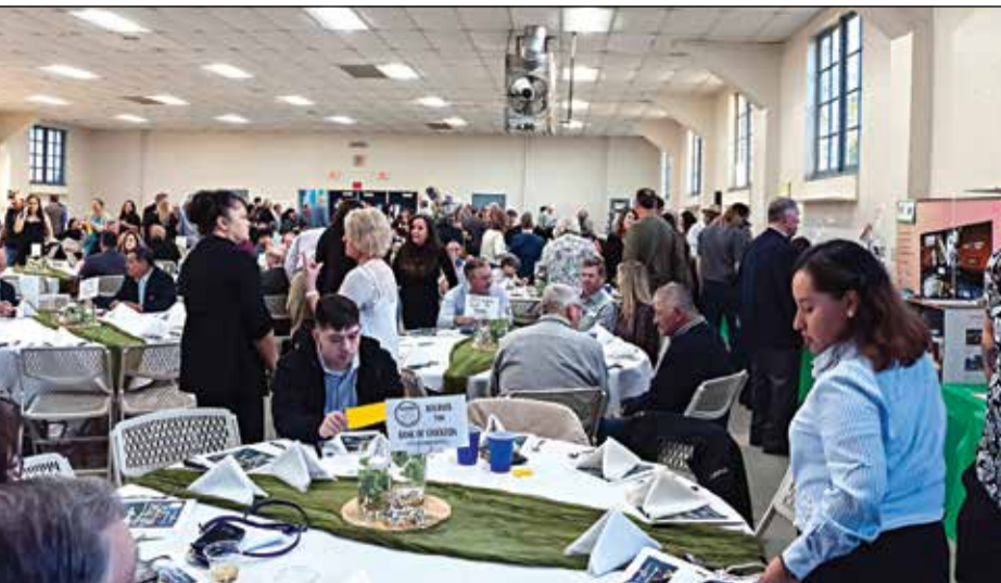
Dixon Chamber of Commerce will host Celebrate Dixon from 5 to 9 p.m. March 14 at Denver Hall, 655 S. First St., recognizing residents, businesses and organizations for contributions to the community.