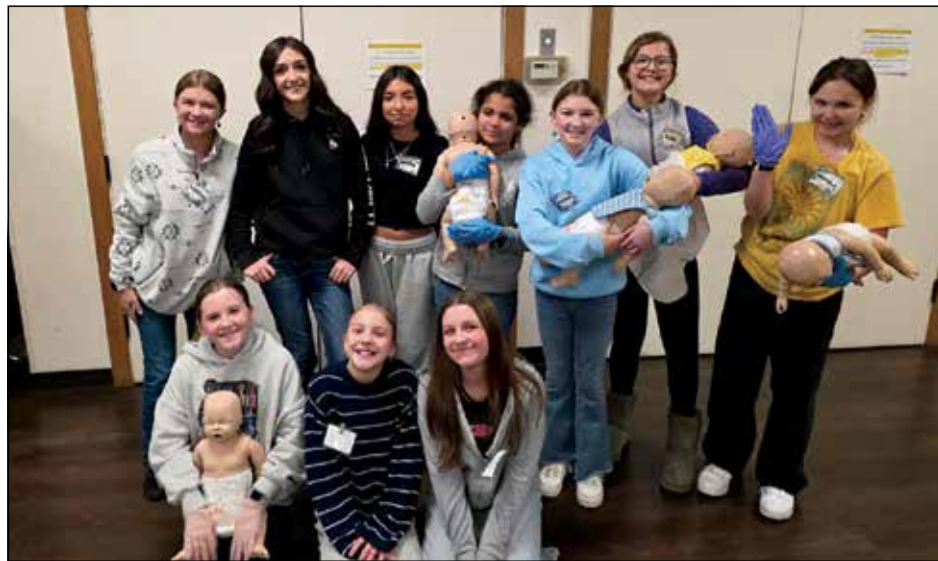
Dixon Parks and Recreation Department is offering a babysitter training course from 2 to 5 p.m. Feb. 17 and 18.