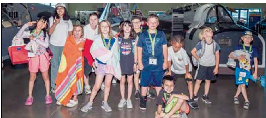
The Aerospace Museum of California's Private Pilot License Scholarship is designed as a comprehensive pilot development pipeline. Courtesy photo.

Aerospace Museum of California News Release