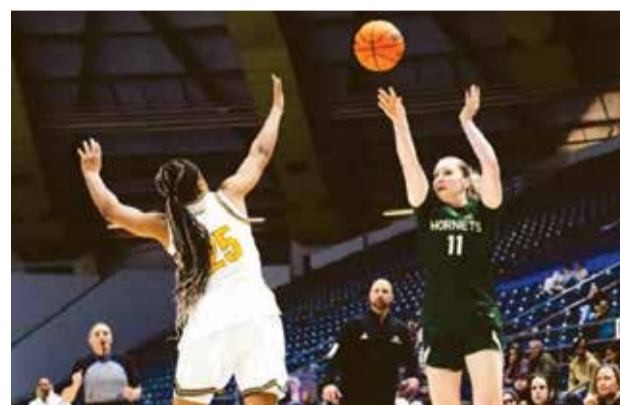
The hot-shooting Hornets hit just over 49 percent from the field for the game and finished with a season-high 11 makes from beyond the arc.