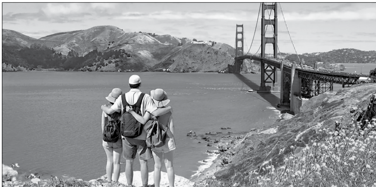
Visit California's comprehensive guide inspires travelers to explore California, complete with an insider's handbook on the state's hidden gems, a Route 66 road map to celebrate the route's centennial, travel tips and more.

Highlights of the 2026 California Visitor's Guide include an insider's handbook to California's most intriguing and lesser-known experiences including an exploration