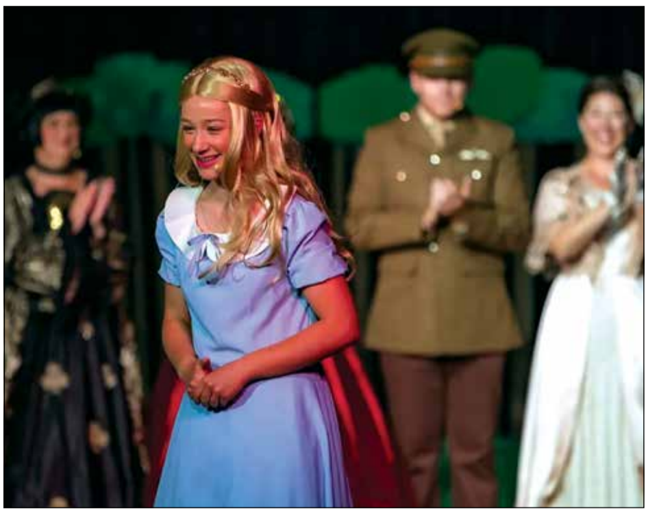
The Dixon Community Theater will premiere its February production, "The House of Frankenstein," at 7 p.m. Feb. 20. Auditions for the theater's second production of the 2026 season, Rodger and Hammerstein's "Cinderella," will also take place in February, beginning Feb. 8.