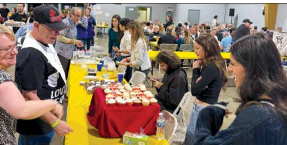
Rotary Club of Dixon will host its 22nd Annual Crab Feed Feb. 28 at Madden Hall at the Dixon May Fairgrounds, continuing a long-running fundraising tradition that supports scholarships and community programs.